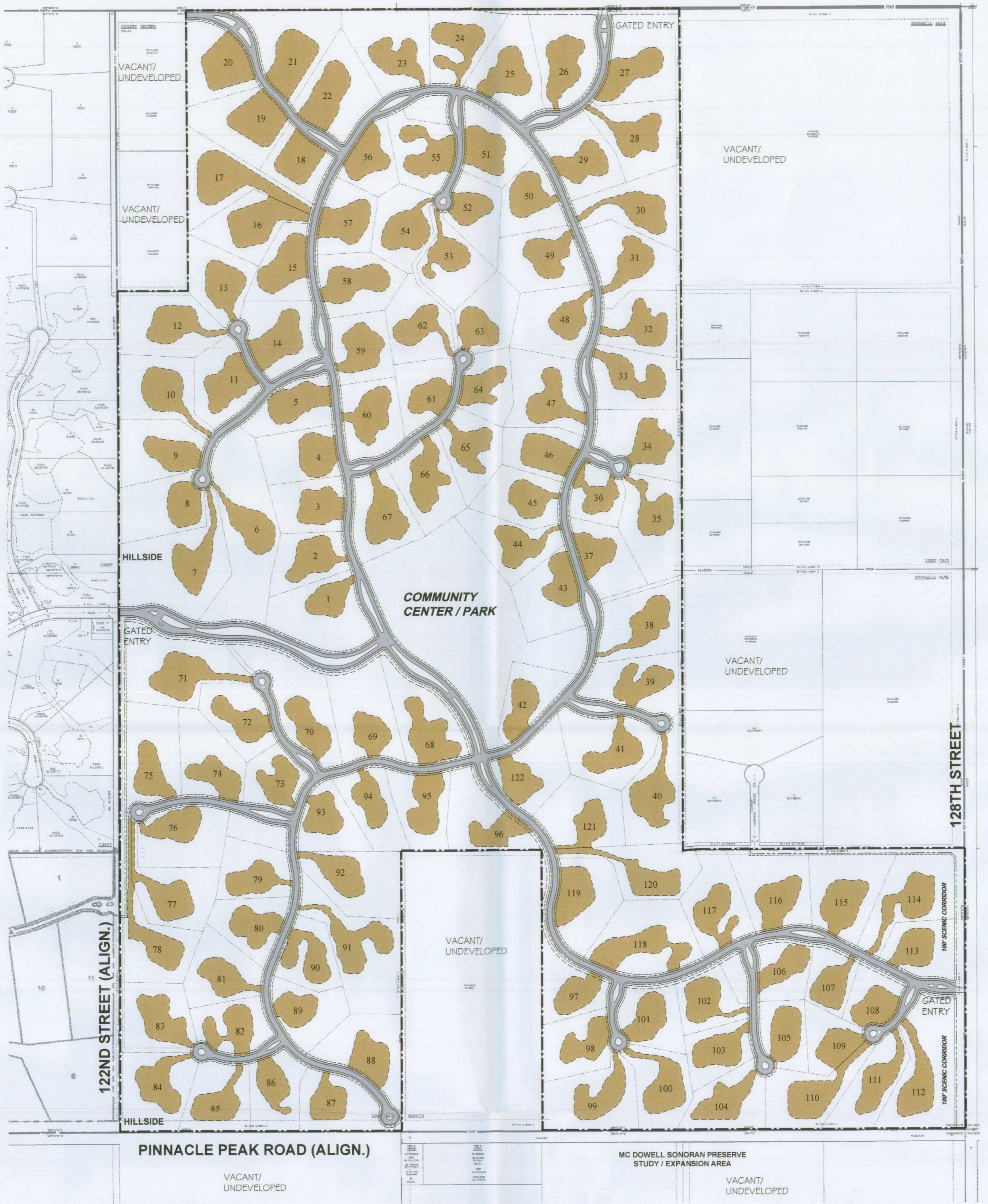
EXHIBIT 2.1: SITE PLAN w/ SURROUNDING PARCEL BOUNDARIES