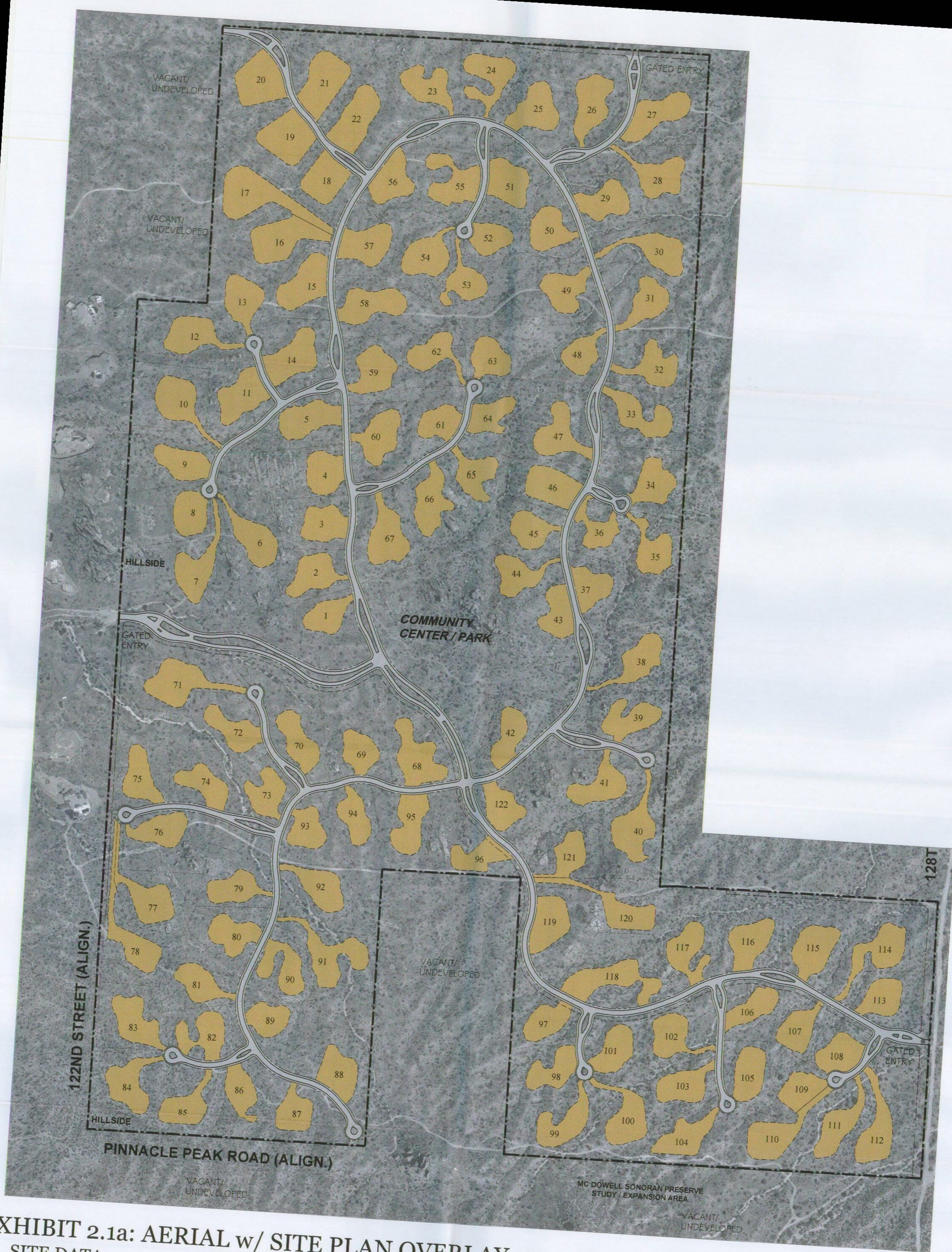
EXHIBIT 2.1a: AERIAL w/ SITE PLAN OVERLAY