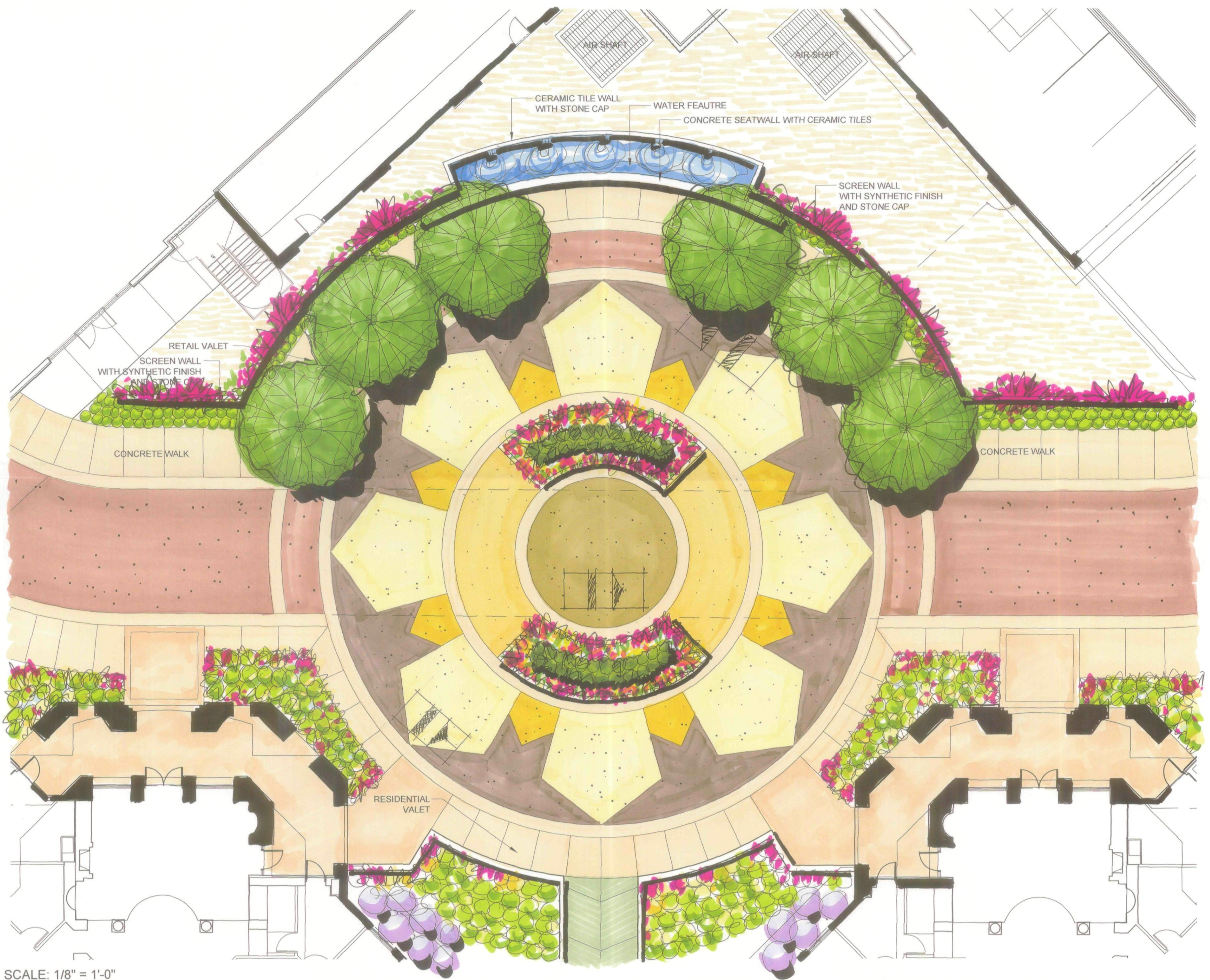
PLAN VIEW SCALE: 1/8" = 1'-0"