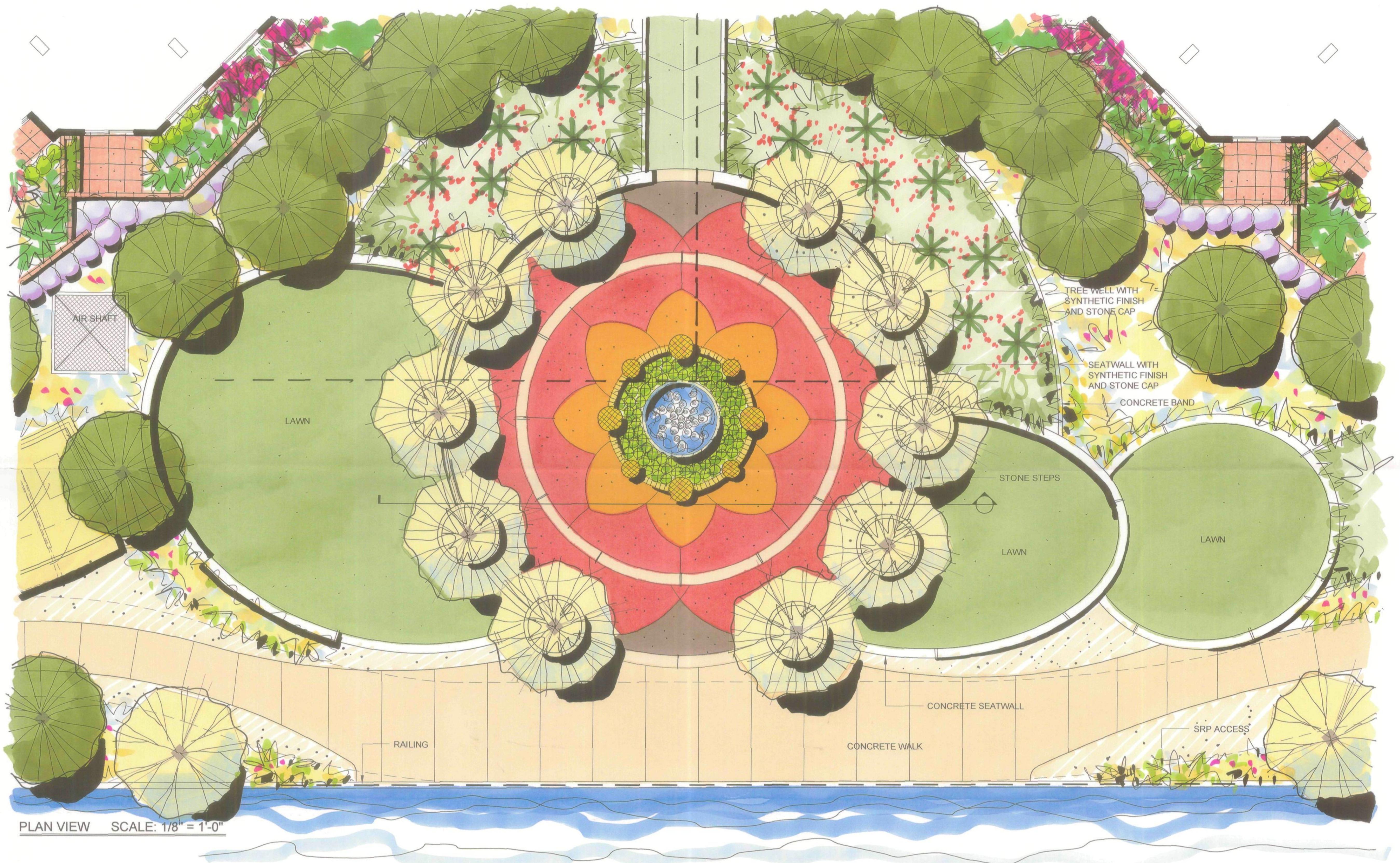
PLAN VIEW SCALE: 1/8" = 1'-0"