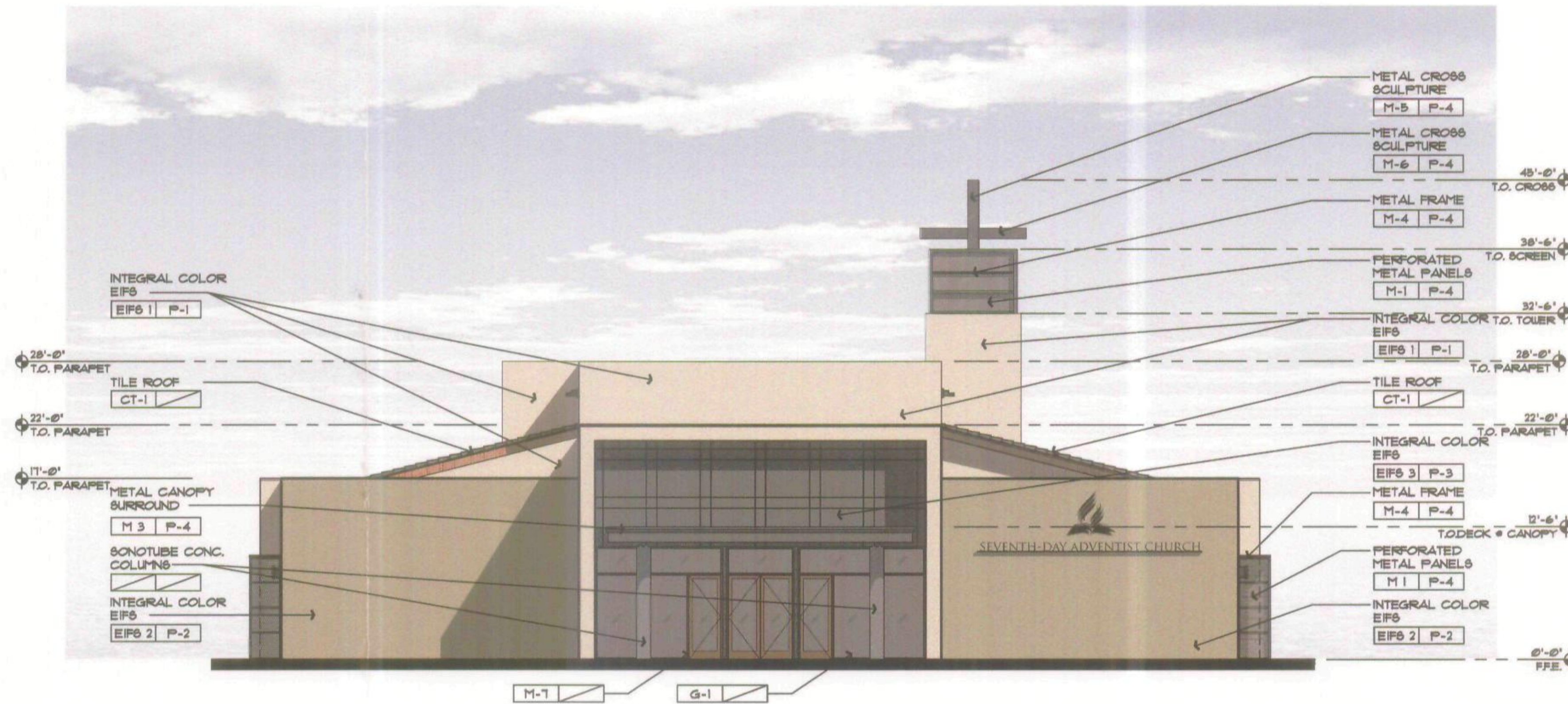
01 SOUTH ELEVATION SCALE: 1/8" = 1'-0" REF: