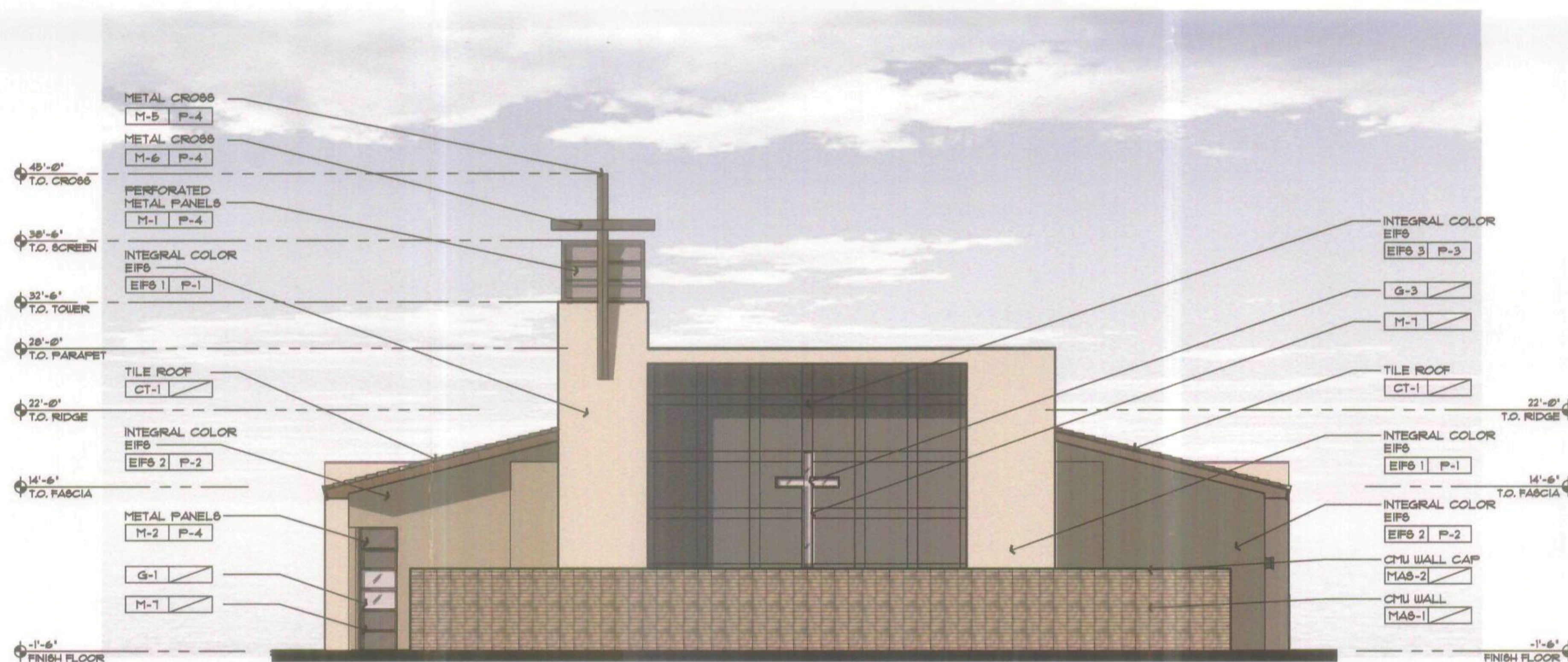
02 NORTH ELEVATION SCALE: 1/8" = 1'-0" REF: