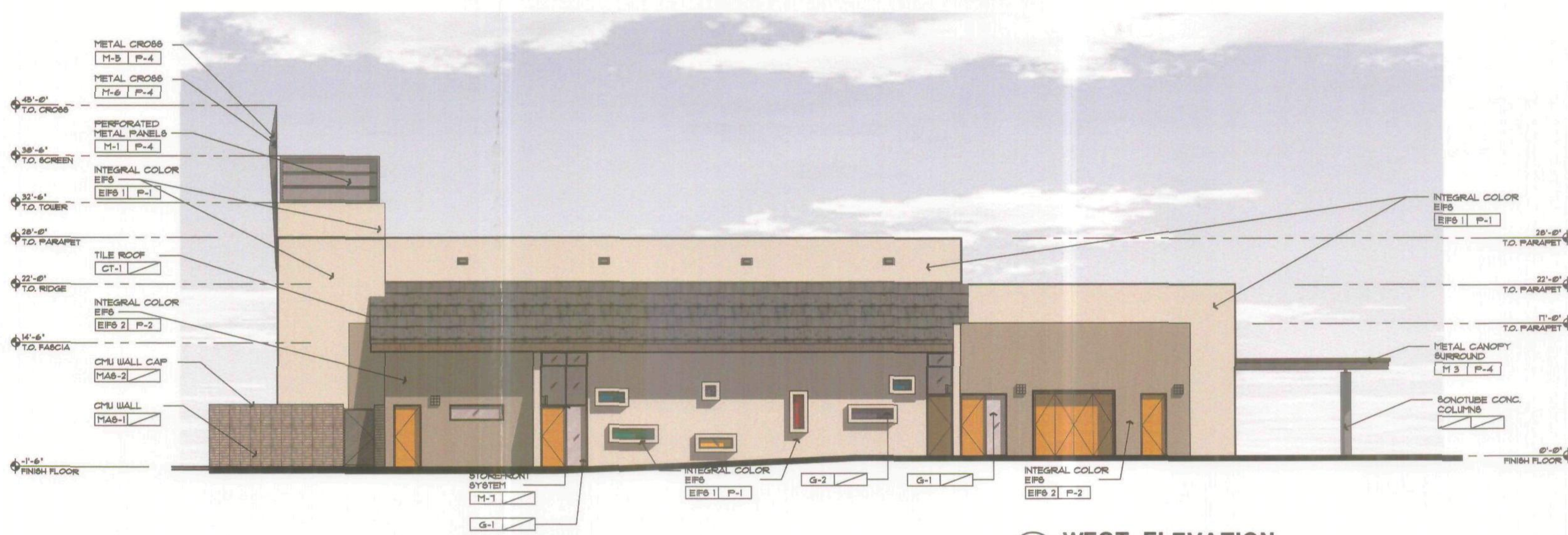
04 WEST ELEVATION SCALE: 1/8" = 1'-0" REF: