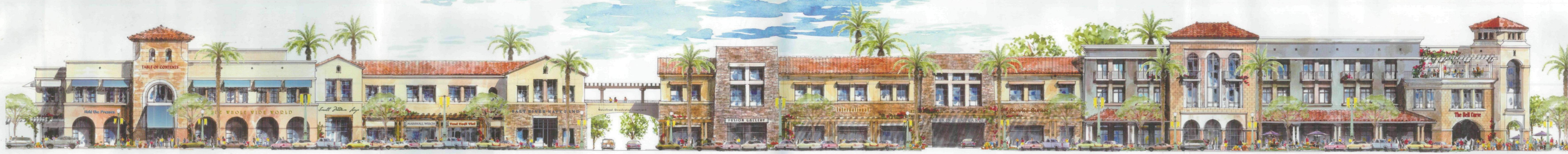
Marshall Way Elevation

ENTITLED ELEVATIONS PRECAST COPINGS FABRIC AWNINGS ANODIZED ALUMINUM WINDOWS ROYAL PALMS LIKE STUCCO FINISH STONE TILE ON TOWER PRECAST BULLNOSE ABOVE 6 FT HIGH STONE TILE WAJNSCOT AT TOWER PRECAST COLUMNS STAINED ROUGH SAWN WOOD TRELIS MUDSET TILE ROOFING PRECAST COPING ANODIZED ALUM WINDOWS ROYAL PALMS STUCCO FINISH ROUND BRICK COLUMNS AND AT TRELIS STAINED ROUGH SAWN WOOD BELLIS MUDSET TILE ROOFING ROUGH SAWN WOOD BEAMS T&G WOOD SOFFIT PRECAST COPING ANODIZED ALUM WINDOWS STACKED STONE VENEER STAINED ROUGH SAWN WOOD TRELIS MUDSET TILE ROOFING PRECAST COPING ANODIZED ALUM WINDOWS ROYAL PALMS STUCCO FINISH ROUND BRICK COLUMNS AT 2ND FLR WINDOWS AND AT TRELIS STAINED ROUGH SAWN WOOD BELLIS MUDSET TILE ROOFING PRECAST COPING STONE TILE CLADDING PRECAST WINDOW SILLBOARDS AND SILLS STONE WAJNSCOT TO 8 FT HIGH