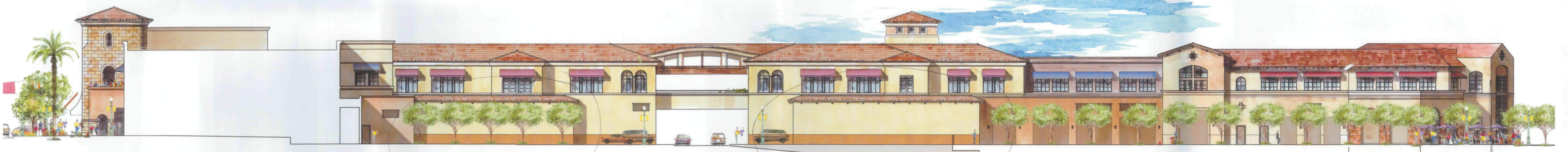
EAST SIDE (BACK) OF MARSHALL WAY

EIFS COPINGS FABRIC AWNINGS ANODIZED ALUMINUM WINDOWS STANDARD EIFS FINISH SCORED EIFS TO IMITATE STONE ON TOWER PRECAST BULLNOSE ABOVE 6 FT HIGH STONE TILE WAINSCOT AT TOWER PRECAST COLUMNS STAINED ROUGH SAWN WOOD TRELLIS MUDSET TILE ROOFING EIFS COPING WOOD CLAD BEAMS ANODIZED ALUM WINDOWS ROYAL PALMS EIFS FINISH ROUND BRICK COLUMNS STAINED ROUGH SAWN WOOD TRELLIS EIFS COPING FABRIC AWNINGS ANODIZED ALUMINUM WINDOWS STANDARD EIFS FINISH EIFS BULLNOSE AT TOP OF 3 FT HIGH STONE TILE WAINSCOT MUDSET TILE ROOFING WOOD BEAM TAILS T&G WOOD SOFFIT ROYAL PALMS STUCCO FINISH ANODIZED ALUMINUM WINDOWS FABRIC AWNINGS PRECAST COPING AT TOP OF 3 FT HIGH STONE TILE WAINSCOT