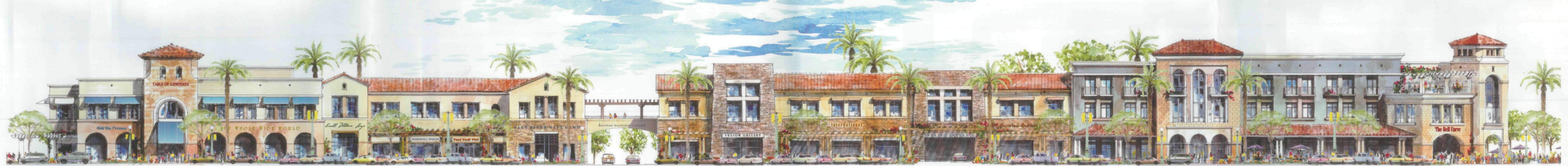
Marshall Way Elevation

ENTITLED ELEVATIONS PRECAST COPINGS FABRIC AWNINGS ANODIZED ALUMINUM WINDOWS ROYAL PALMS LIKE STUCCO FINISH STONE TILE ON TOWER PRECAST BULLNOSE ABOVE 6 FT HIGH STONE TILE WAJNSCOT AT TOWER PRECAST COLUMNS STAINED ROUGH SAWN WOOD TRELLIS MUDSET TILE ROOFING PRECAST COPING ANODIZED ALUM WINDOWS ROYAL PALMS STUCCO FINISH ROUND BRICK COLUMNS AND AT TRELLIS STAINED ROUGH SAWN WOOD TRELLIS MUDSET TILE ROOFING ROUGH SAWN WOOD BEAMS TAG WOOD SOFFIT PRECAST COPING ANODIZED ALUM WINDOWS STACKED STONE VENEER STAINED ROUGH SAWN WOOD TRELLIS MUDSET TILE ROOFING PRECAST COPING ANODIZED ALUM WINDOWS ROYAL PALMS STUCCO FINISH ROUND BRICK COLUMNS AT 2ND FLR WINDOWS AND AT TRELLIS STAINED ROUGH SAWN WOOD TRELLIS MUDSET TILE ROOFING PRECAST COPING STONE TILE CLADDING PRECAST WINDOW SCREENS AND SILLS STONE WAJNSCOT TO 8 FT HIGH