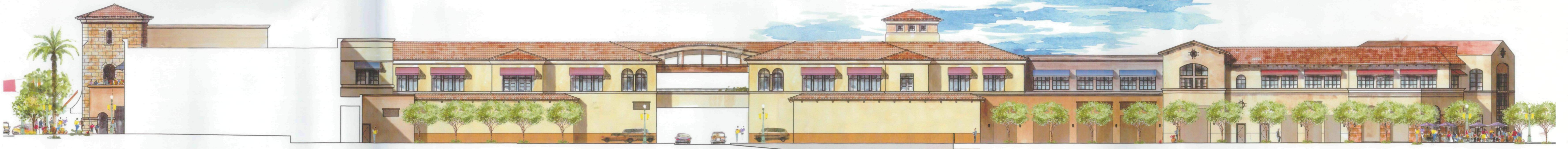
EAST SIDE (BACK) OF MARSHALL WAY

EIFS COPINGS FABRIC AWNINGS ANODIZED ALUMINUM WINDOWS STANDARD EIFS FINISH SCORED EIFS TO IMITATE STONE ON TOWER PRECAST BULLNOSE ABOVE 6 FT HIGH STONE TILE WAINSCOT AT TOWER PRECAST COLUMNS STAINED ROUGH SAWN WOOD TRELLIS MUDSET TILE ROOFING EIFS COPING WOOD CLAD BEAMS ANODIZED ALUM WINDOWS ROYAL PALMS EIFS FINISH ROUND BRICK COLUMNS STAINED ROUGH SAWN WOOD TRELLIS EIFS COPING FABRIC AWNINGS ANODIZED ALUMINUM WINDOWS STANDARD EIFS FINISH EIFS BULLNOSE AT TOP OF 3 FT HIGH STONE TILE WAINSCOT MUDSET TILE ROOFING WOOD BEAM TAILS T&G WOOD SOFFIT ROYAL PALMS STUCCO FINISH ANODIZED ALUMINUM WINDOWS FABRIC AWNINGS PRECAST COPING AT TOP OF 3 FT HIGH STONE TILE WAINSCOT