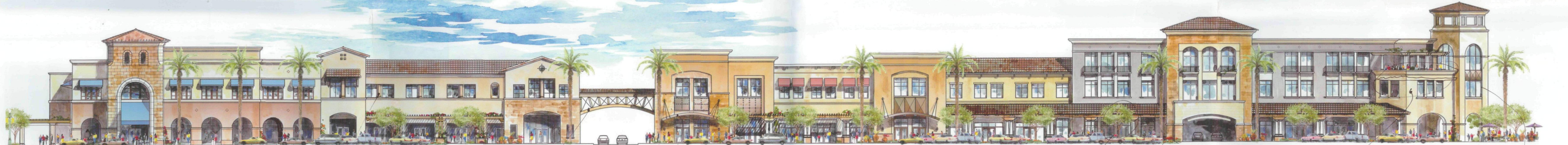
COMPARISON OF MARSHALL WAY ELEVATIONS-ENTITLED VS SUBMITTED FOR PERMIT

ENTITLED ELEVATIONS EIFS COPINGS FABRIC AWNINGS ANODIZED ALUMINUM WINDOWS STANDARD EIFS FINISH SCORED EIFS TO IMITATE STONE ON TOWER PRECAST BULLNOSE ABOVE 6 FT HIGH STONE TILE WAJNSCOT AT TOWER PRECAST COLUMNS STAINED ROUGH SAWN WOOD TRELLIS MUDSET TILE ROOFING EIFS COPING WOOD CLAD BEAMS ANODIZED ALUM WINDOWS ROYAL PALMS EIFS FINISH ROUND BRICK COLUMNS STAINED ROUGH SAWN WOOD TRELLIS EIFS COPINGS FABRIC AWNINGS ANODIZED ALUMINUM WINDOWS STANDARD EIFS FINISH SCORED EIFS TO IMITATE STONE ON TOWER PRECAST BULLNOSE ABOVE 6 FT HIGH STONE TILE WAJNSCOT AT TOWER PRECAST COLUMNS STAINED ROUGH SAWN WOOD TRELLIS MUDSET TILE ROOFING EIFS COPING WOOD CLAD BEAMS ANODIZED ALUM WINDOWS ROYAL PALMS STUCCO FINISH ROUND BRICK COLUMNS STAINED ROUGH SAWN WOOD TRELLIS MUDSET TILE ROOFING EIFS COPING STAINED ROUGH SAWN WOOD TRELLIS EIFS BULLNOSE EIFS WAJNSCOT