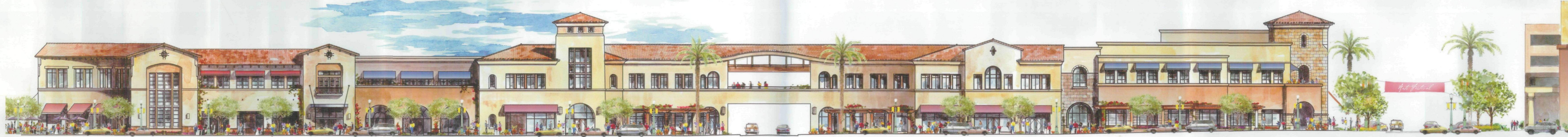
CAMELBACK ROAD ELEVATION

ENTITLED ELEVATIONS MUDSET TILE ROOFING WOOD BEAM TAILS T&G WOOD SOFFIT ROYAL PALMS STUCCO FINISH ANODIZED ALUMINUM WINDOWS FABRIC AWNINGS PRECAST COPING AT TOP OF 3 FT HIGH STONE TILE WAJNSCOT PRECAST PARAFET COPING FABRIC AWNINGS ANODIZED ALUMINUM WINDOWS ROYAL PALMS LIKE STUCCO FINISH PRECAST BULLNOSE AT TOP OF 3 FT HIGH STONE TILE WAJNSCOT MUDSET TILE ROOFING PRECAST COPING ANODIZED ALUM WINDOWS ROYAL PALMS STUCCO FINISH ROUND BRICK COLUMNS AT 2ND FLR WINDOWS AND AT TRELIS STAINED ROUGH SAWN WOOD BELLIS ANODIZED ALUMINUM WINDOWS SCORED EIFS FINISH PRECAST WINDOW SILLBOARDS AND SILLS PRECAST COPINGS FABRIC AWNINGS ANODIZED ALUMINUM WINDOWS ROYAL PALMS LIKE STUCCO FINISH STONE TILE ON TOWER PRECAST BULLNOSE ABOVE 4 FT HIGH STONE TILE WAJNSCOT AT TOWER PRECAST COLUMNS STAINED ROUGH SAWN WOOD TRELIS