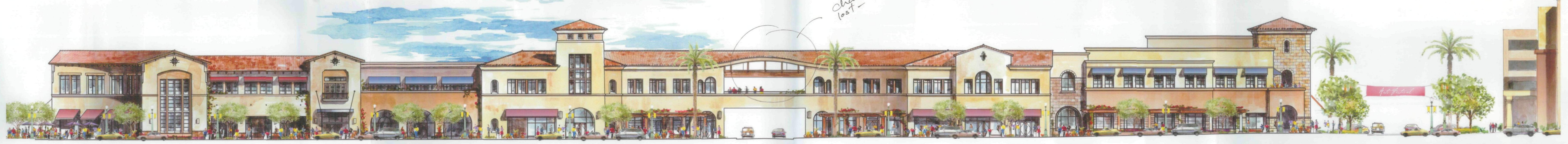
CAMELBACK ROAD ELEVATION

ENTITLED ELEVATIONS MUDSET TILE ROOFING WOOD BEAM TAILS TAG WOOD SOFFIT ROYAL PALMS STUCCO FINISH ANODIZED ALUMINUM WINDOWS FABRIC AWNINGS PRECAST COPING AT TOP OF 3 FT HIGH STONE TILE WAJNSCOT PRECAST PARAPET COPING FABRIC AWNINGS ANODIZED ALUMINUM WINDOWS ROYAL PALMS LIKE STUCCO FINISH PRECAST BULLNOSE AT TOP OF 3 FT HIGH STONE TILE WAJNSCOT MUDSET TILE ROOFING PRECAST COPING ANODIZED ALUM WINDOWS ROYAL PALMS STUCCO FINISH ROUND BRICK COLUMNS AT 2ND FLR WINDOWS AND AT TRELLIS STAINED ROUGH SAWN WOOD TRELLIS ANODIZED ALUMINUM WINDOWS SCORED STONE FINISH STUCCO PRECAST WINDOW SCREENS AND SILLS PRECAST COPINGS FABRIC AWNINGS ANODIZED ALUMINUM WINDOWS ROYAL PALMS LIKE STUCCO FINISH STONE TILE ON TOWER PRECAST BULLNOSE ABOVE 6 FT HIGH STONE TILE WAJNSCOT AT TOWER PRECAST COLUMNS STAINED ROUGH SAWN WOOD TRELLIS