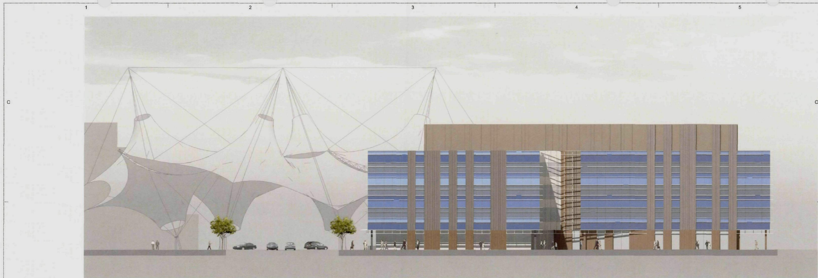
1 West Elevation Scale: 1/16"=1'-0"