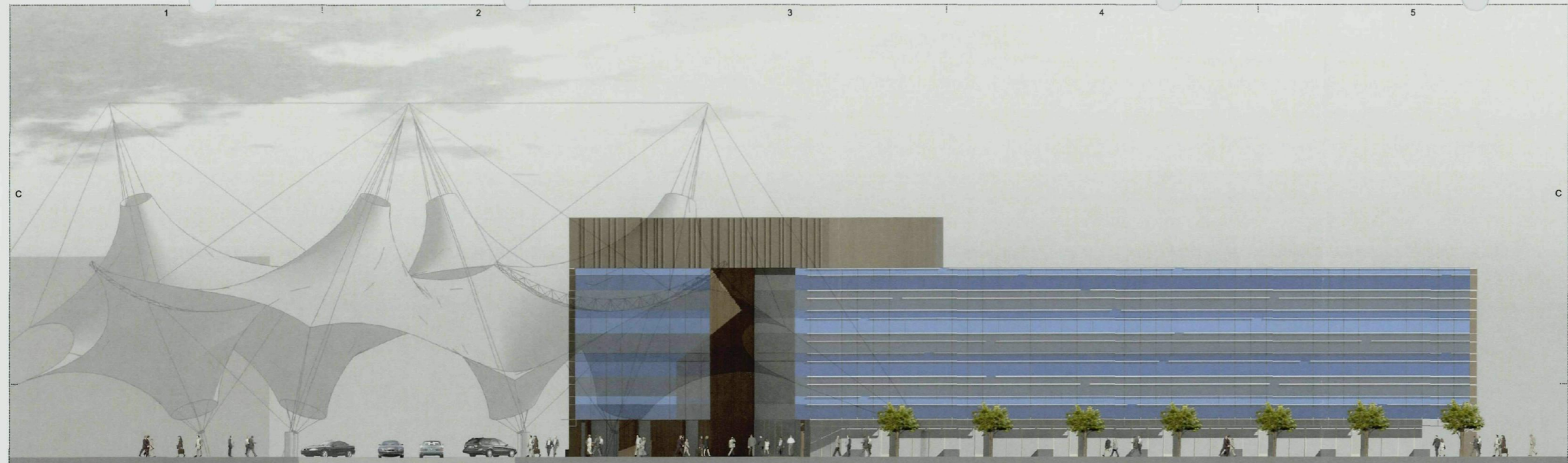
1 North Elevation Scale: 1/16"=1'-0"