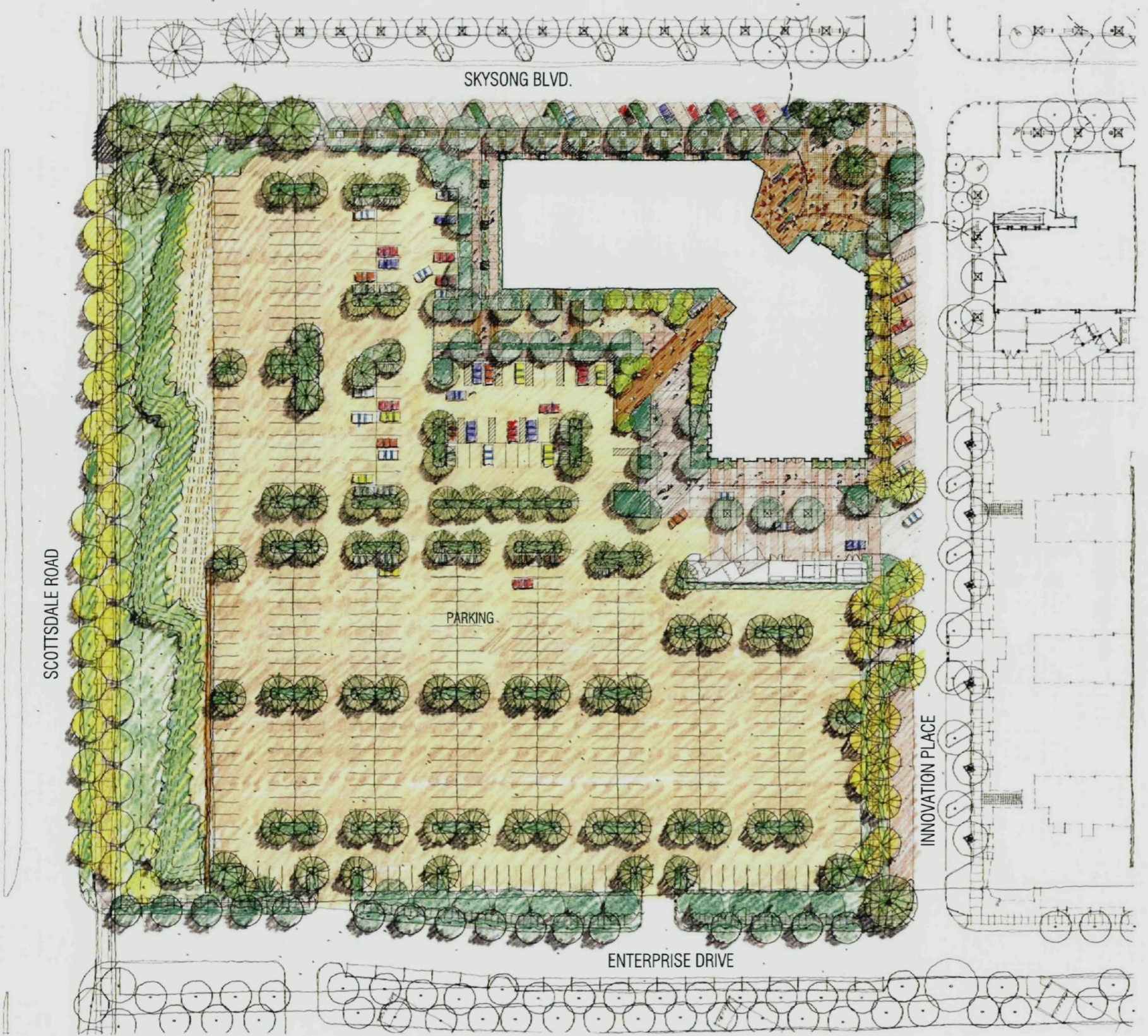
1 ILLUSTRATIVE PLAN SCALE: 1" = 40'-0"