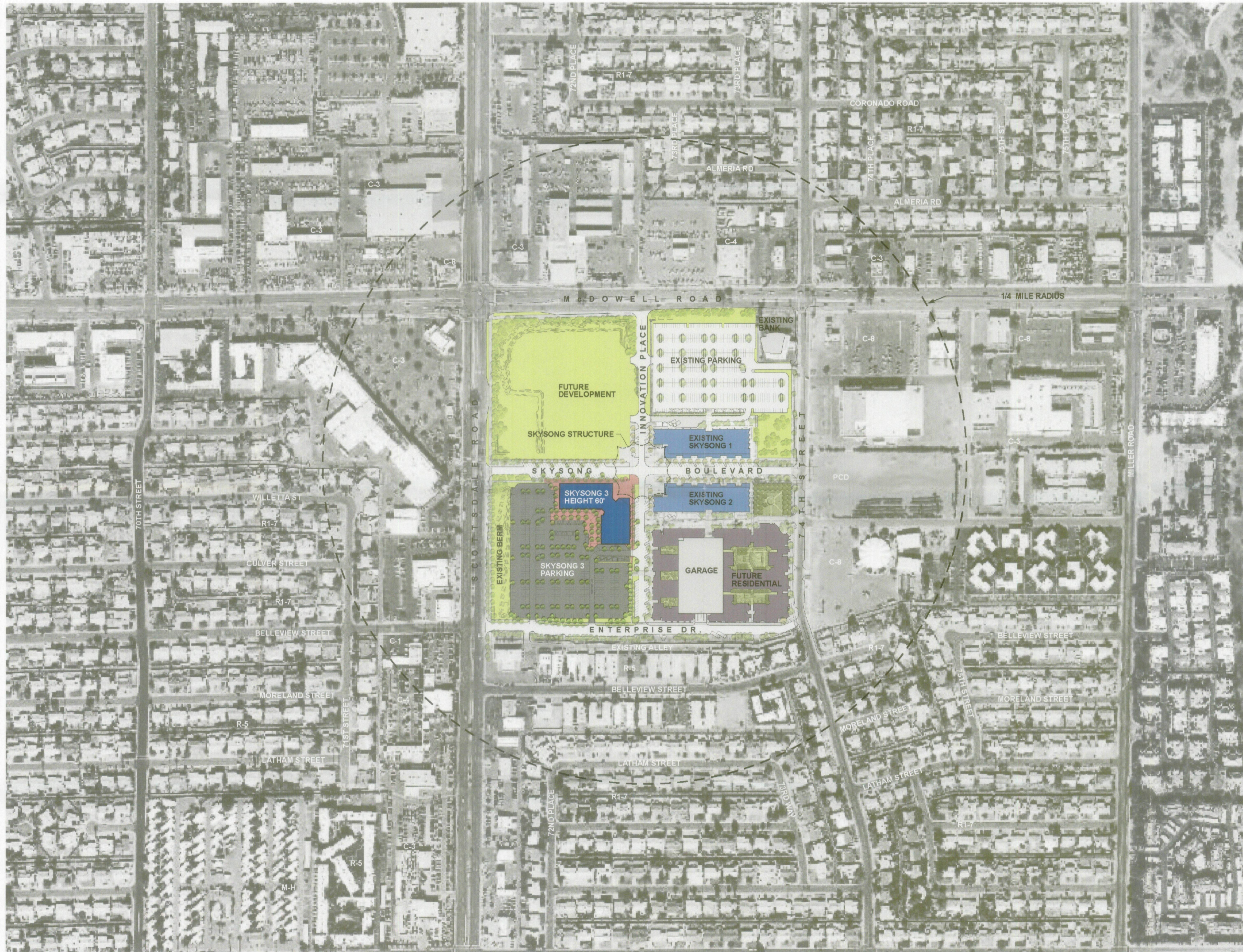
Context Aerial and Site Plan Scale: 1" = 200'-0"