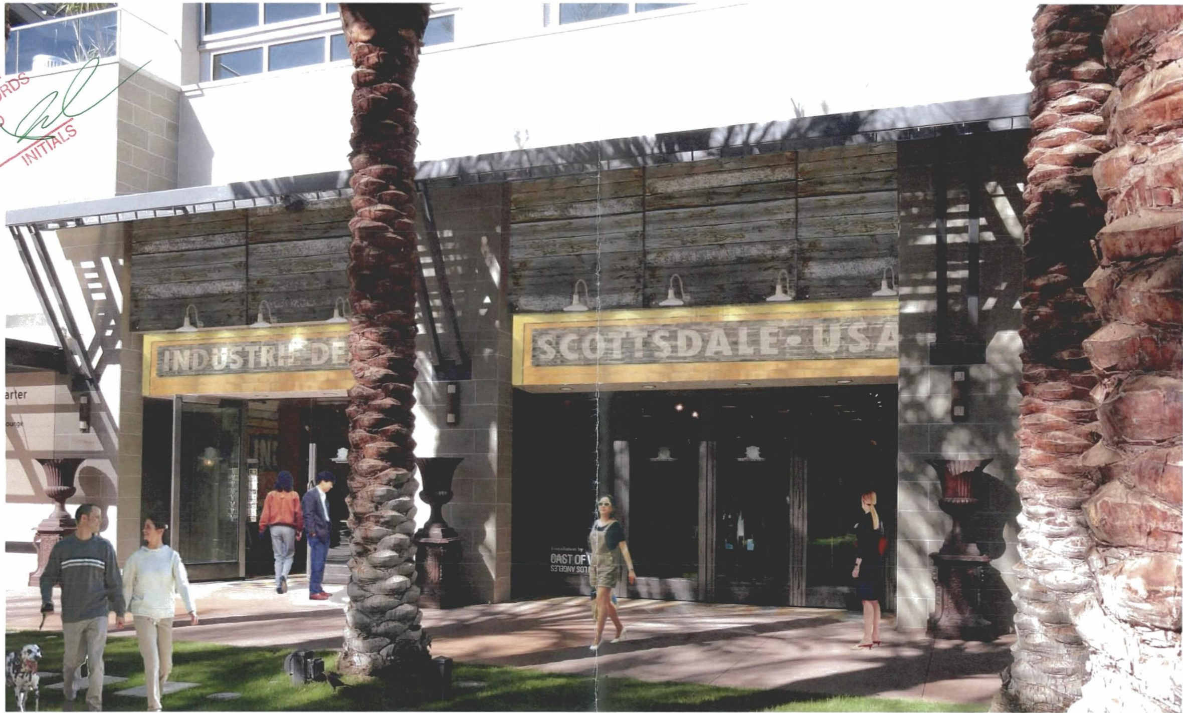
2.6.12 Proposed Storefront Modifications

94-9A-2012 STIPULATION SET RETAIN FOR RECORDS 3/15/12 APPROVED DATE INITIALS