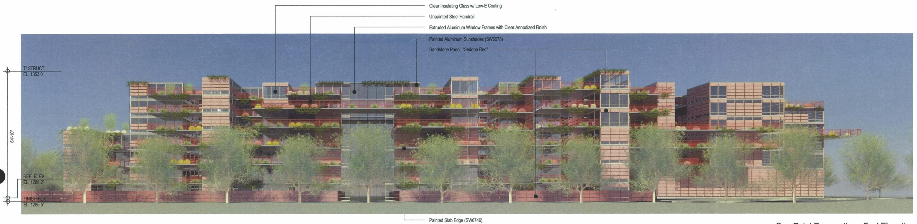
One Point Perspective - East Elevation