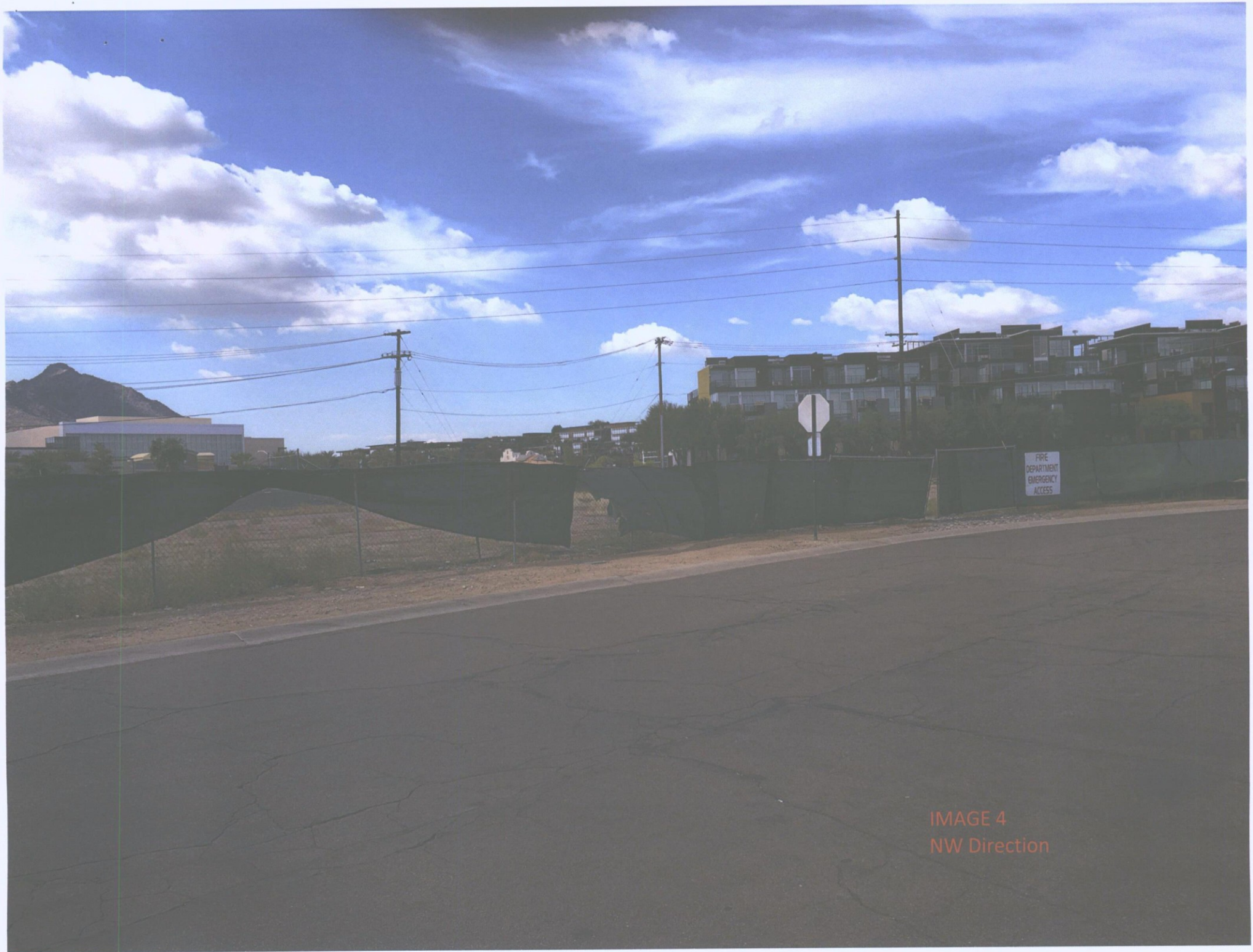
IMAGE 4 NW Direction