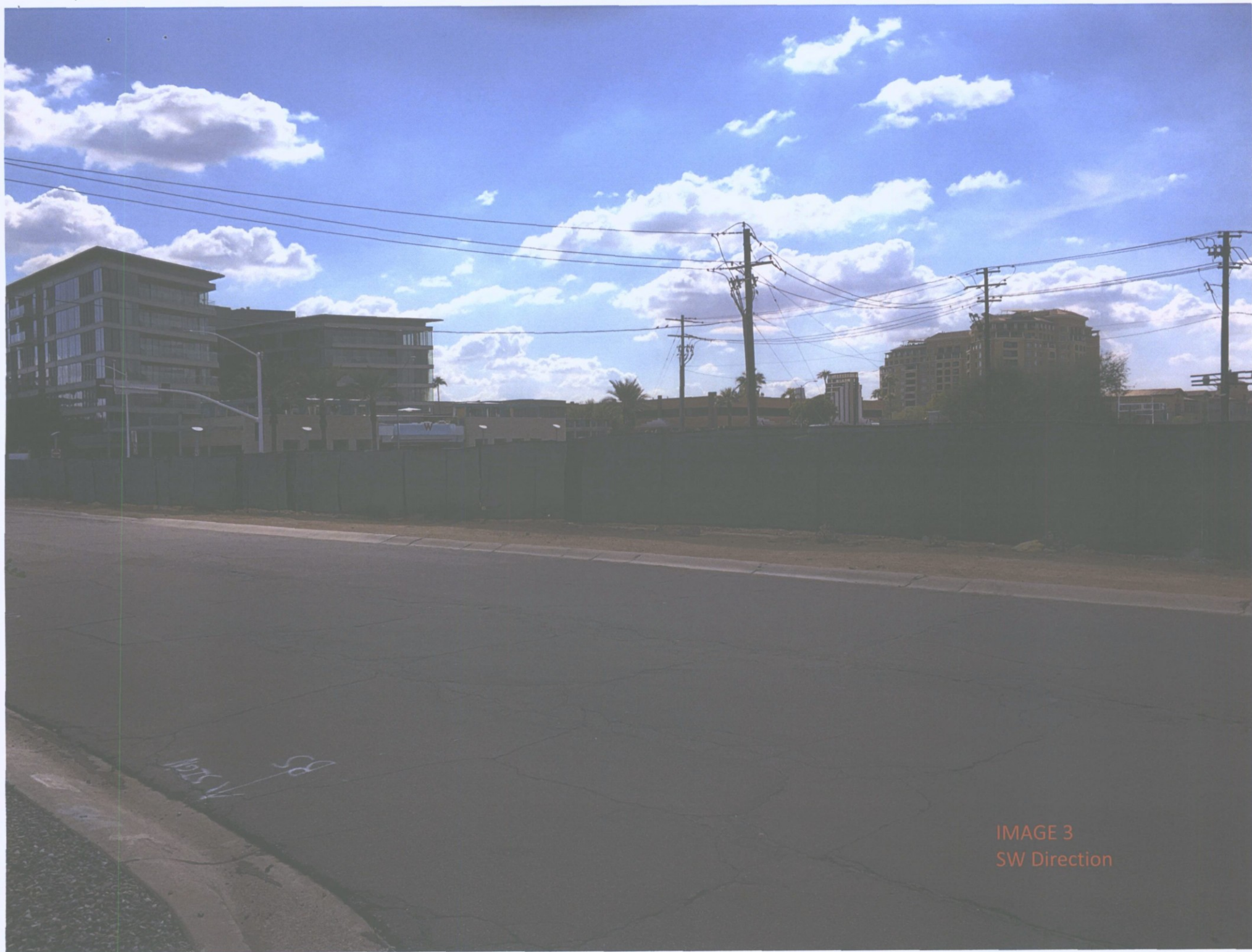
IMAGE 3 SW Direction