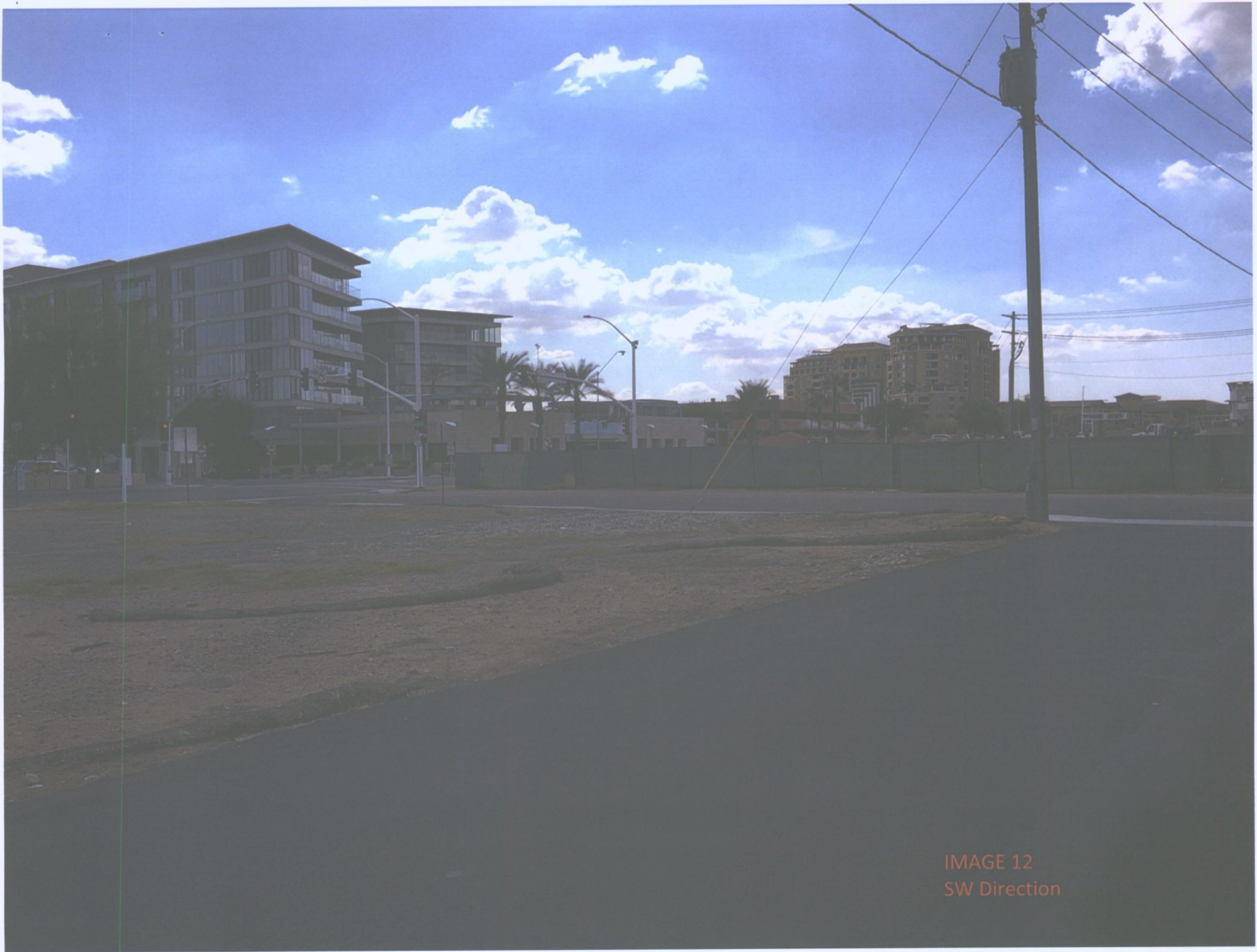
IMAGE 12 SW Direction