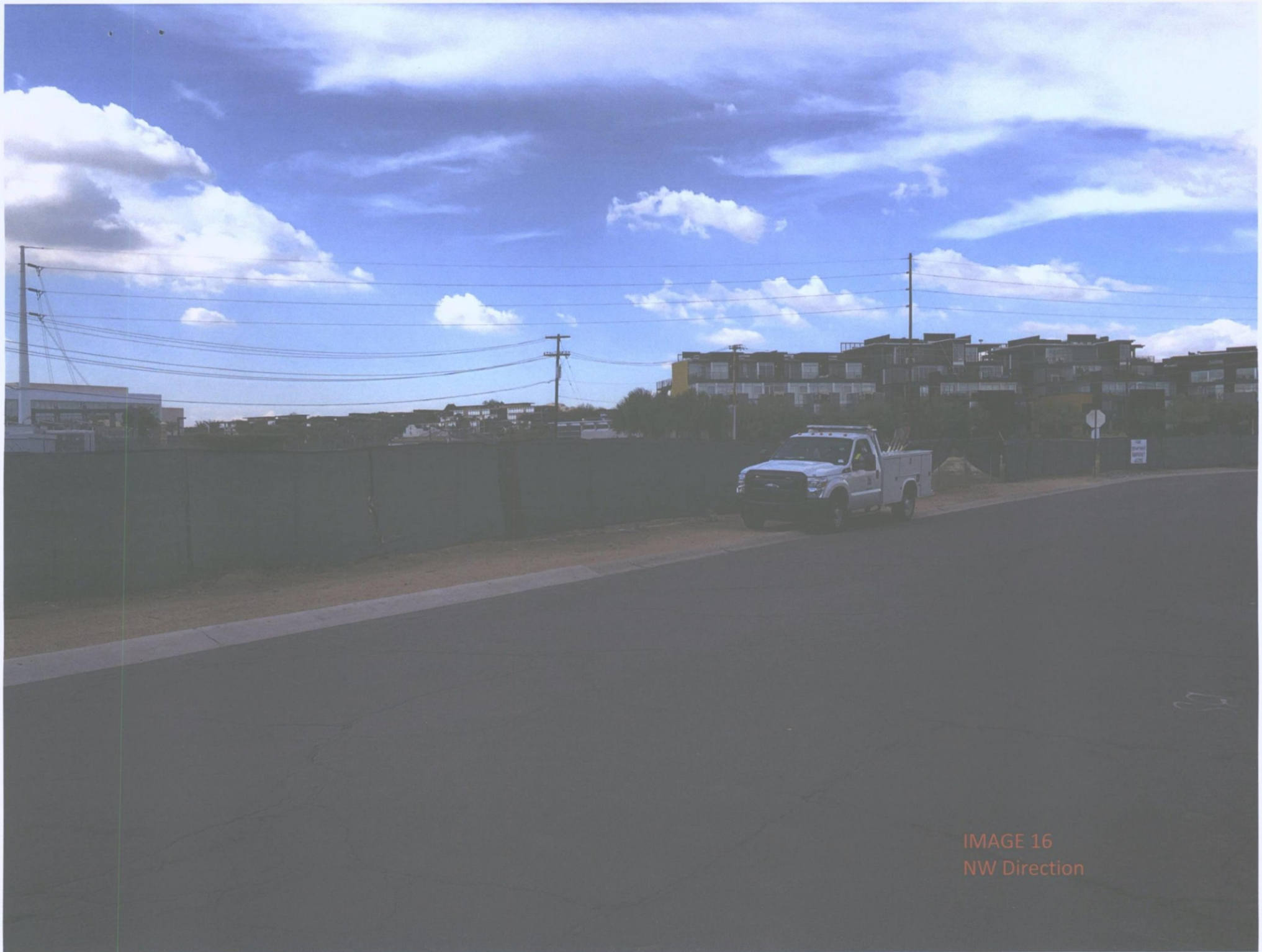
IMAGE 16 NW Direction