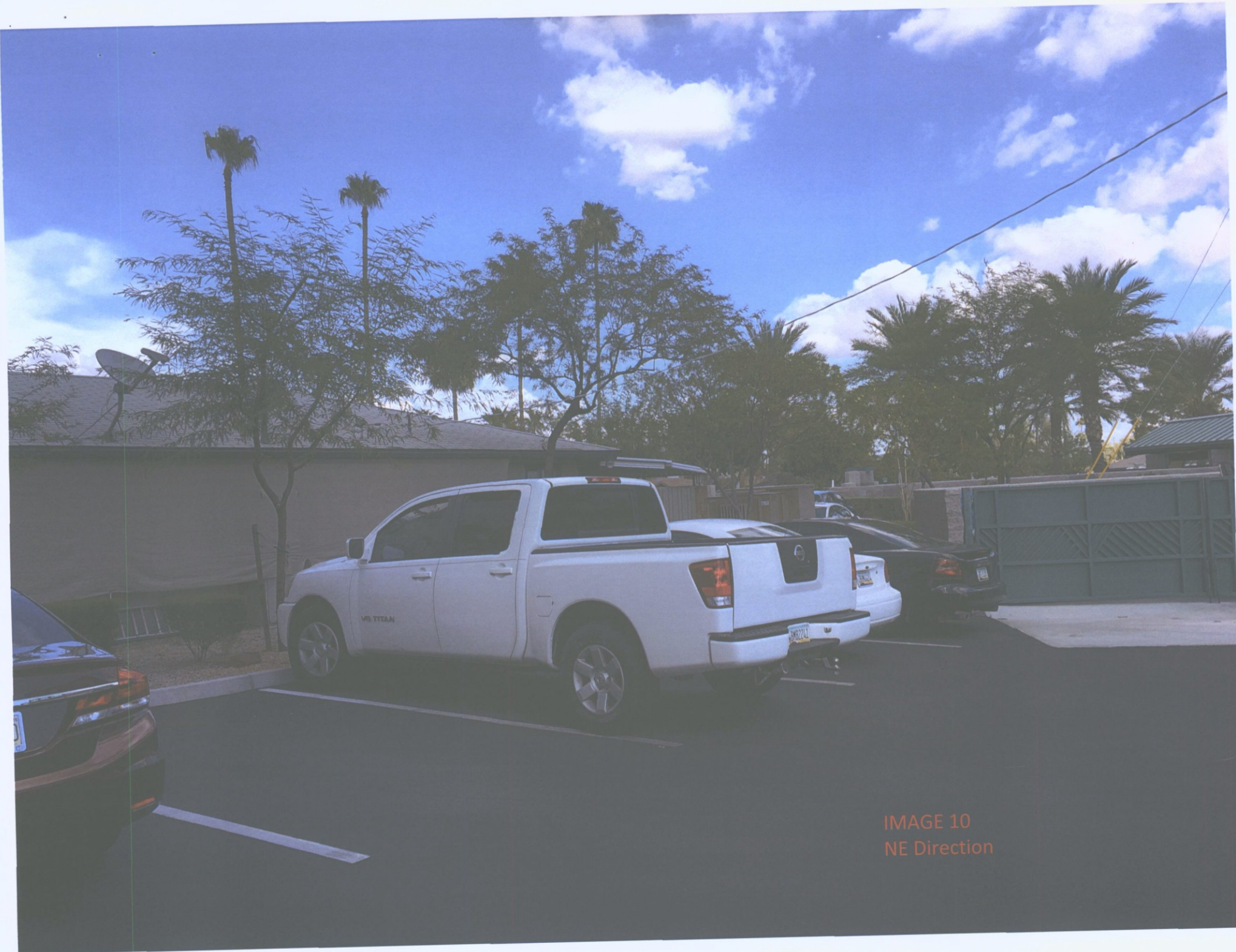
IMAGE 10 NE Direction