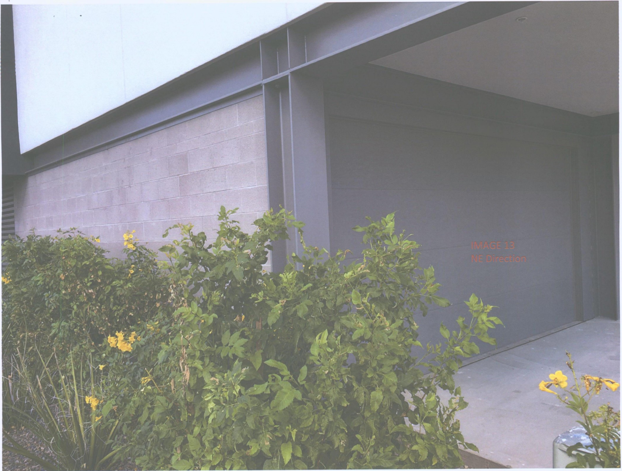
IMAGE 13 NE Direction