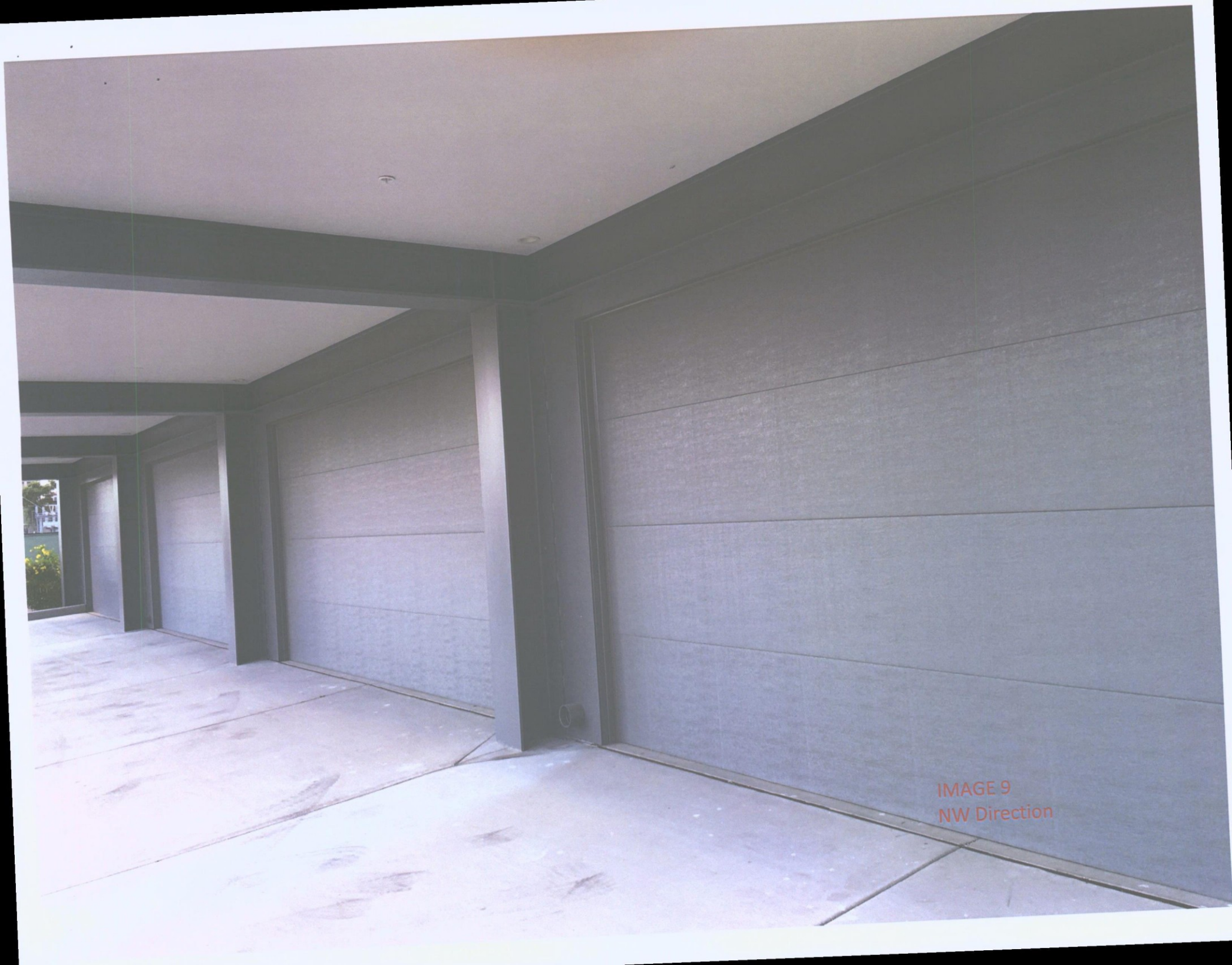
IMAGE 9 NW Direction