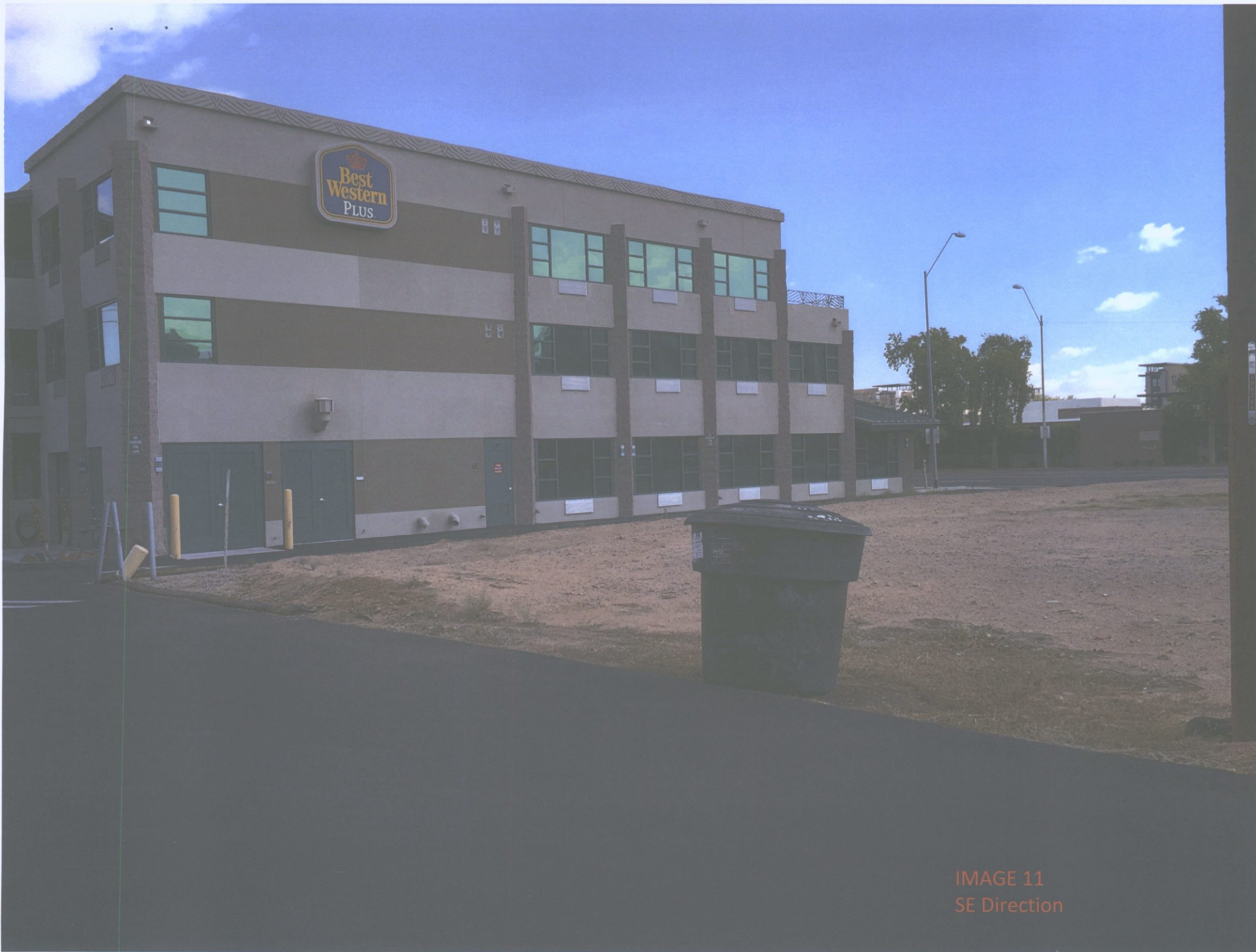
IMAGE 11 SE Direction