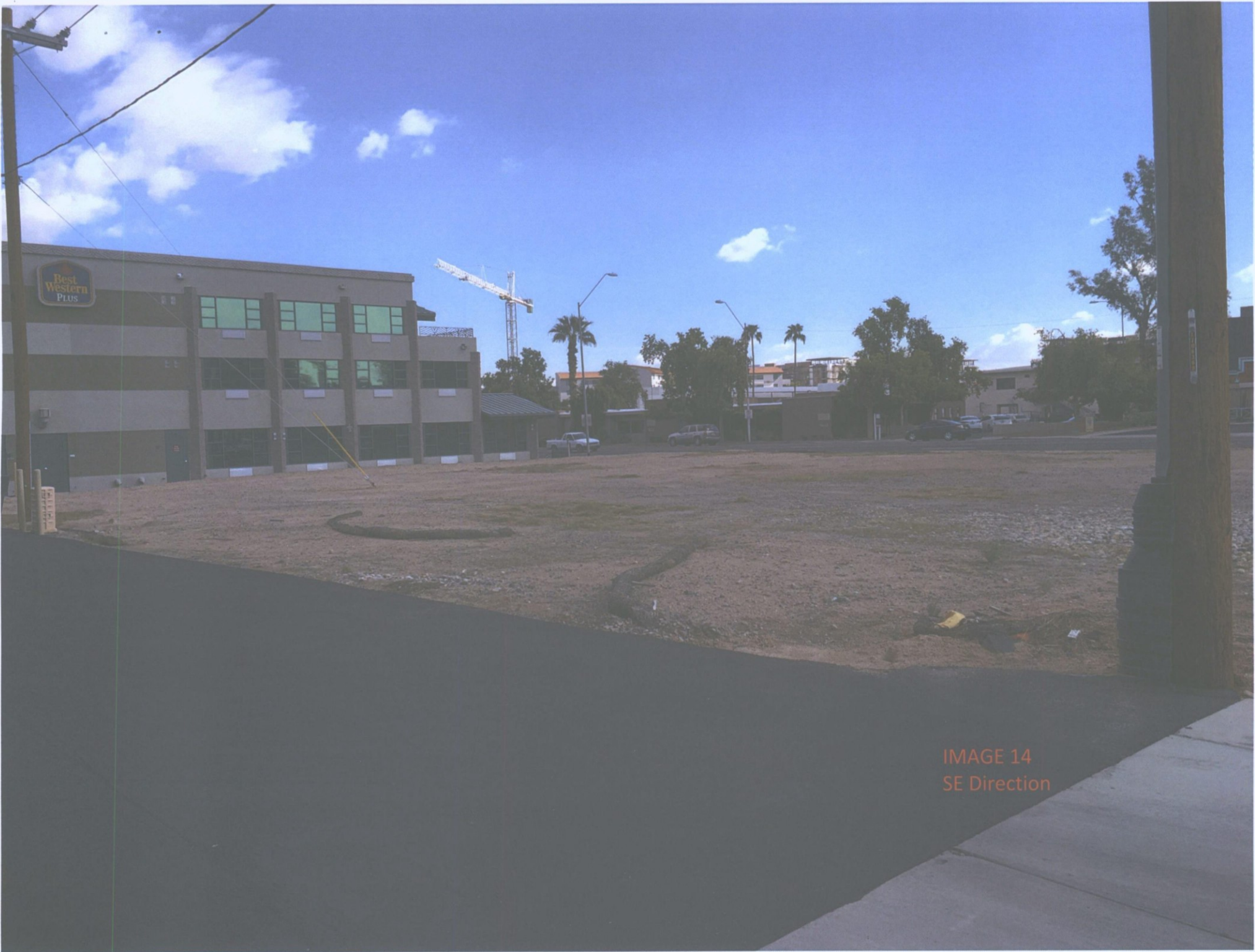
IMAGE 14 SE Direction