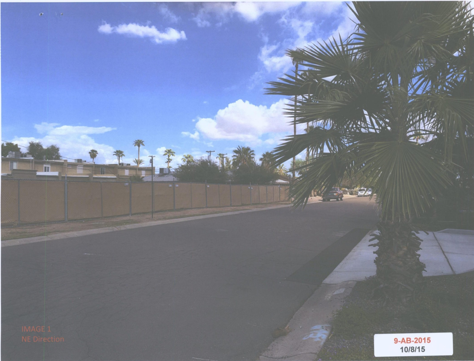
IMAGE 1 NE Direction