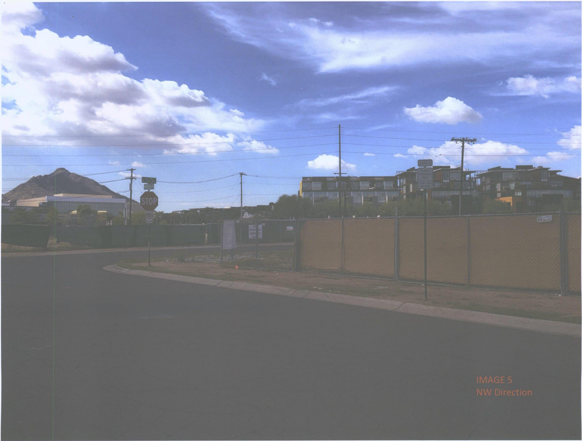
IMAGE 5 NW Direction