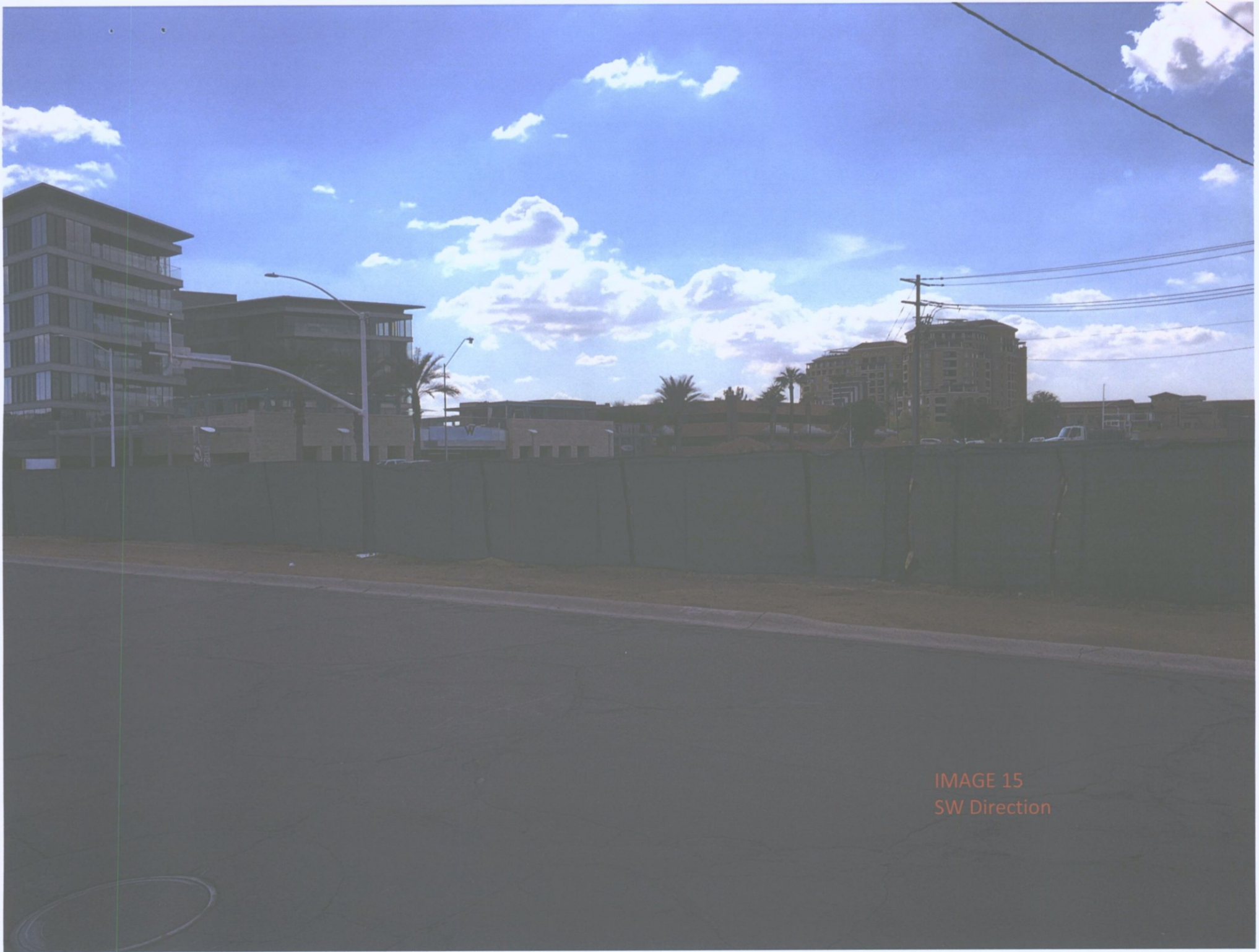
IMAGE 15 SW Direction