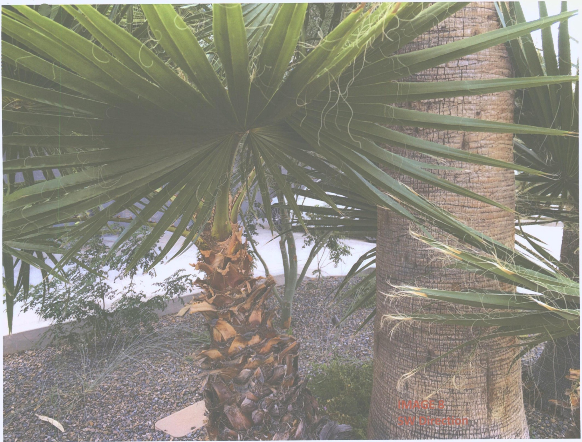
IMAGE 8 SW Direction