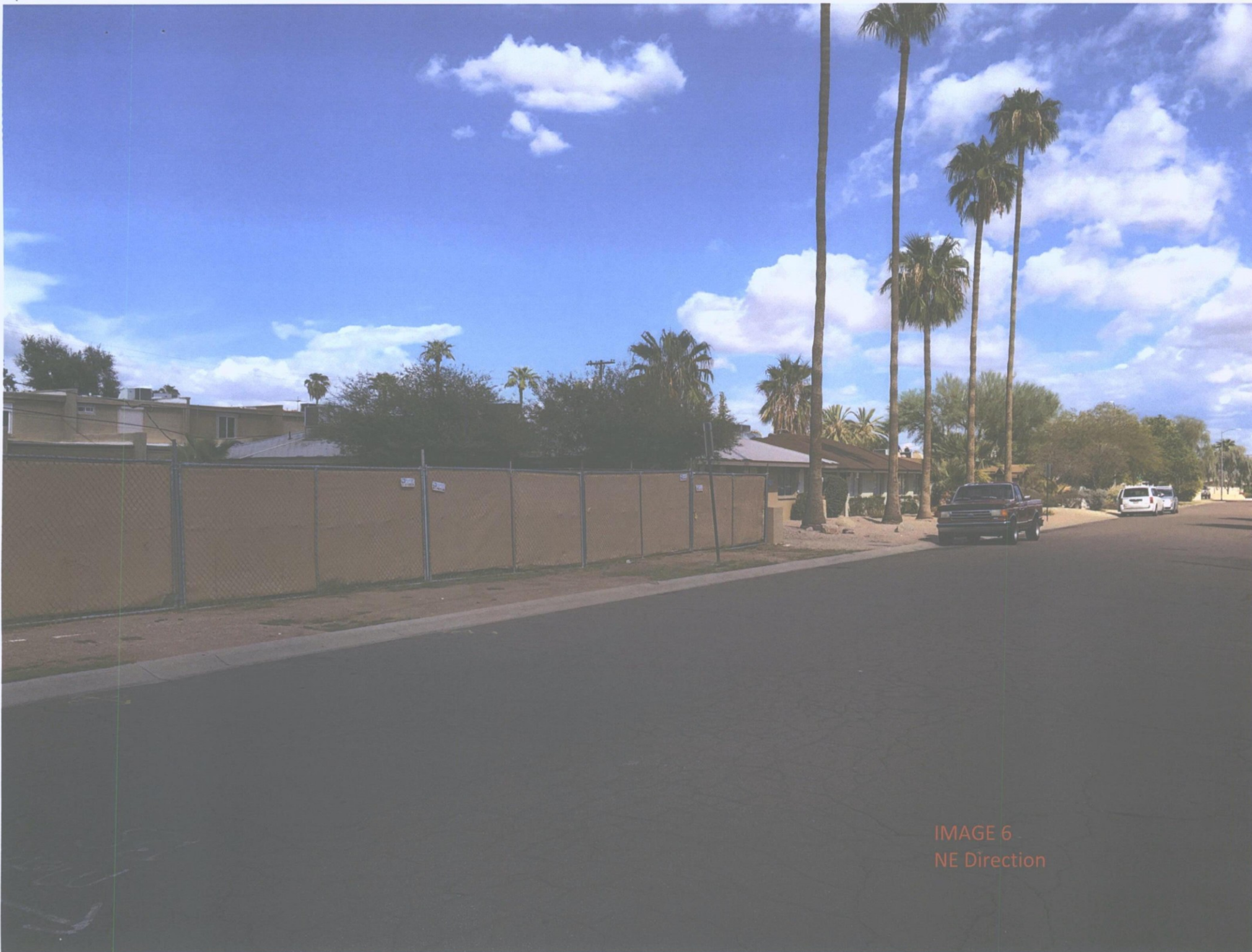
IMAGE 6 NE Direction