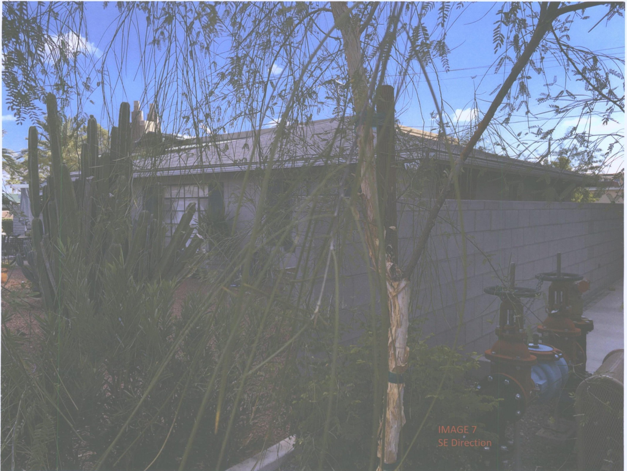
IMAGE 7 SE Direction