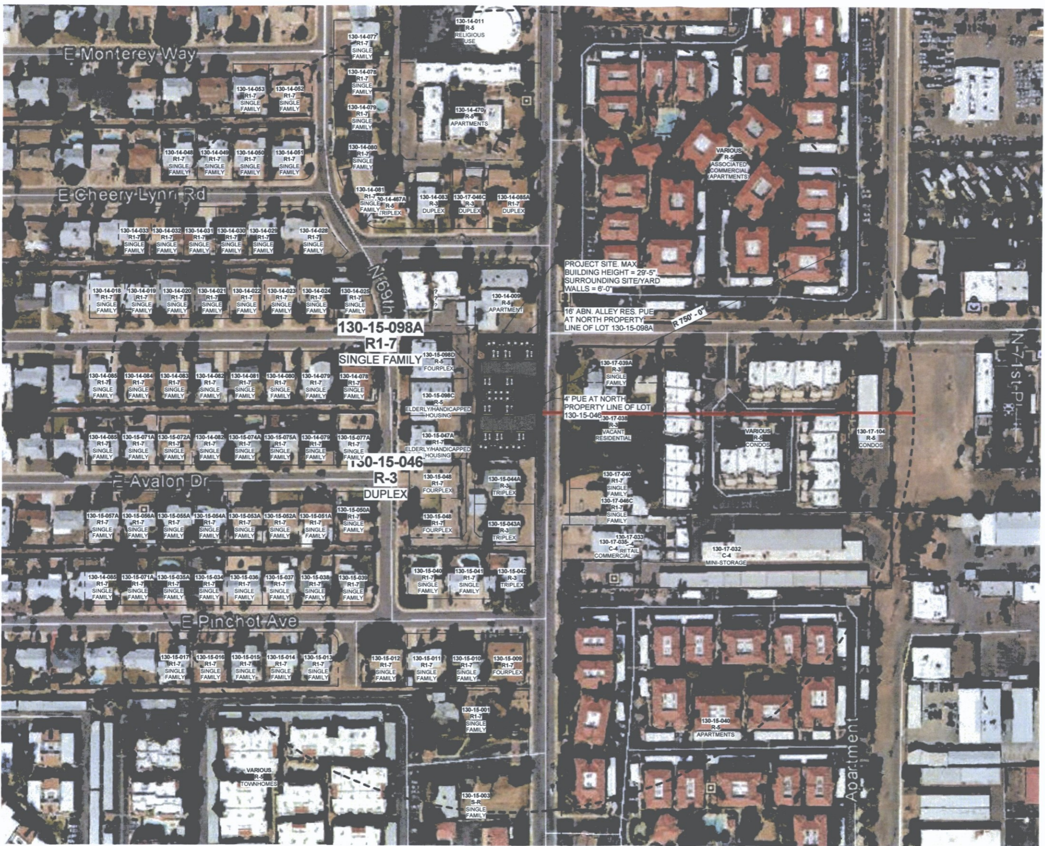
00 SITE PLAN CONTEXT AERIAL 1" = 80'-0"