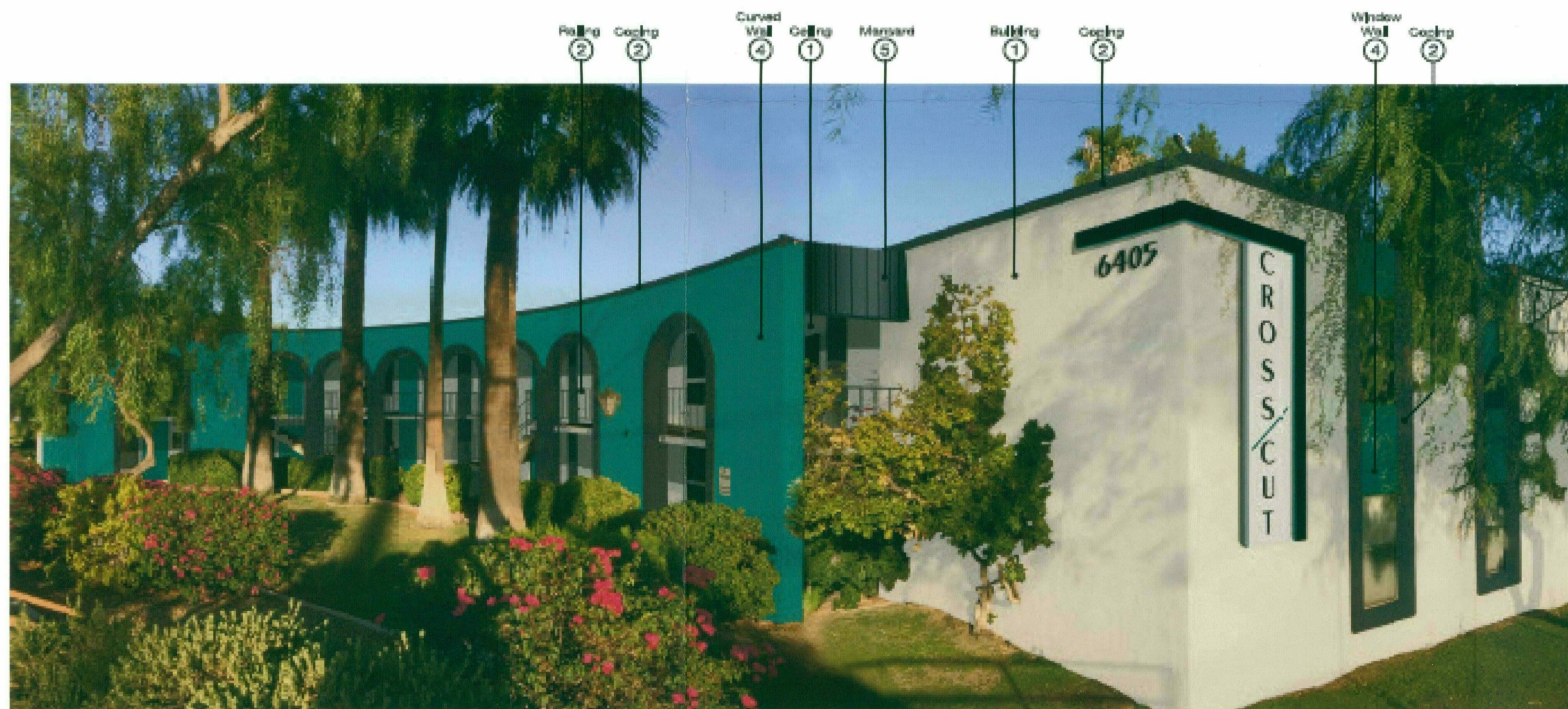
2 Proposed North West Elevation