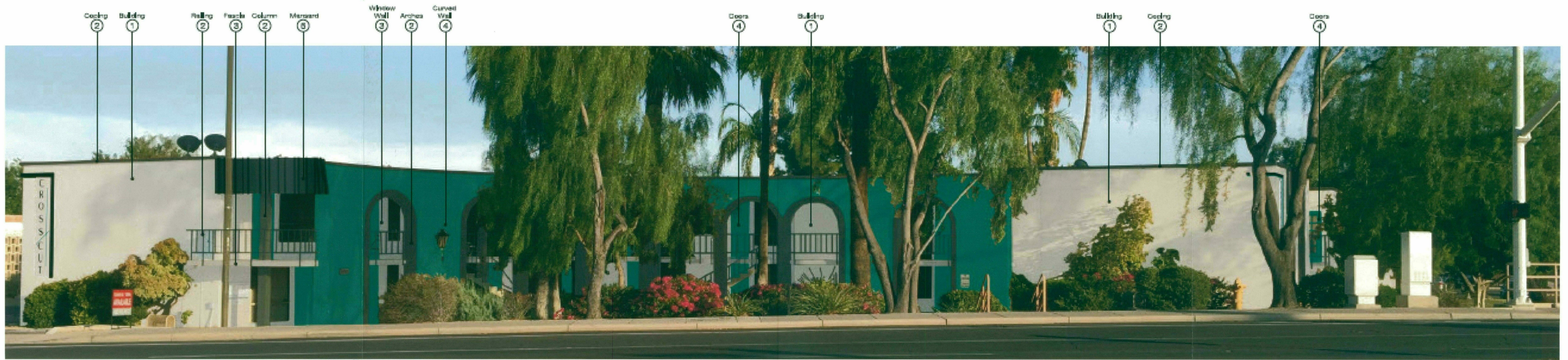
1 Proposed North Elevation