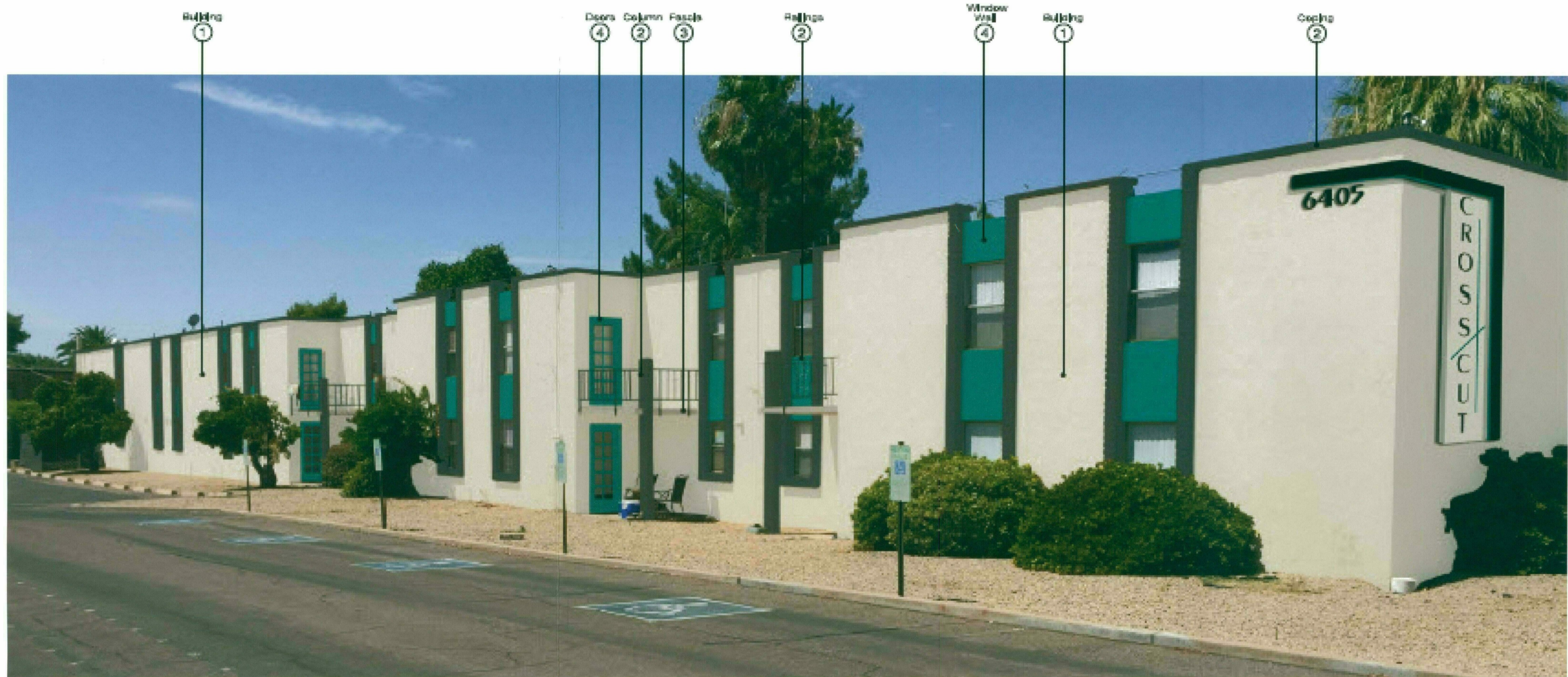
1 Proposed East Elevation