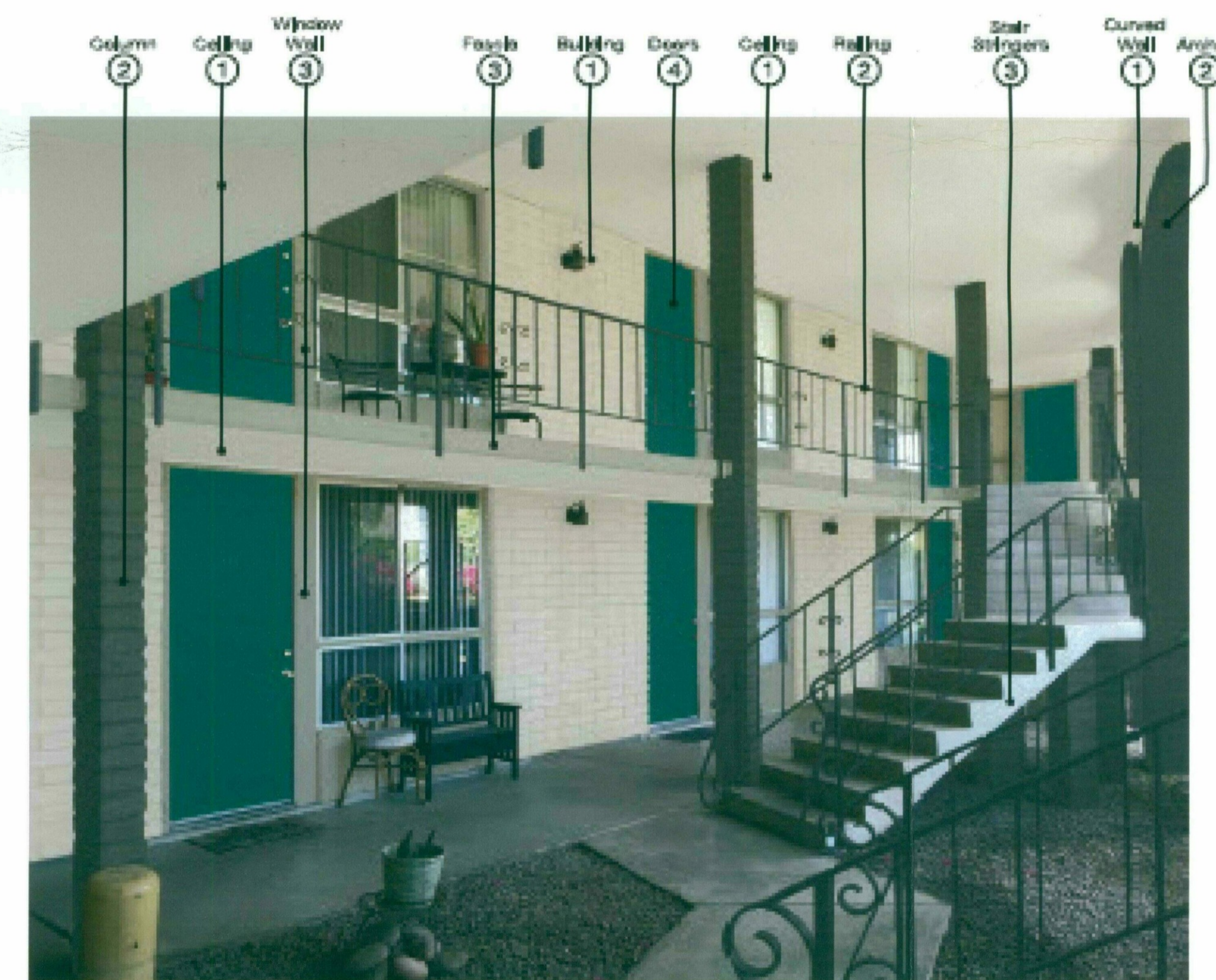
3 Proposed North Elevation Interior