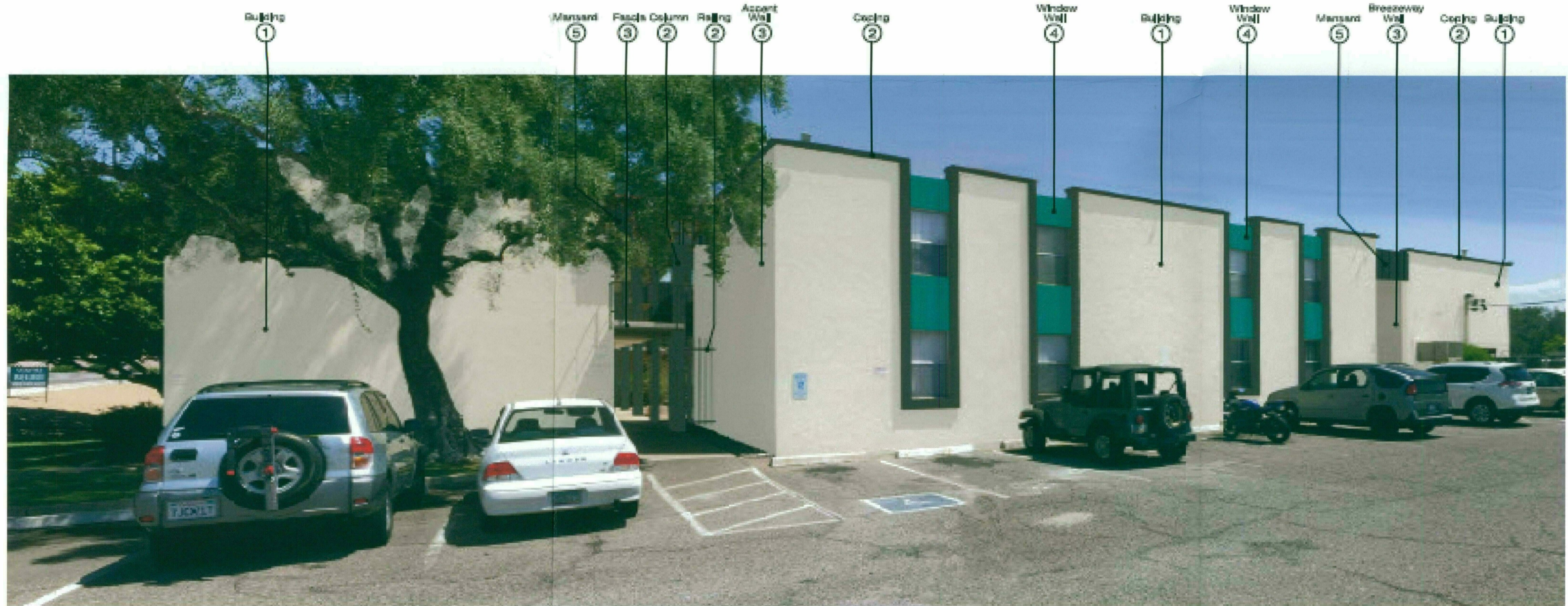
3 Proposed South Elevation