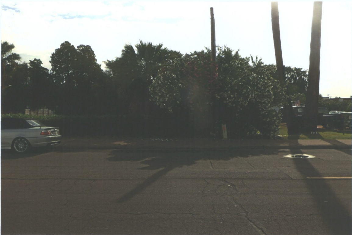
Southeast corner looking north