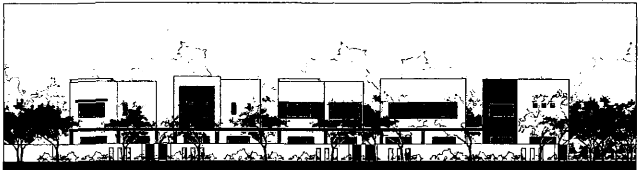
REAR ELEVATION 3011 B 3012 B 3011 A 3013 A 3014 B