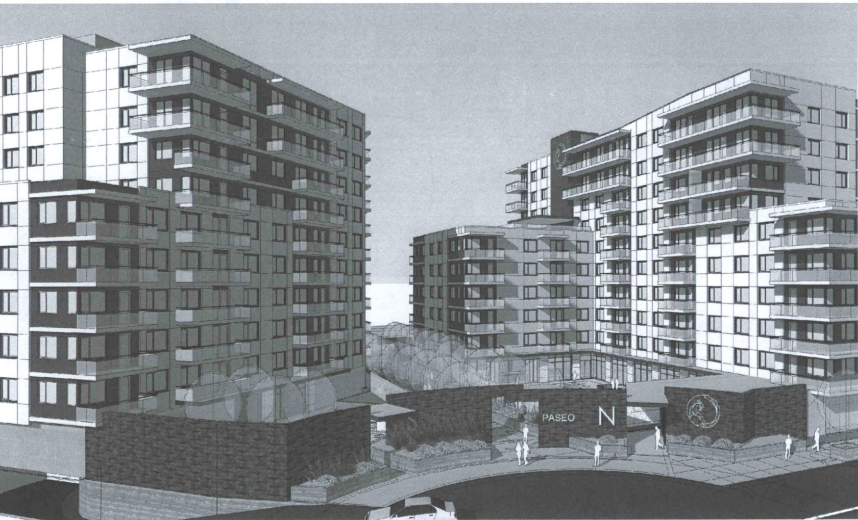
VIEW WEST TOWARDS COURTYARD AND PRIMARY ENTRANCE