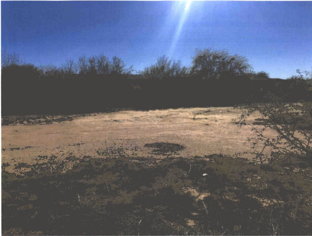
Figure 2. Overview of the project area showing residential development, view south.