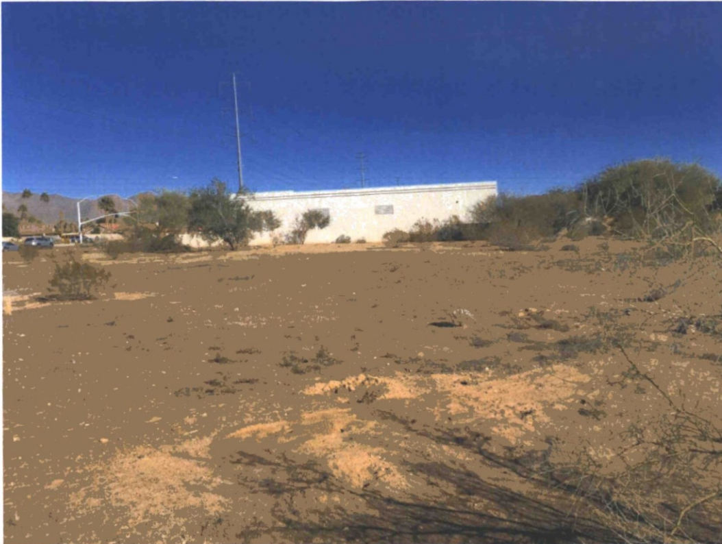
Figure 4 Overview of Project Area showing commercial development at the intersection of Shea Blvd and 110 th Street, view east.