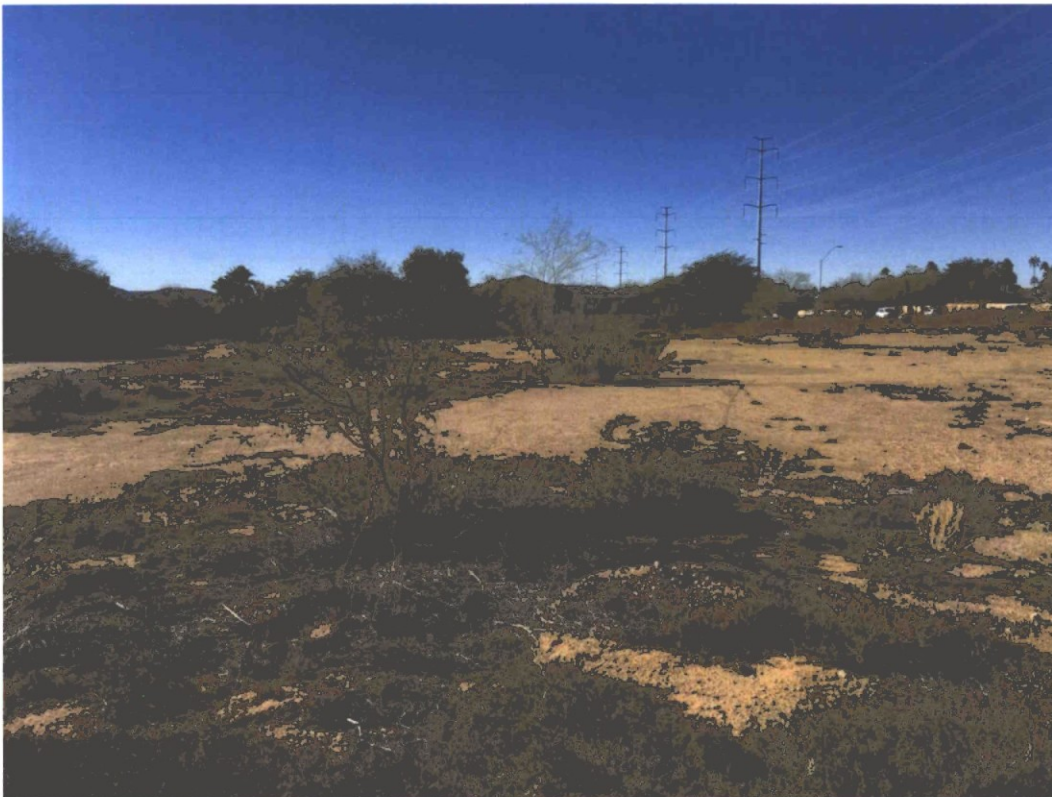
Figure 2. Overview of project area, view west.