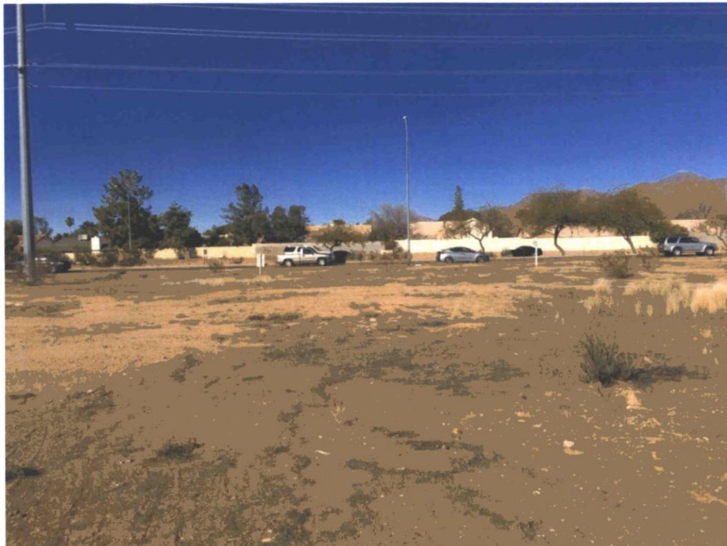
Figure 5. Overview of project area showing Shea Boulevard