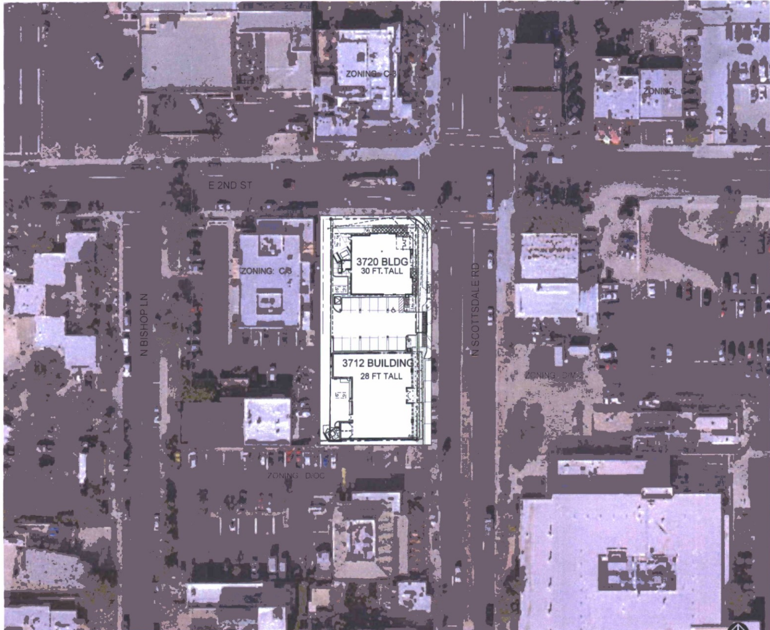
① CONTEXT AERIAL