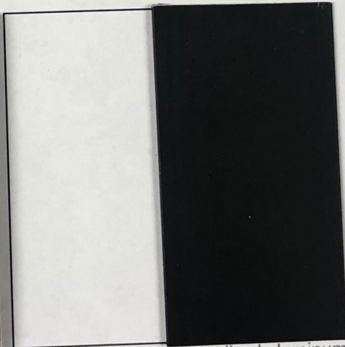
alum-1: black anodized aluminum window frames