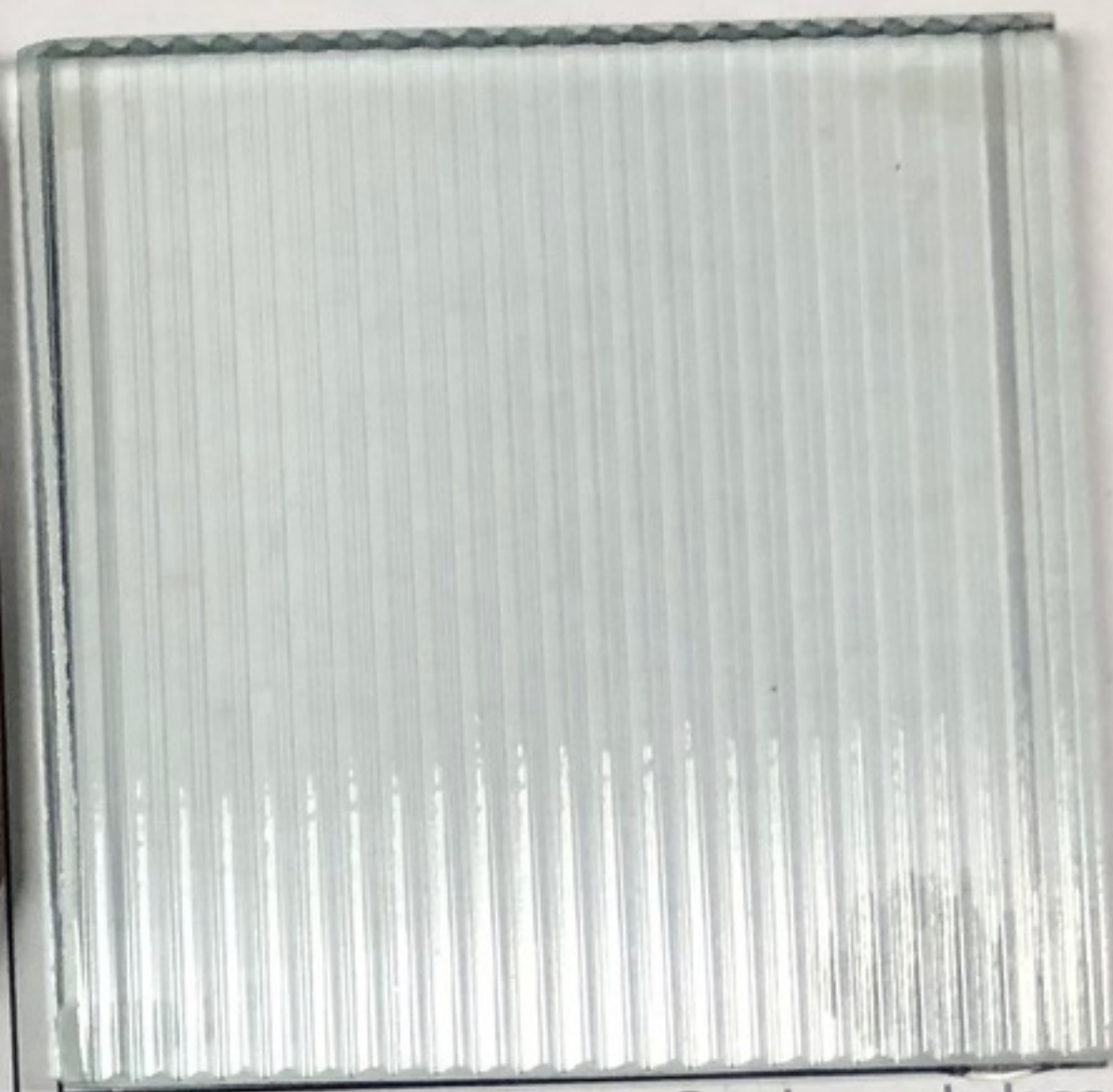
glz-2: channel glass lamberts - linit u-glass 'houdini'