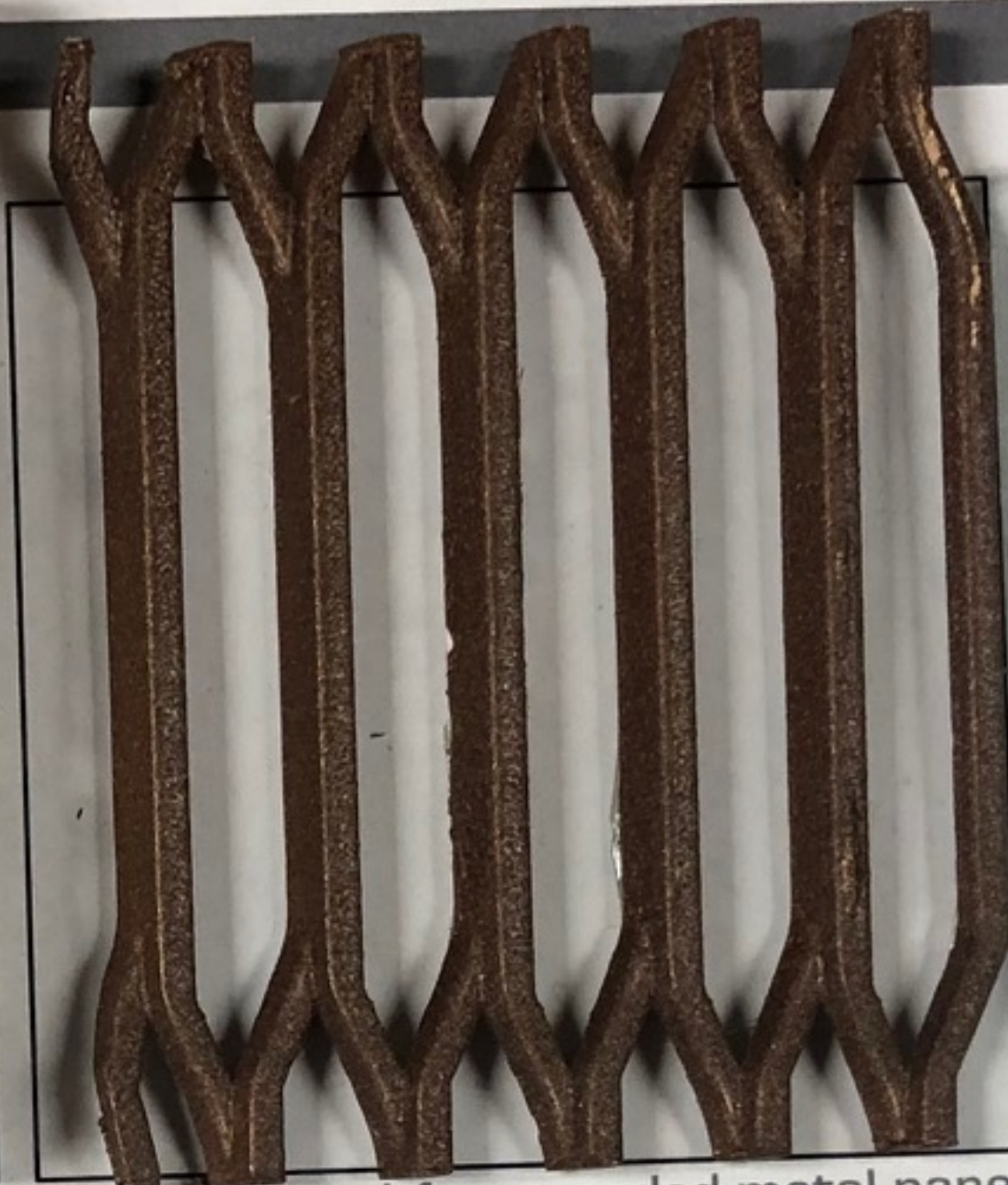
mtl-1: expanded metal panel amico - apex 'venetian' with aged copper finish