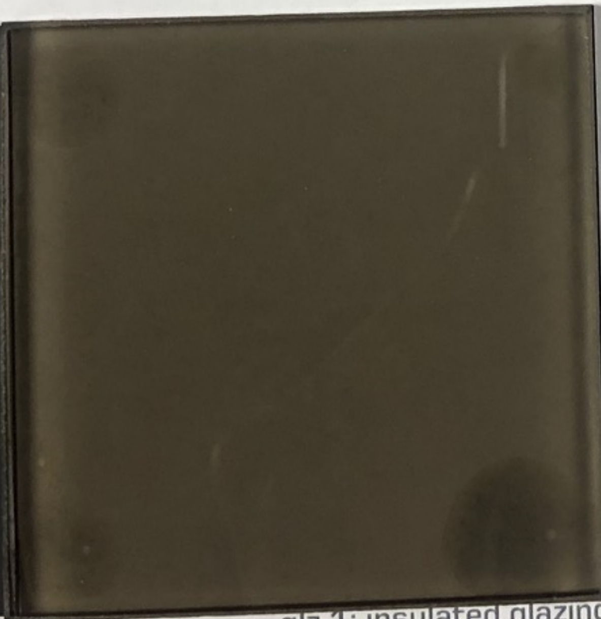
glz-1: insulated glazing solar gray