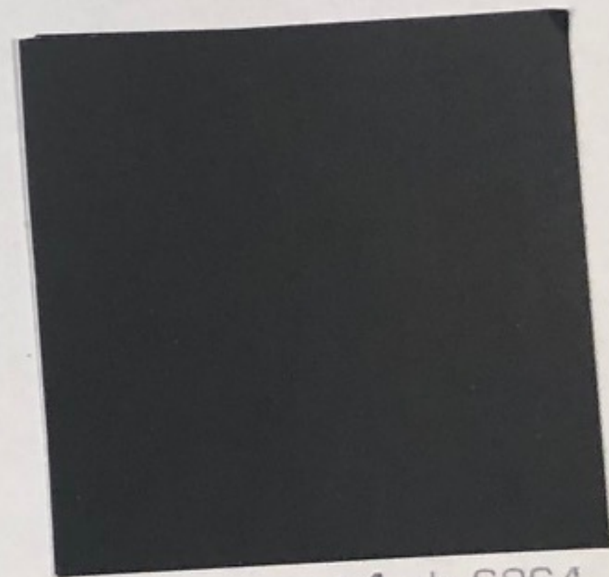
pt-1 de 6364 cavernous

china mist mixed use 7363 e. scottsdale mall scottsdale, az 85251 date: july 22, 2016