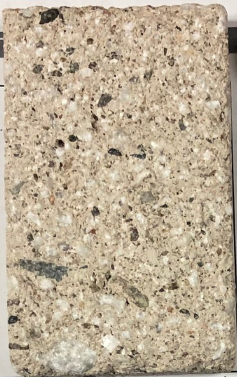
cmu-1: concrete masonry unit mesastone - 8"x4"x16" textured masonry units 'mission white'