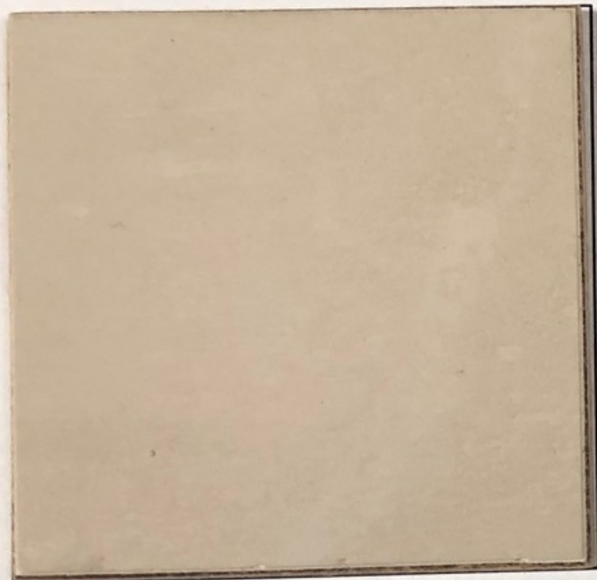
stc-1: smooth integral color stucco la habra - '820 silverado'