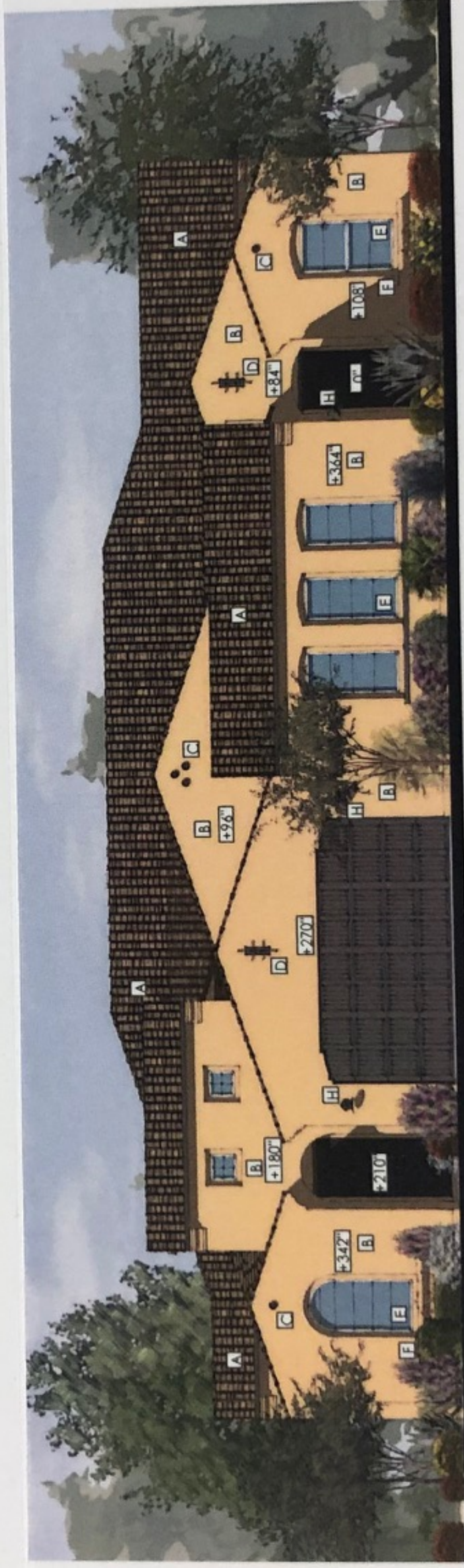
UNIT 1: SPANISH COLONIAL

WINDOWS: WHITE VINYL FRAME PPG SOLARBAN 70XL