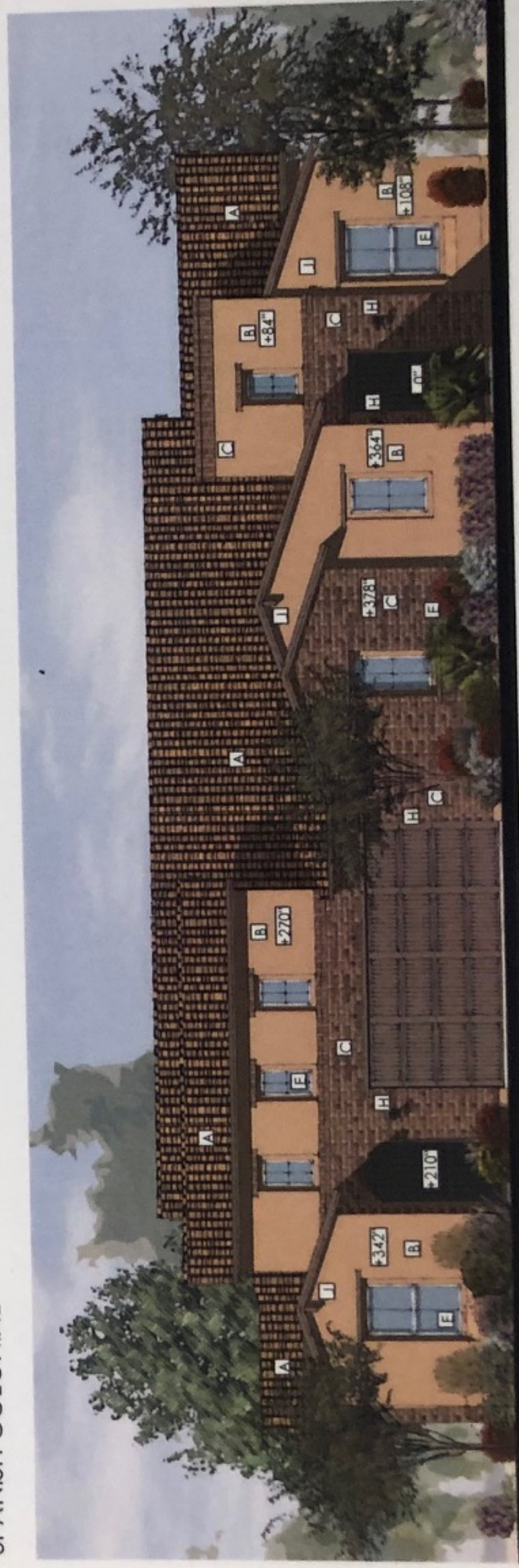
UNIT 1: SPANISH HACIENDA