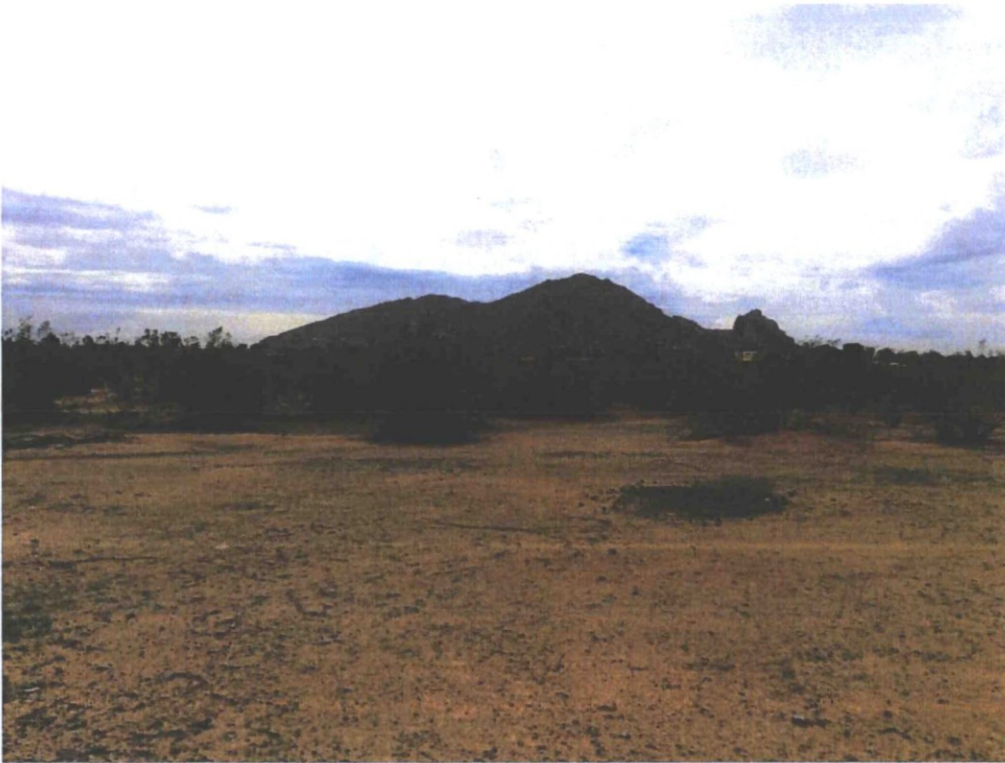
Figure 1. Overview of project area with Camelback Mountain in background, facing southwest.