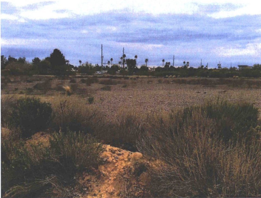
Figure 2. Overview of project area with deteriorated gravel-paved parking area, facing northwest.