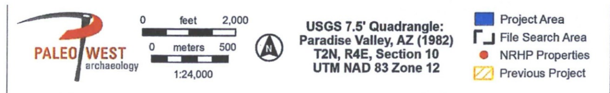
Figure 5. Project location map showing previous projects and NRHP-listed properties.