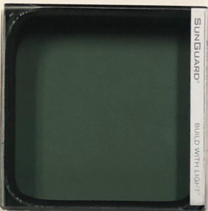
SKIN SYSTEM #3A GLAZING

Storefront Glazing and Punched Window Glazing