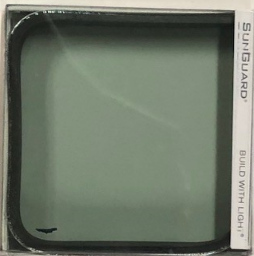
SKIN SYSTEM #3B GLAZING