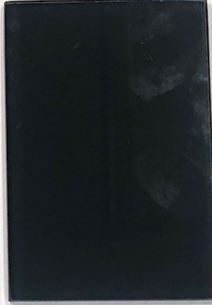
GL02S PRODUCT: SPANDREL GLASS MANUFACTURER: VIRACON FINISH: 1/4" BRONZE MONOLITHIC HS, WITH V903 SUBDUED GREY FRIT ON #2 SURFACE

HONORHEALTH OSBORN 7400 E. OSBORN RD., SCOTTSDALE, AZ 85251 08.19.19