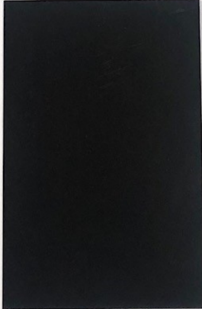
M01 PRODUCT: METAL PANEL MANUFACTURER: PURE + FREEFORM FINISH: #MK-019 COSMOS