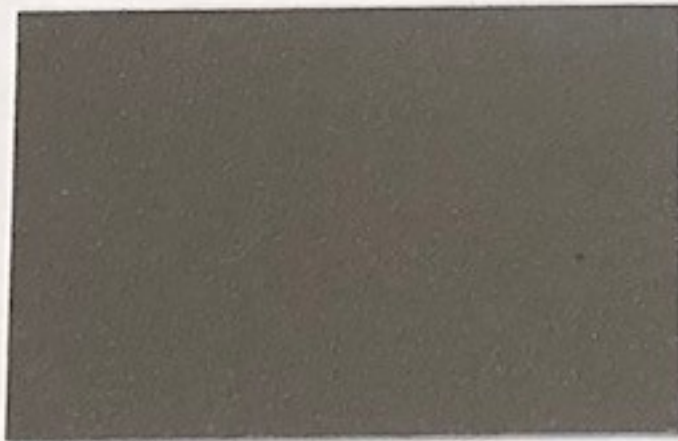
E01 PRODUCT: EIFS MANUFACTURER: DRYVIT FINISH: #616 KINGS GREY

\\P00001\Draw\081919\HonorOsborn\scottsdale\MOB\Working\Rev\in\Design\081919_08EXTERIORMATERIALBOARD\081919_08EXTERIORMATERIALBOARD.rvt