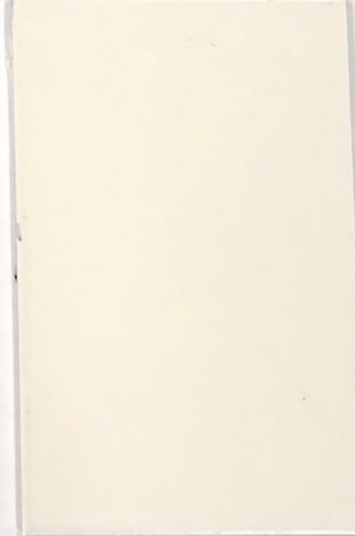
M02 PRODUCT: METAL PANEL MANUFACTURER: REYNOBOND FINISH: FRISCO WHITE

HONORHEALTH OSBORN 7400 E. OSBORN RD., SCOTTSDALE, AZ 85251 08.19.19