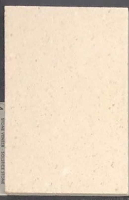
4 STONE VENEER - SOLISTICE STONE GLACIER MOUNT