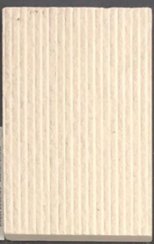
3 STONE VENEER - SOLISTICE STONE BARCELONA BEIGE WIDE COMBED