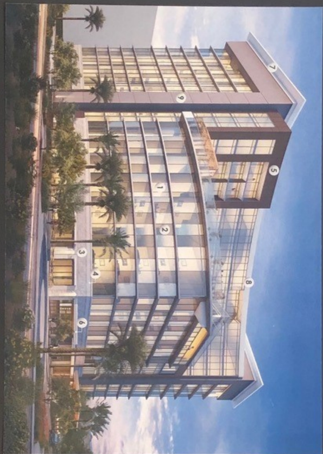
X STONE PANEL @ ENTRY PORTAL WHITE CABARRA MARBLE