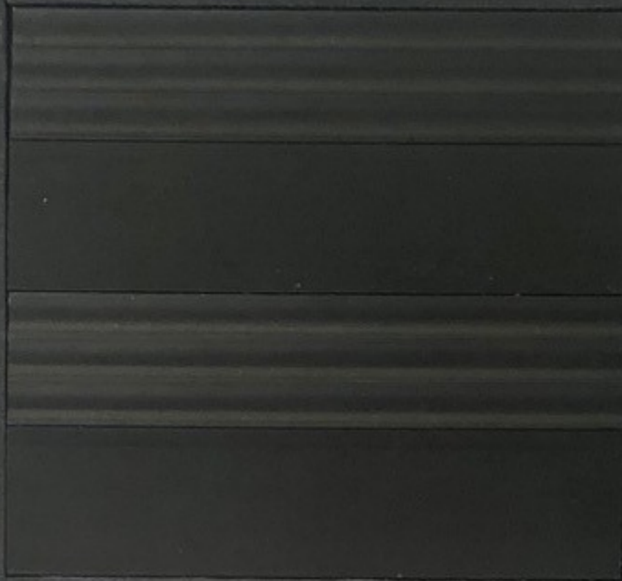
C Arcadia AB-7 standard dark bronze aluminum