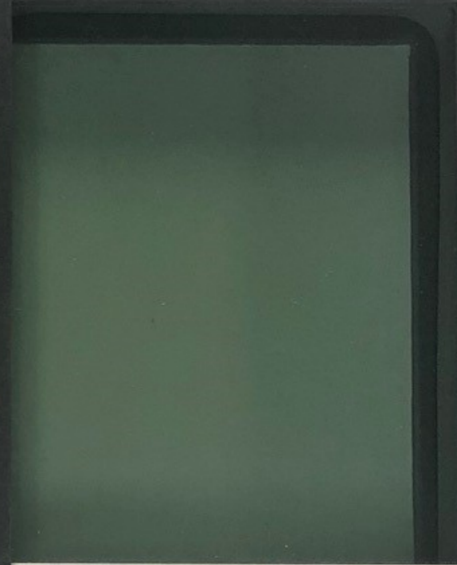
SOLARBAN® 60 (2) SOLEXIA® + Clear Glass Insulating Glass Unit