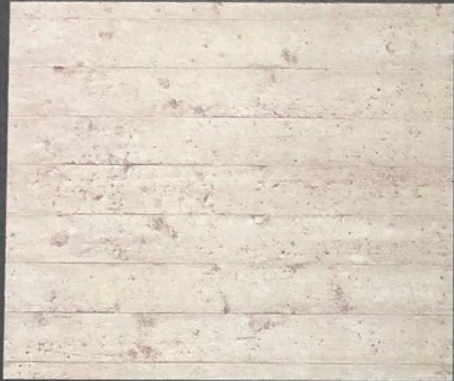
A board-formed concrete