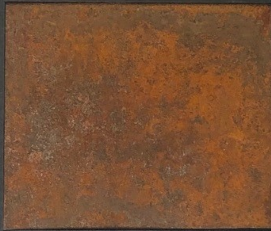
D flush weathered steel