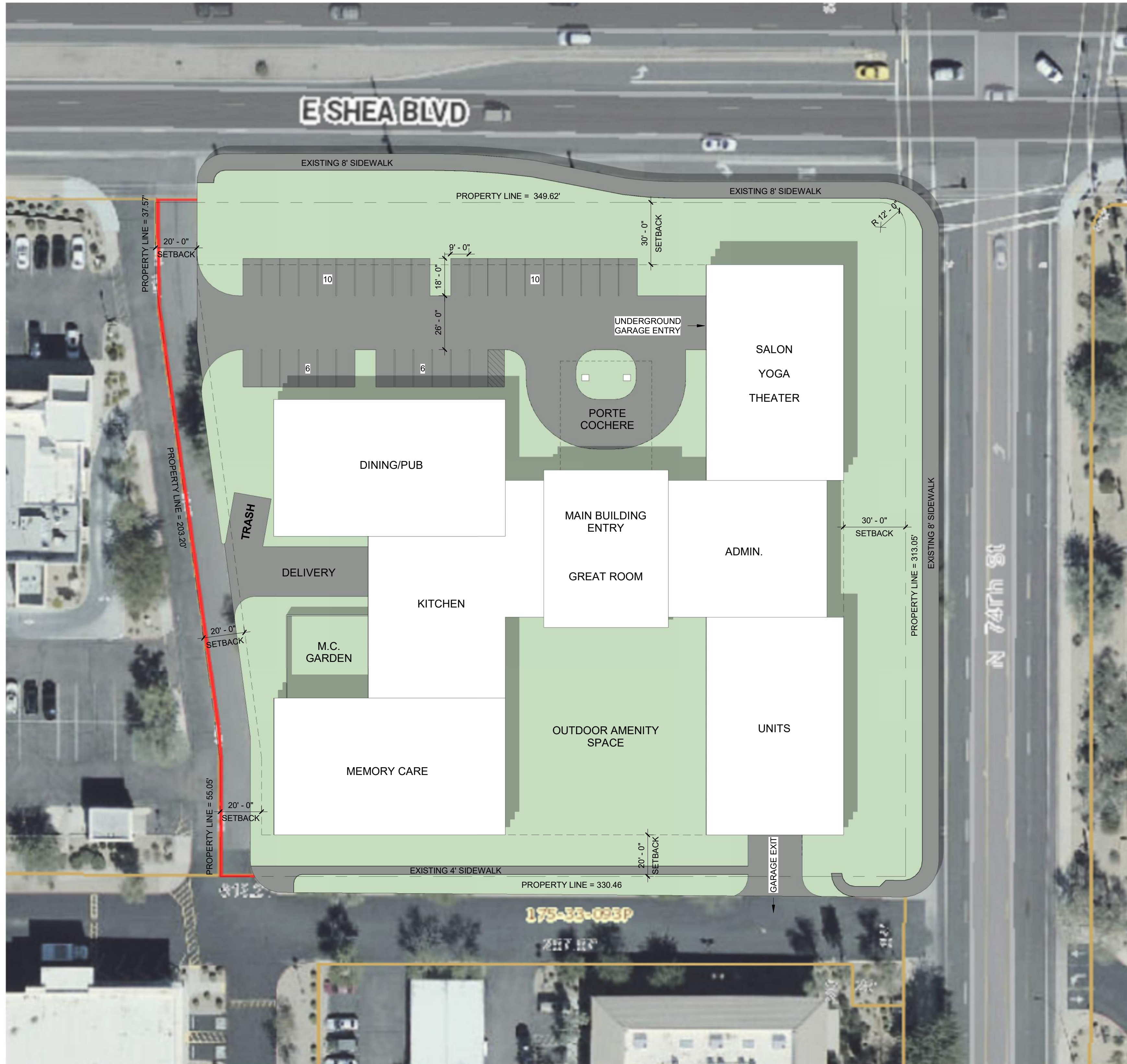
1 PROPOSED SITE PLAN A050 1" = 30'-0"