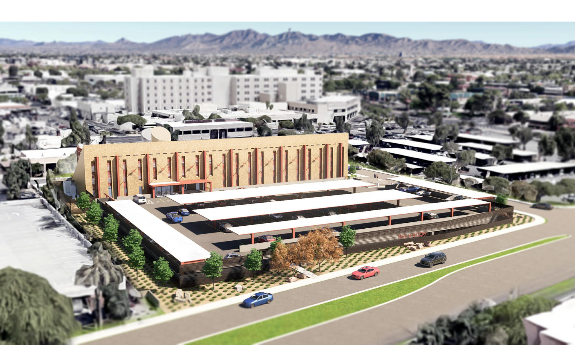
Aerial View from Southwest Corner of Site