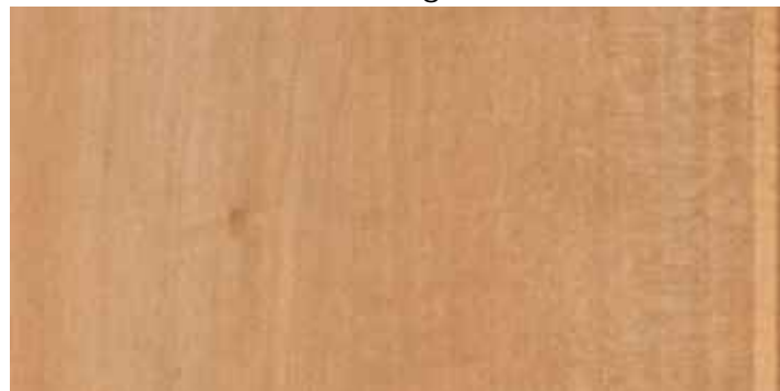
wd-1: 1x4 tongue and groove wood planks natural finish w/matte clear sealer