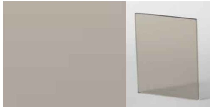
glz-1: insulated glazing unit solarcool 'solargray'

7120 E. MERCER LANE SCOTTSDALE, AZ 85254 DATE: 08/20/19