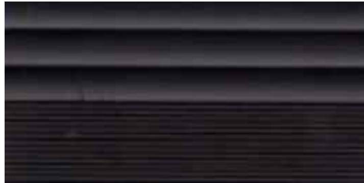
alum-1: aluminum storefront 'black' ab-8 by arcadia