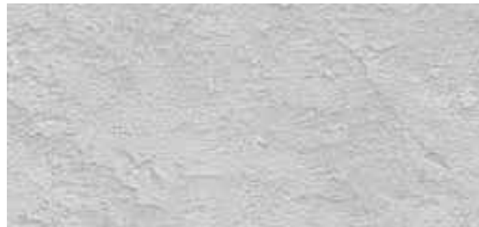
stc-1: integral colored stucco 'lariat' white by parex