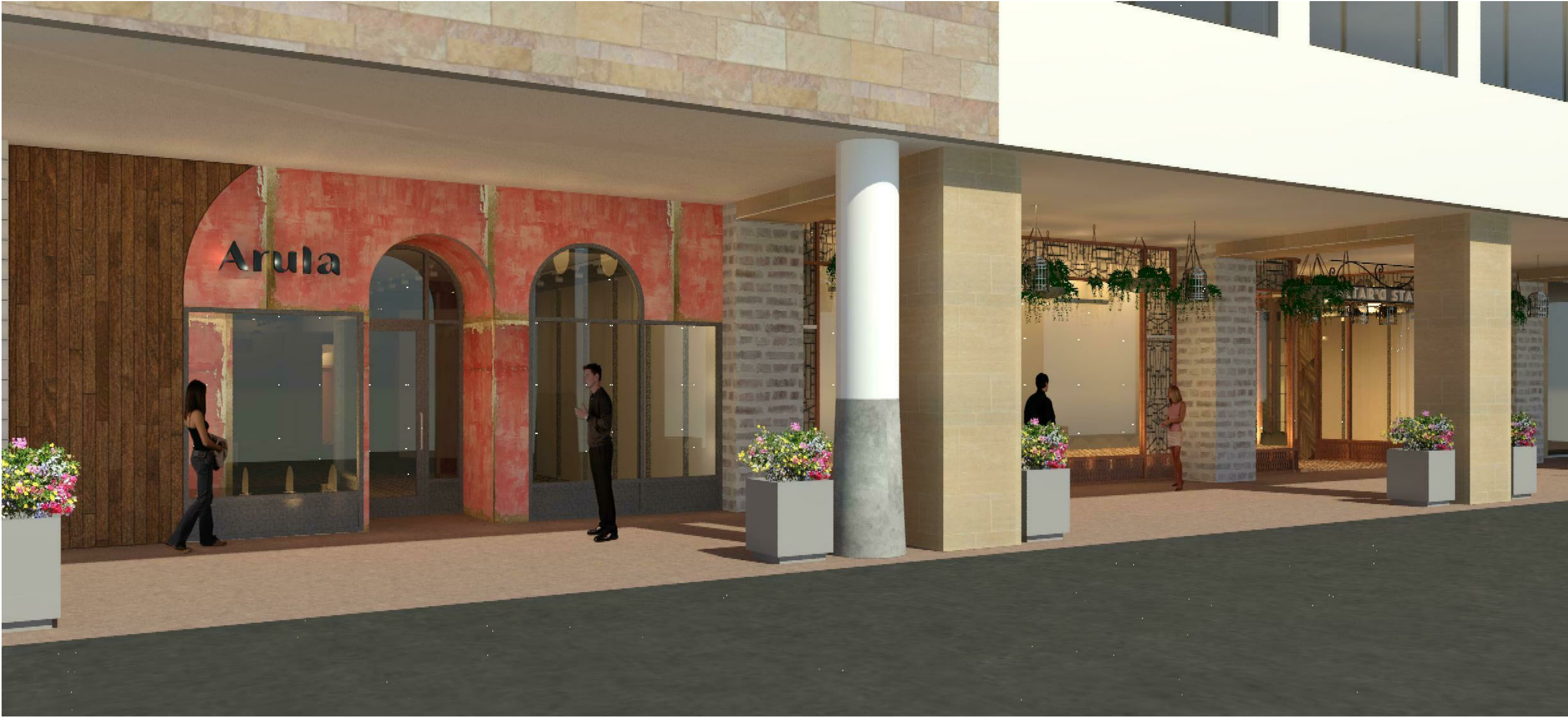
VIEW FROM N 72ND PLACE - FULL STOREFRONT RENDERING