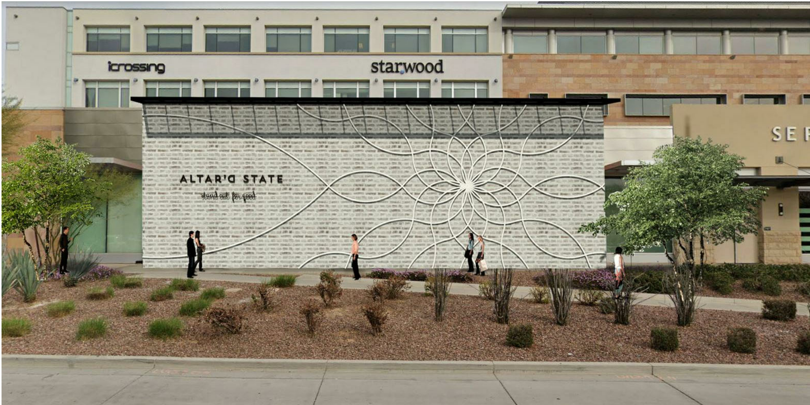
VIEW FROM N SCOTTSDALE ROAD