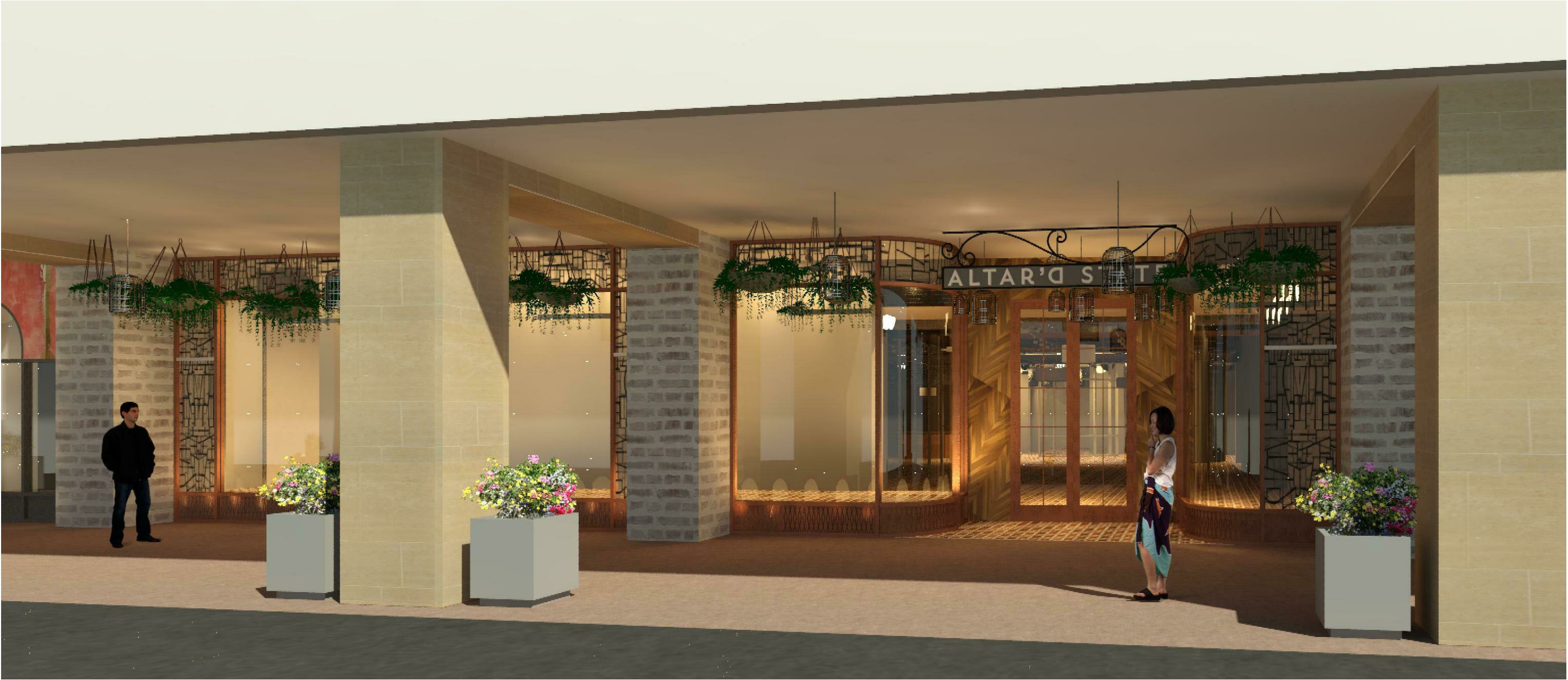
VIEW FROM N 72ND PLACE - ALTAR'D STATE ENTRY RENDERING