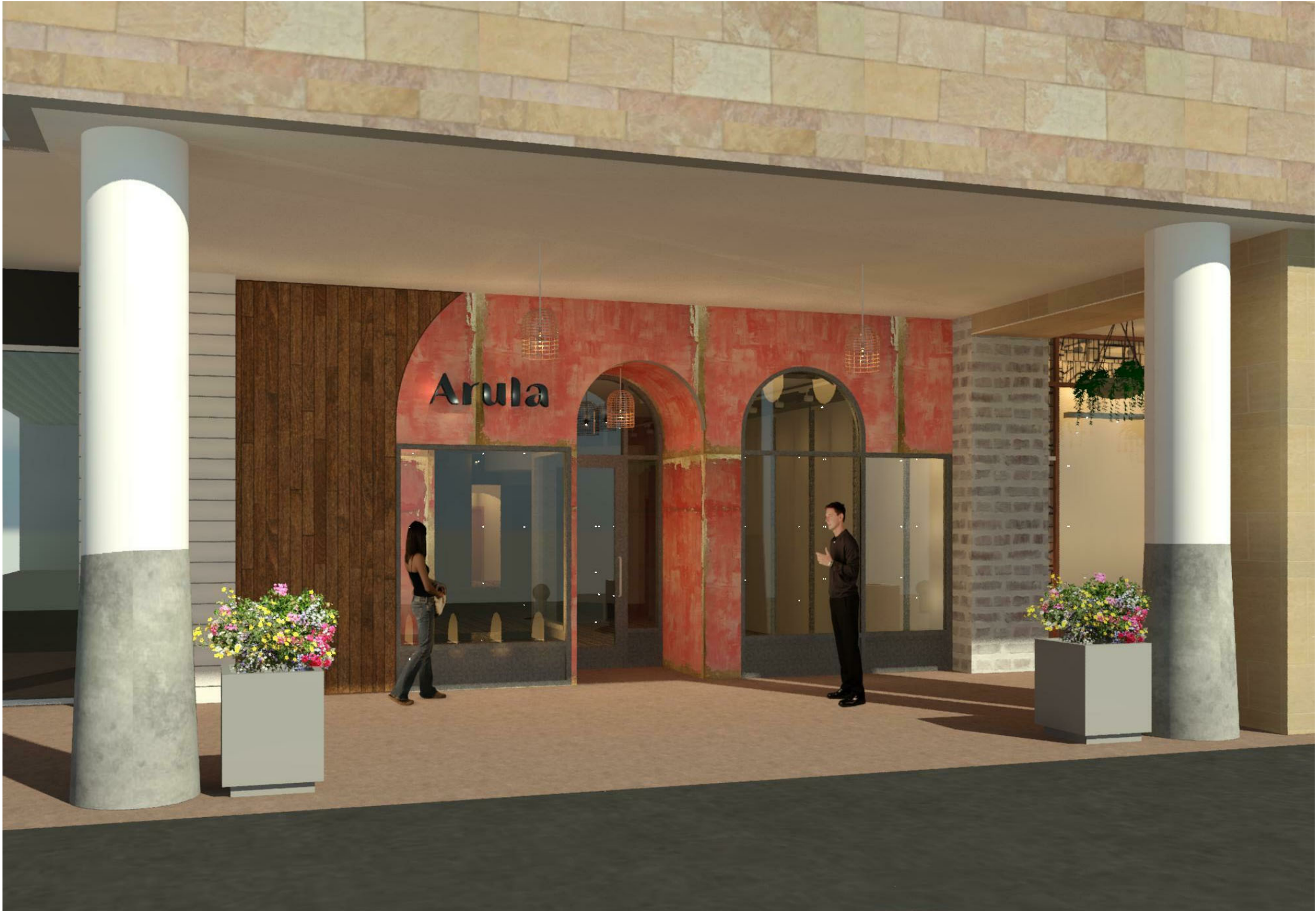
VIEW FROM N 72ND PLACE - ARULA ENTRY