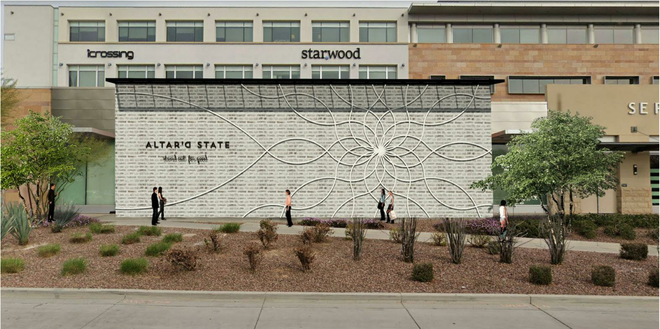
VIEW FROM N SCOTTSDALE ROAD