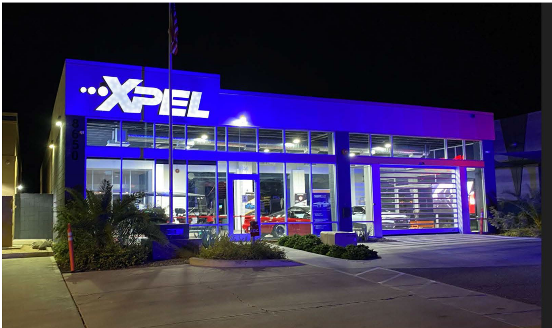
This is what this looked like prior to Casiano Holdings' refurbishing: