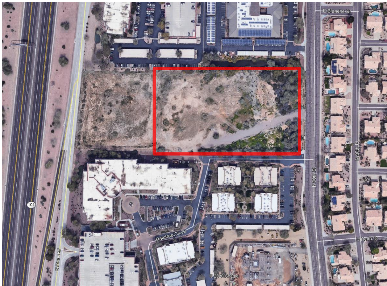
FIGURE 2 - Aerial