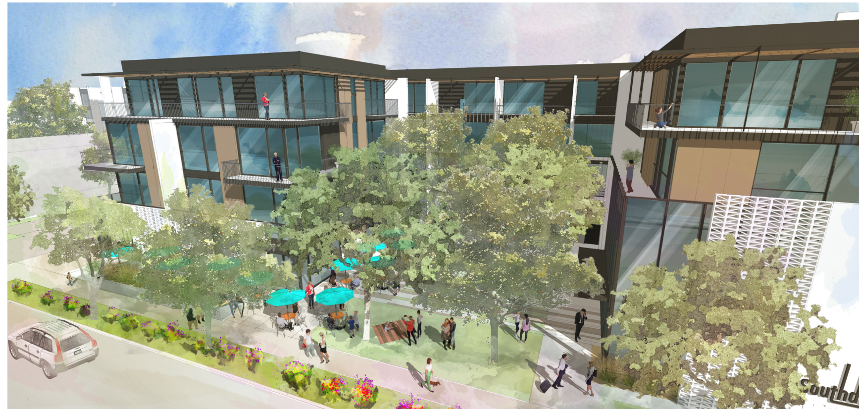
03 POCKET PARK - ELEVATED