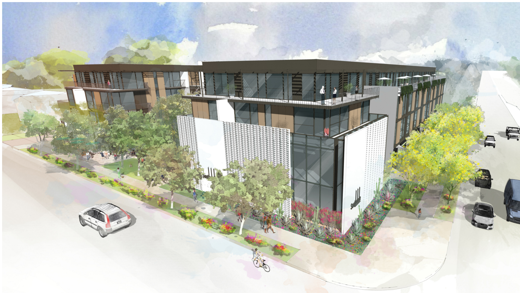
04 SOUTHWEST ELEVATED