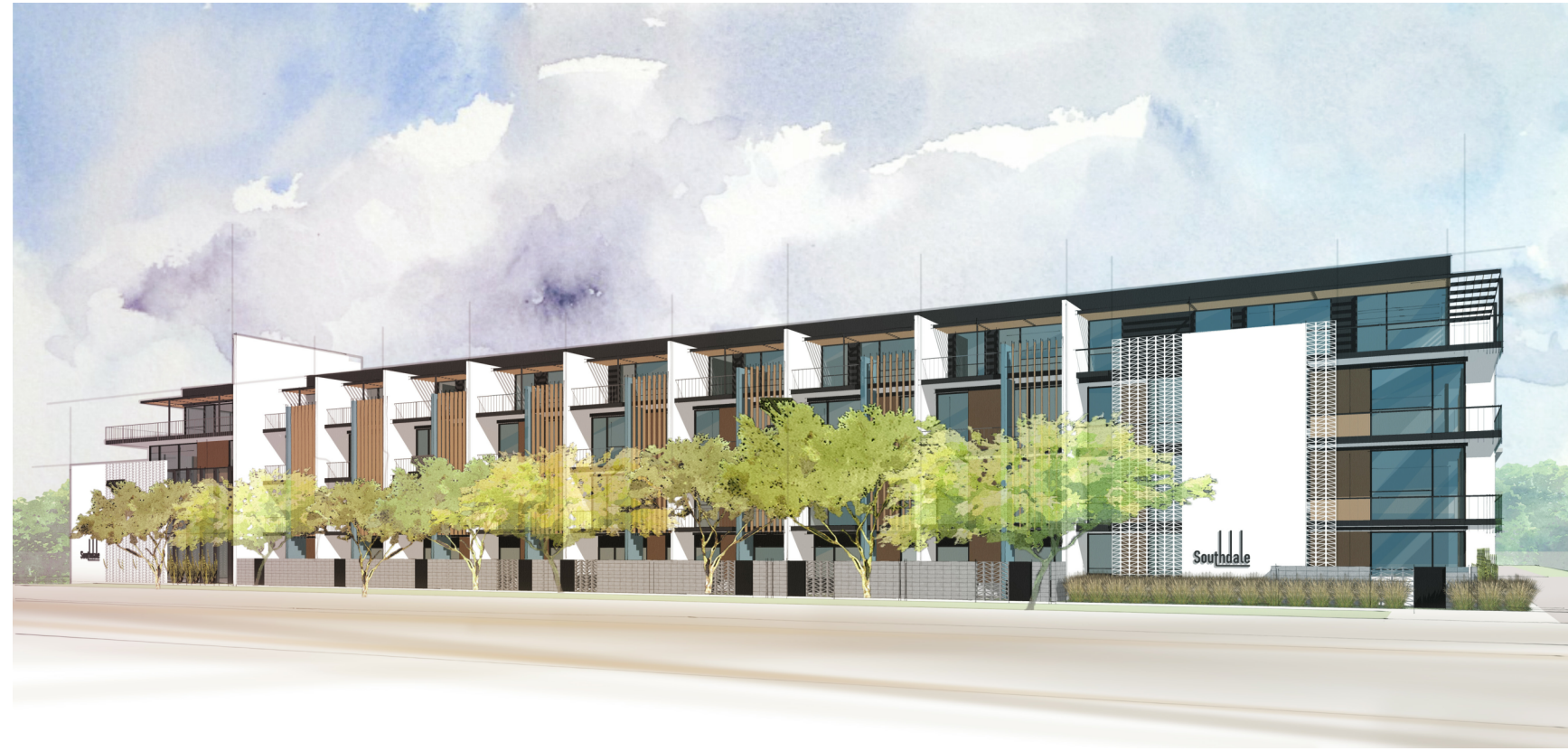
05 SOUTHEAST CORNER