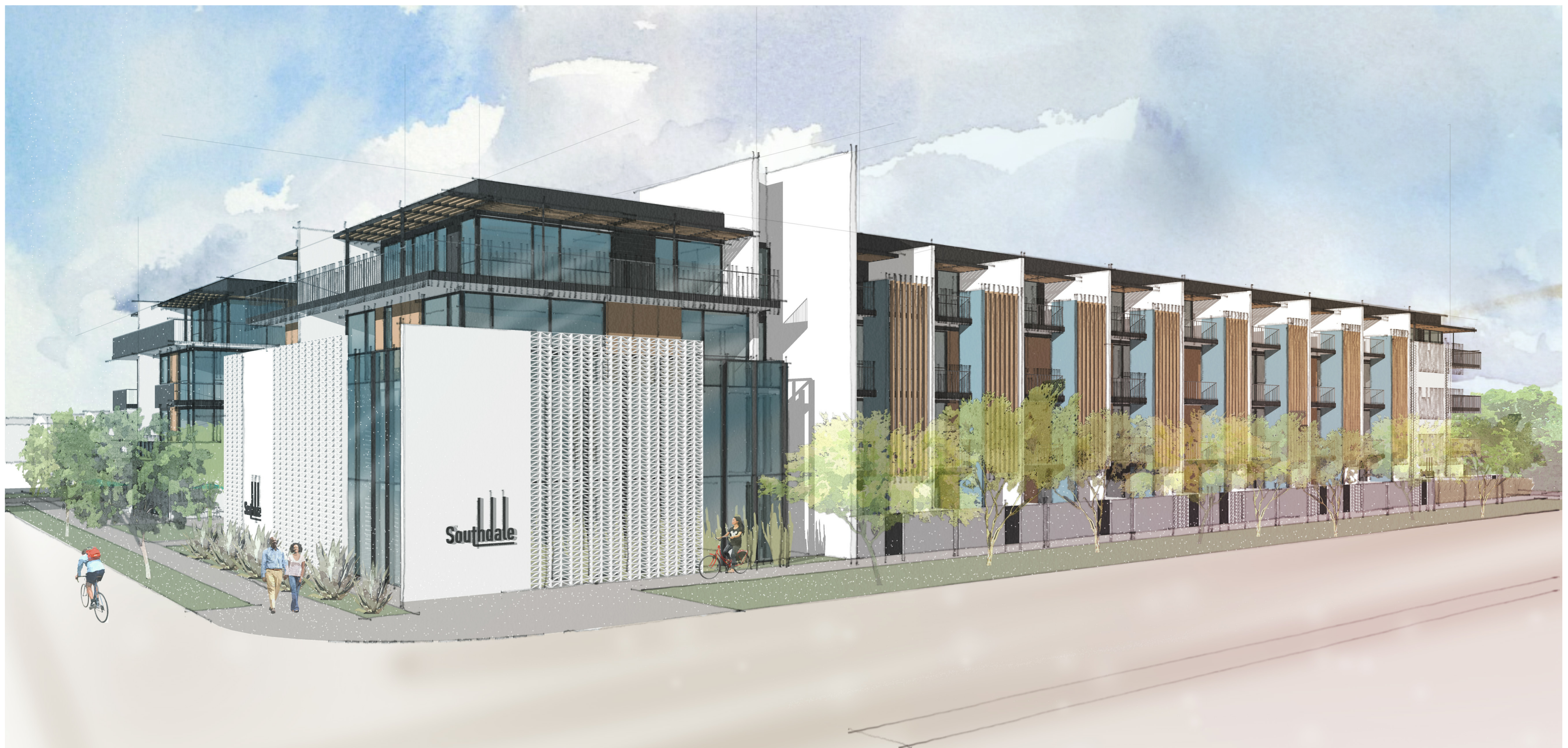
02 SOUTHWEST CORNER