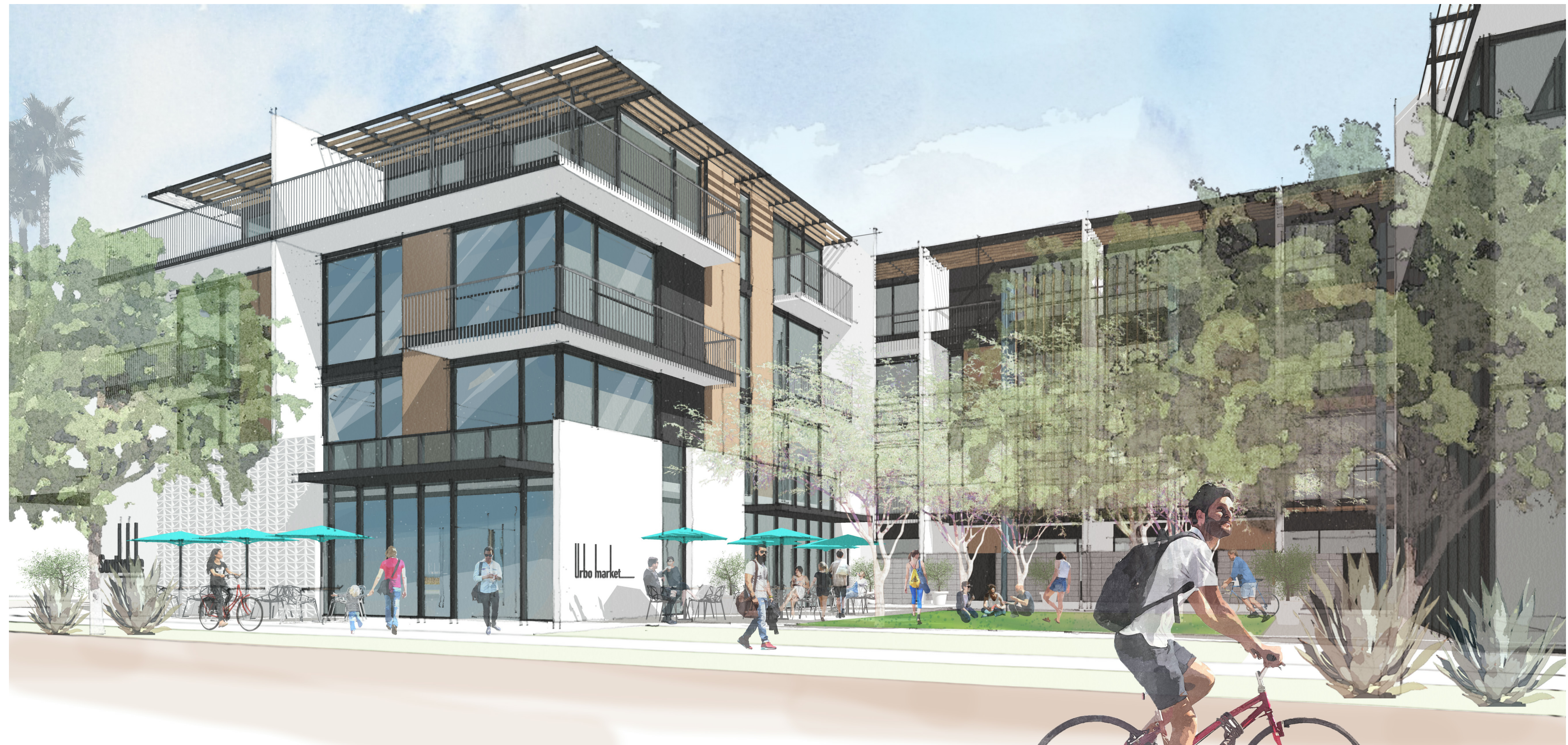
01 POCKET PARK