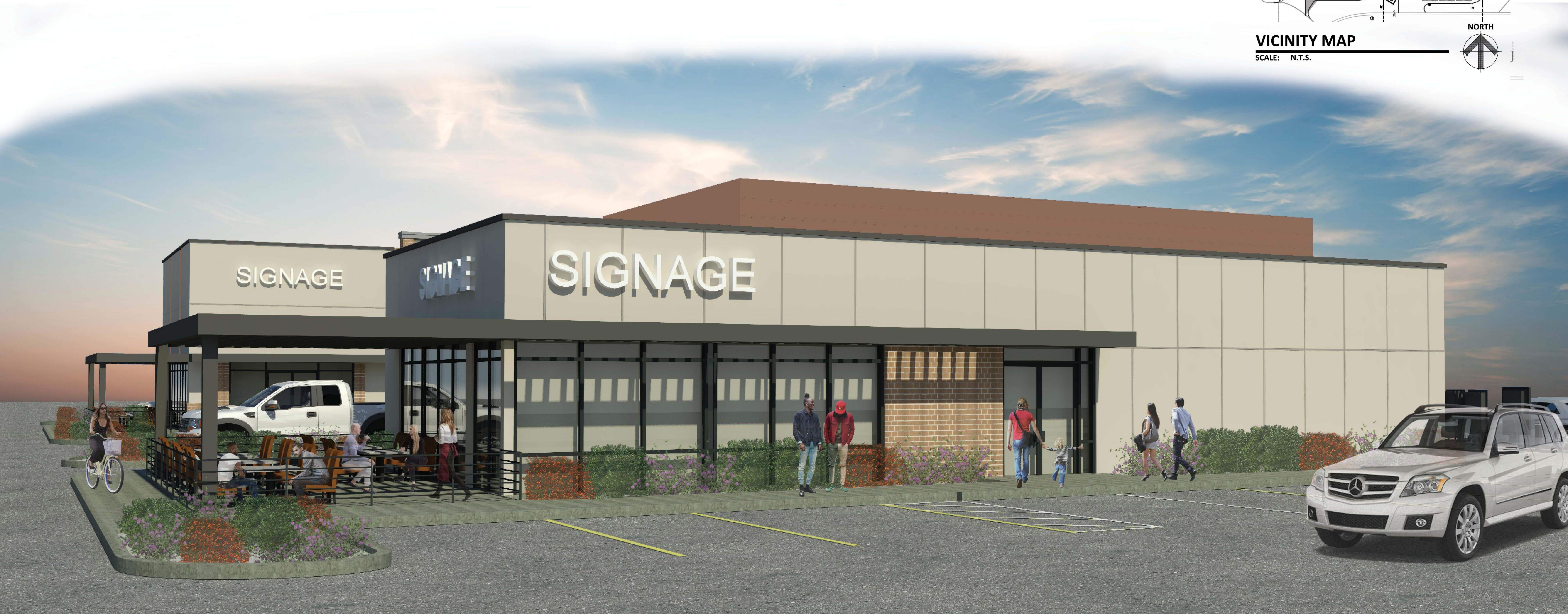
PERSPECTIVE VIEW 1