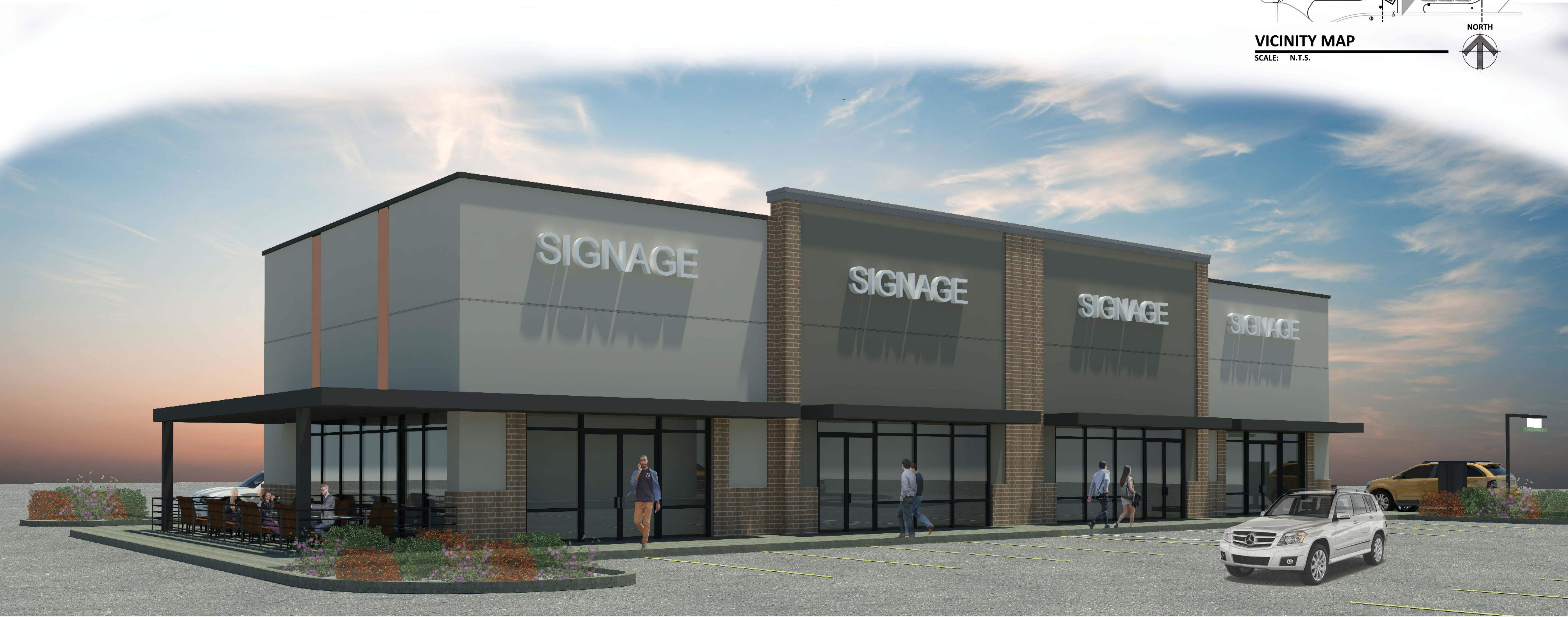
PERSPECTIVE VIEW 2