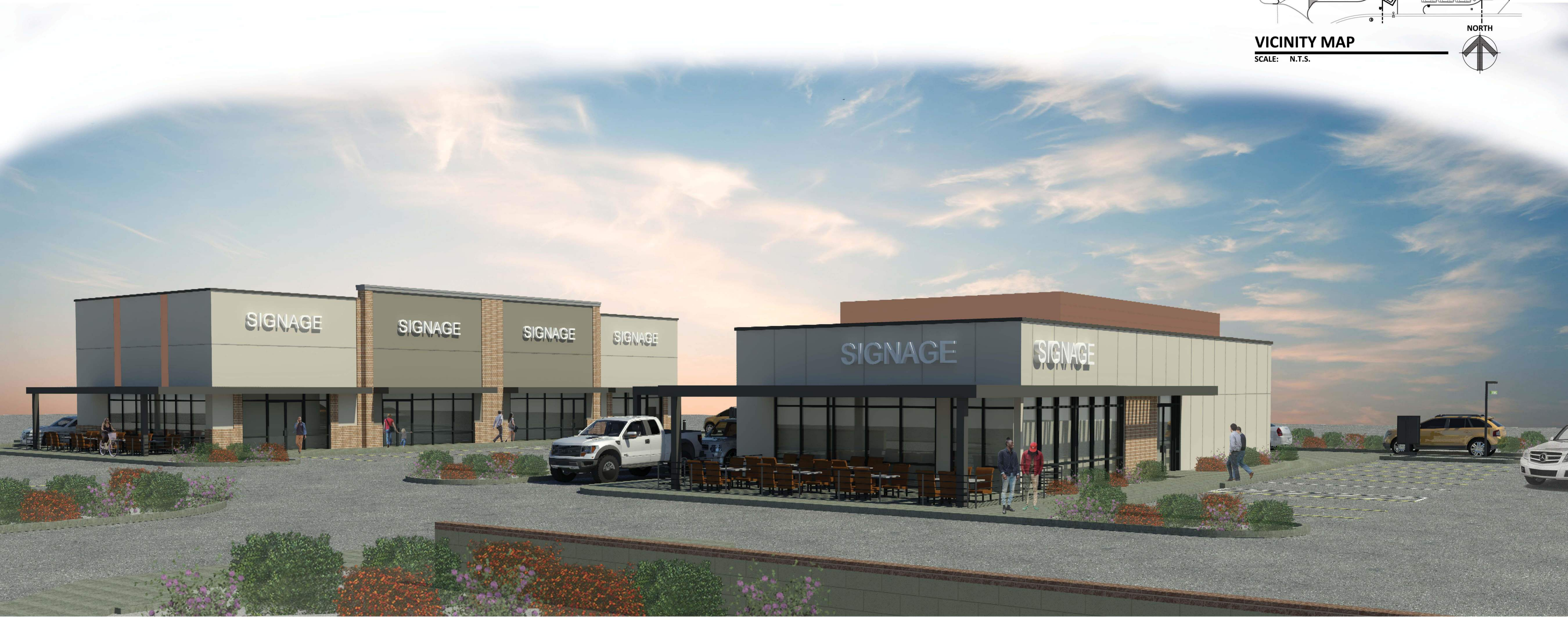
PERSPECTIVE VIEW 3