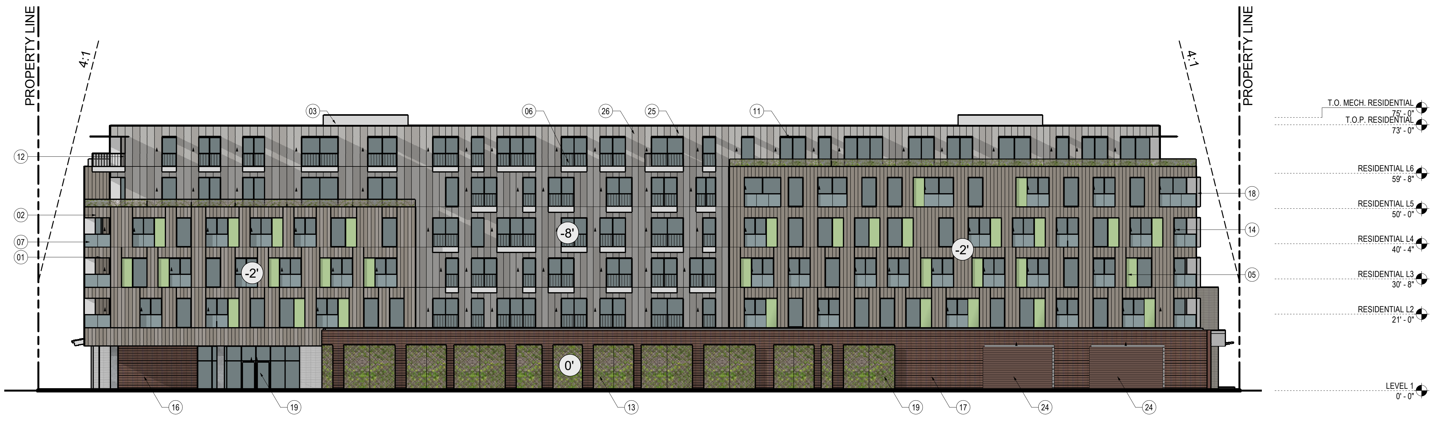
04 ELEVATION - RESIDENTIAL NORTH SCALE: 1/16" = 1'-0"