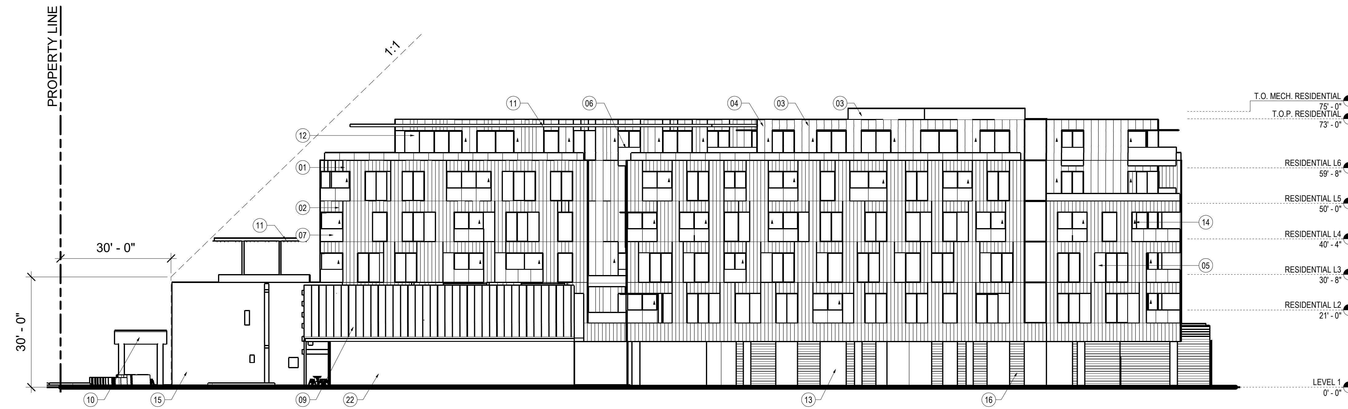
01 ELEVATION - RESIDENTIAL EAST BW SCALE: 1/16" = 1'-0"