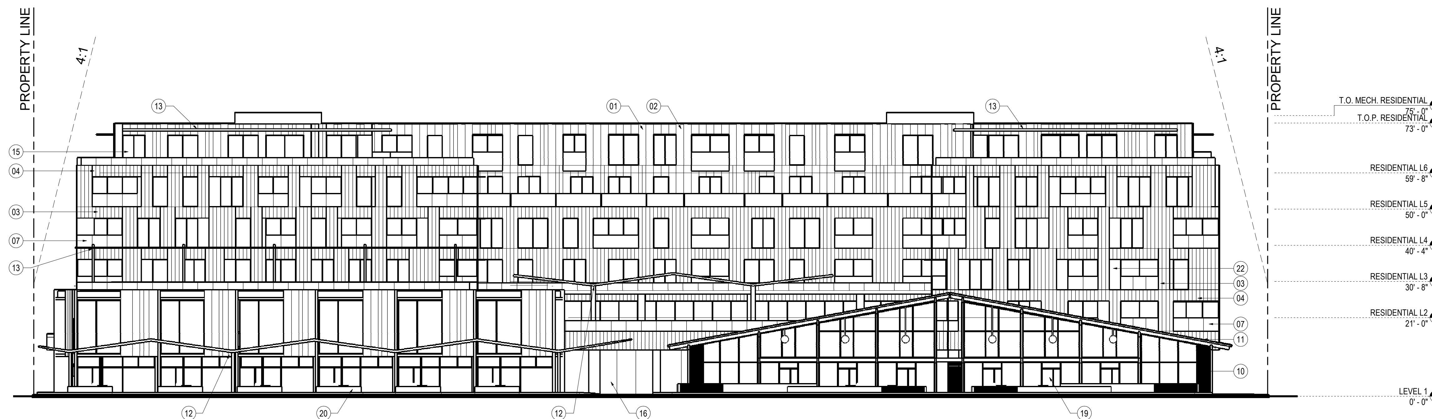
03 ELEVATION - RESIDENTIAL SOUTH BW SCALE: 1/16" = 1'-0"