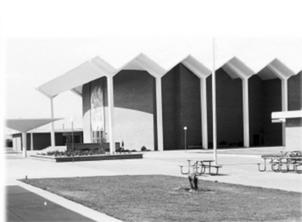
Coronado High School

3. Ingress, egress, internal traffic circulation, off-street parking facilities, loading and service areas and pedestrian ways shall be so designed as to promote safety and convenience.