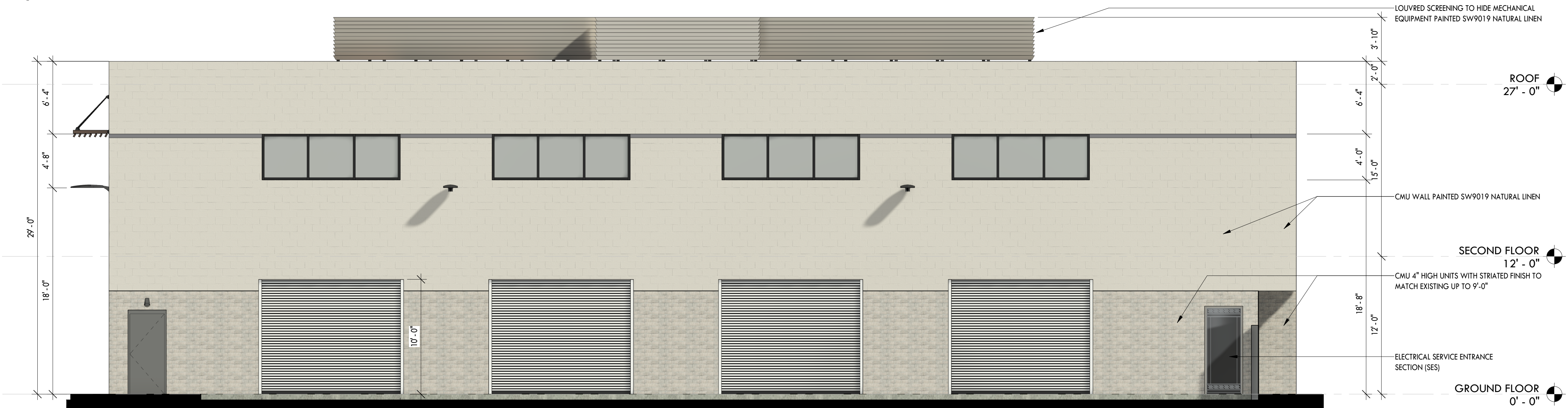
3 NORTH ELEVATION PROPOSED BUILDING