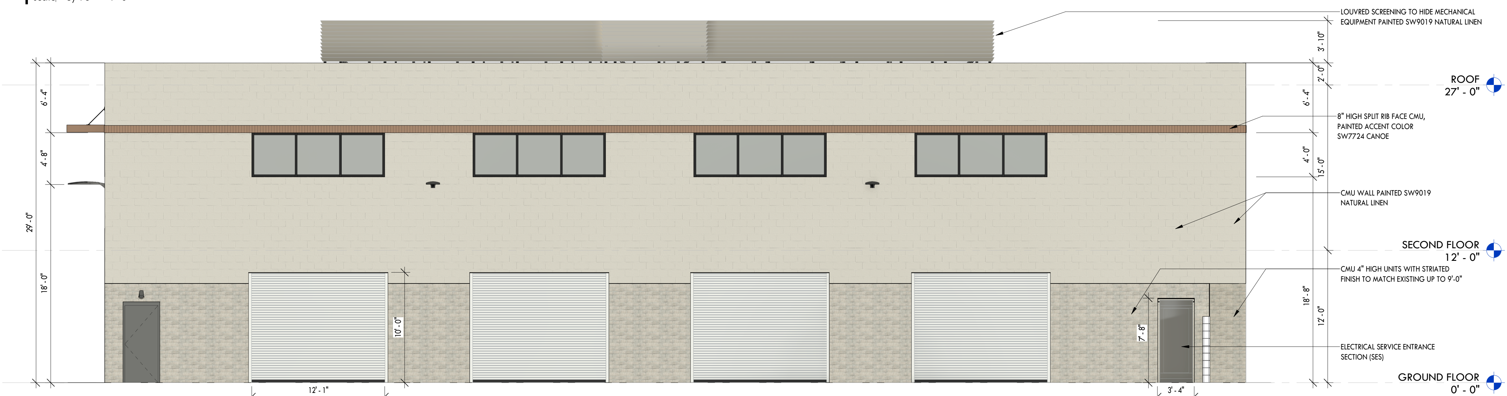
3 NORTH ELEVATION_PROPOSED BUILDING scale 3/16" = 1'-0"