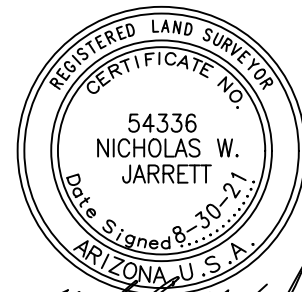
EXHIBIT 2B MADE APART BY REFERENCE HEREON.

THE NORTH 15 FEET OF THE NORTHWEST QUARTER OF THE SOUTHEAST QUARTER OF THE SOUTHWEST QUARTER OF THE SOUTHEAST QUARTER OF SAID SECTION 35.