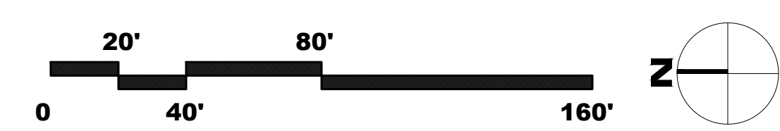
1 PEDESTRIAN AND VEHICULAR CIRCULATION PLAN scale: 1" = 40'