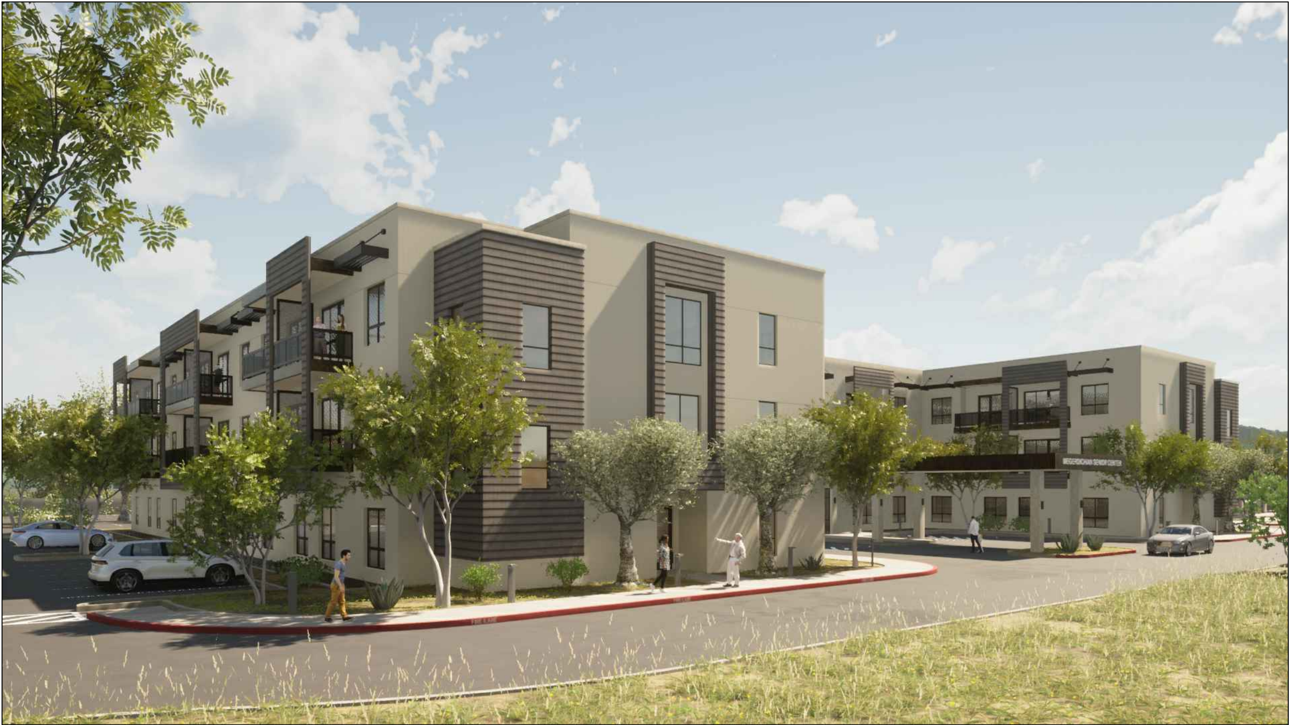
1 PERSPECTIVE - RESIDENTIAL HEALTH CARE FACILITY BUILDING 1 NTS