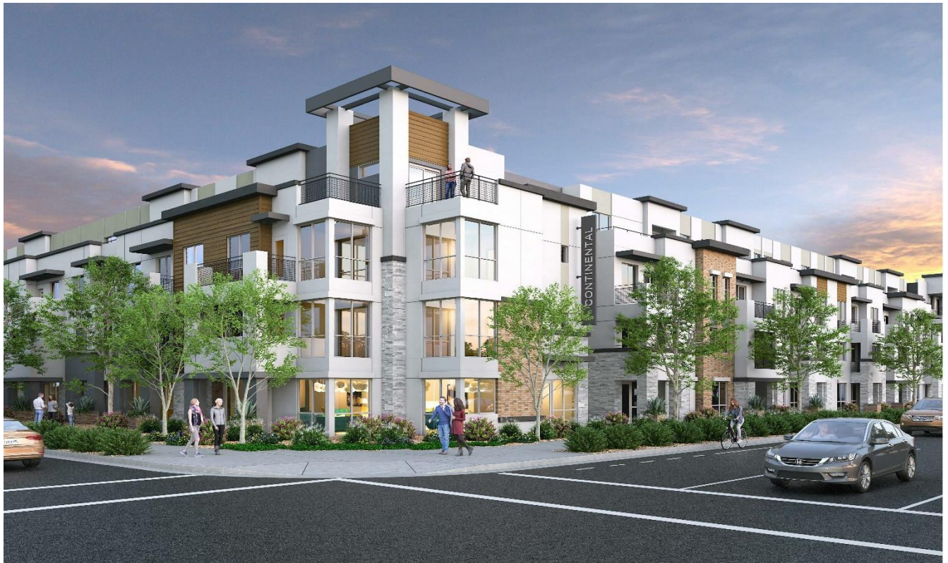
Variety of Materials, Colors, Textures and Façade Articulation on Typical Elevation

project also provides a commercial use at the first floor along nearly the entire southern street frontage and a large portion of the western street frontage. The northern courtyard of the project provides a window into the community, creating visual interest for those on-foot and in cars along Scottsdale Road. The project integrates various appropriately scaled design elements. This is apparent at the pedestrian scale with the first-floor covered entries with unique built-in vertical light fixtures, access gates, differentiated building materials, and planters with building integrated bases. This is also evident from a more distant scale with the appealing, dynamic roofline and color / material changes. Most notably, this latter sense of physical scale is accomplished with the memorable tower element at the street corner.