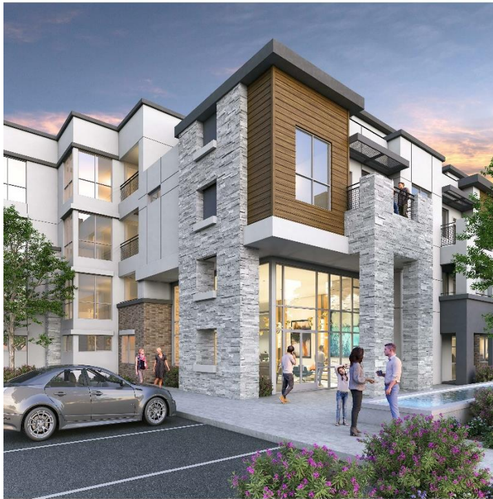
Southwest Corner of the Building Entering the Lobby / Leasing Office

Response: The project provides vast improvements to the public realm along Scottsdale Road and along Continental Drive. New landscaping, sidewalks and numerous pedestrian connections to and from the public realm convey an inviting and quality project. A new pedestrian connection along the north property line is also proposed to enable adjacent residents a direct connection through the subject site to the pedestrian realm along Scottsdale Road.