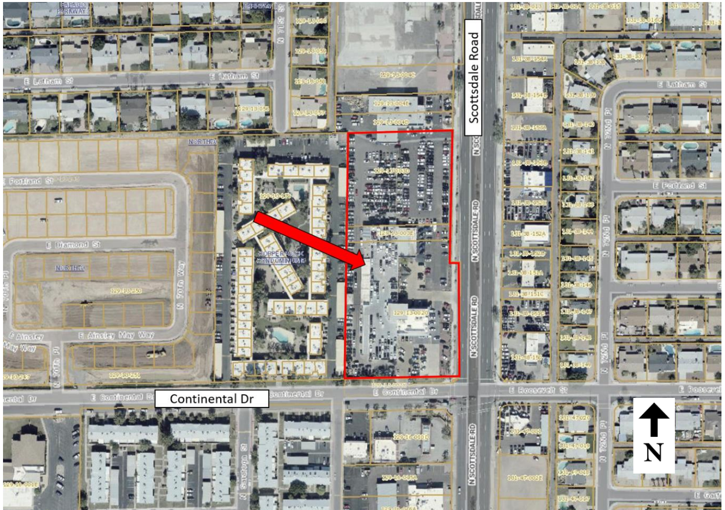
The Project is Located on the Site of a Former Automotive Dealership and Along a Commercial Corridor