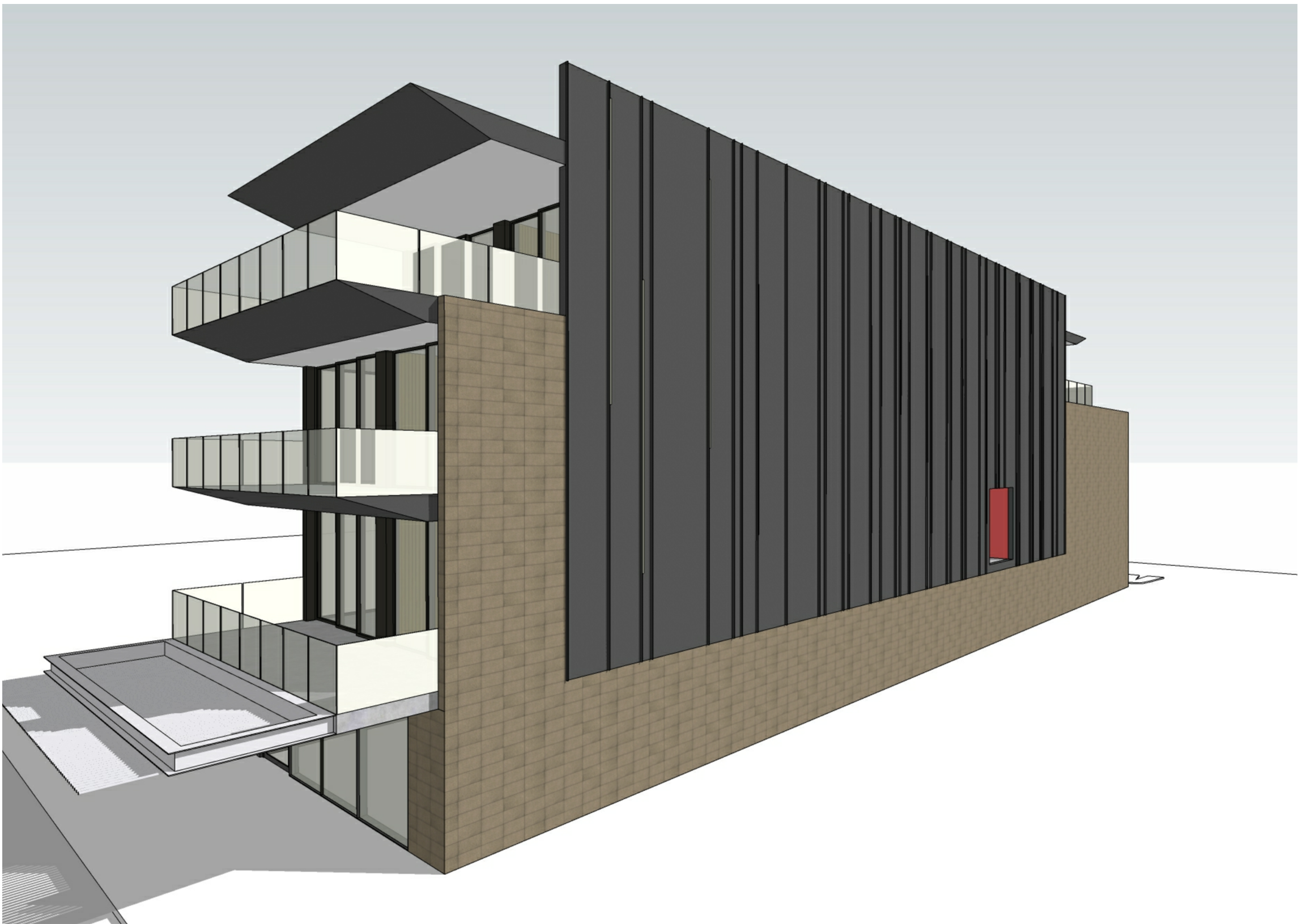
S/W CORNER - MARSHALL WAY