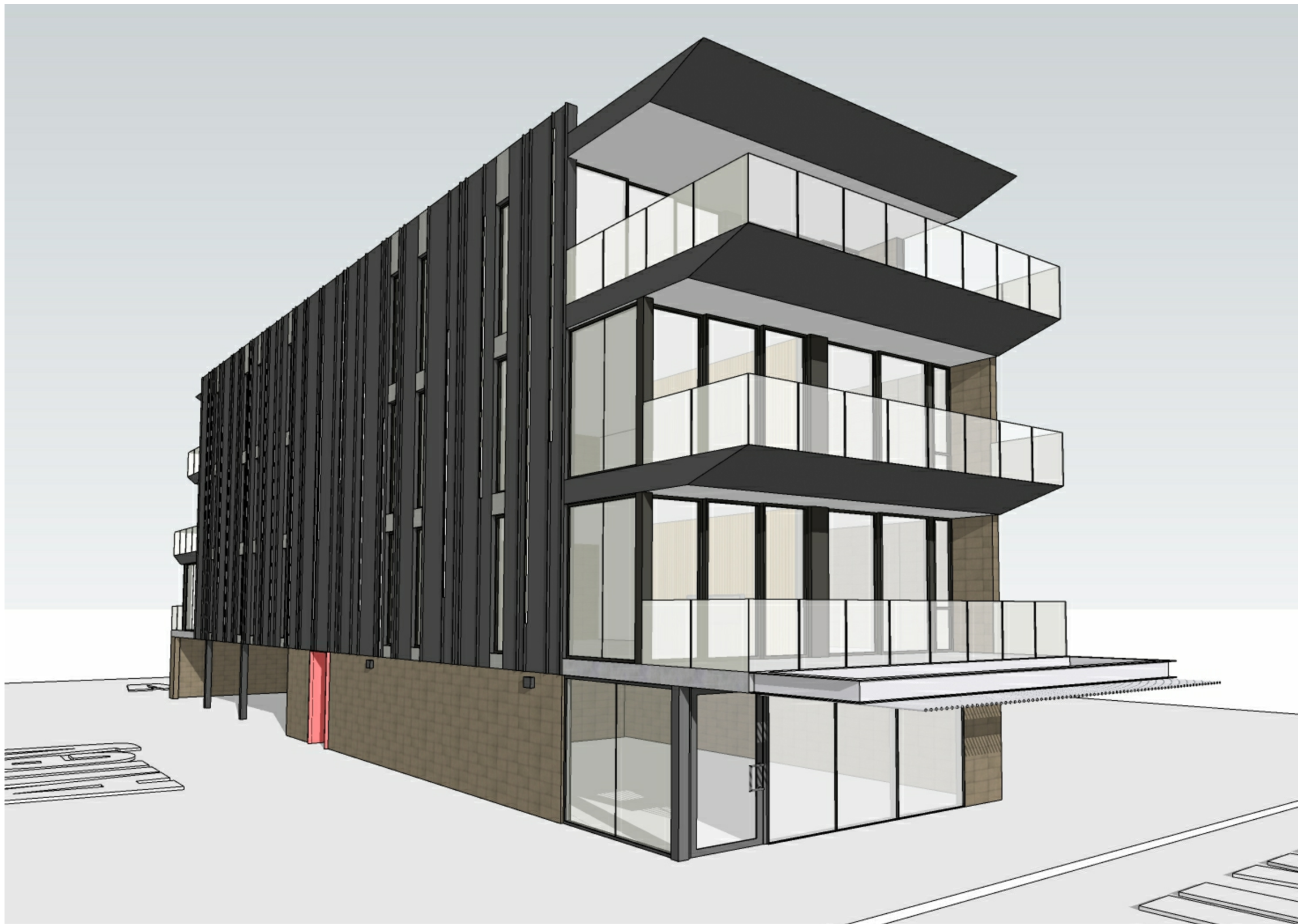
N/W CORNER - MARSHALL WAY