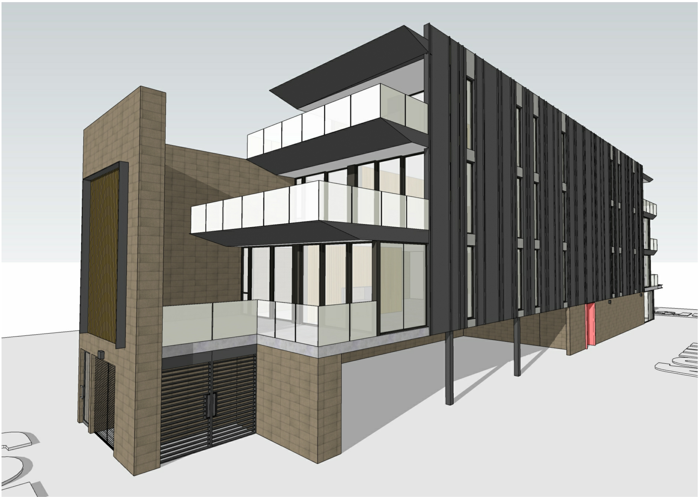
N/E CORNER - ALLEY