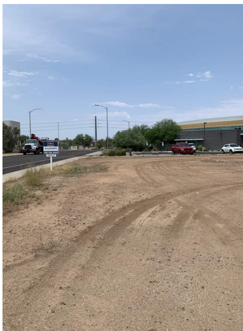
SITE PHOTO 22