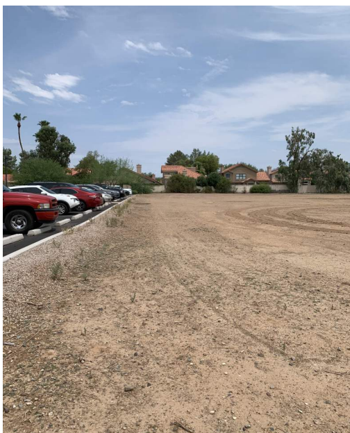
SITE PHOTO 3