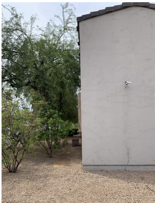
SITE PHOTO 13