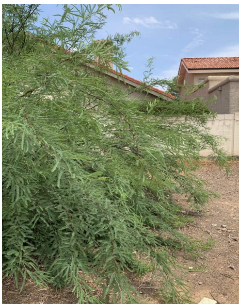
SITE PHOTO 7