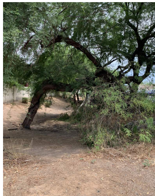
SITE PHOTO 12