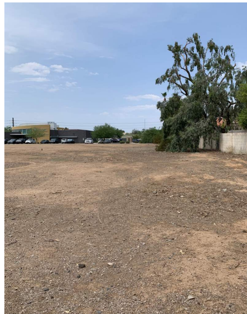
SITE PHOTO 10