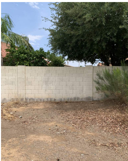
SITE PHOTO 11