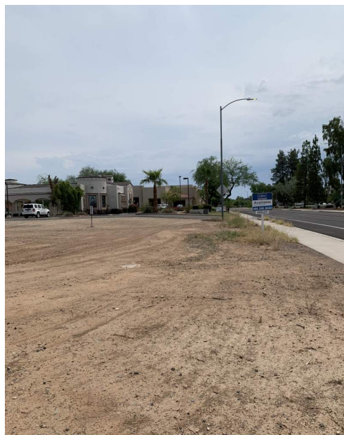
SITE PHOTO 4