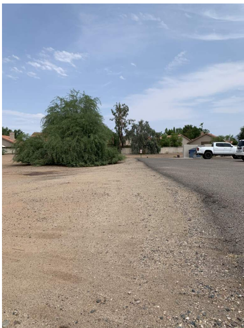
SITE PHOTO 23