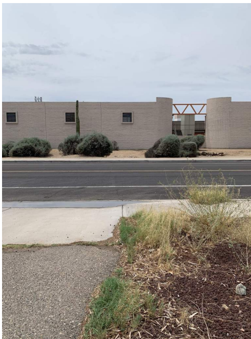
SITE PHOTO 21