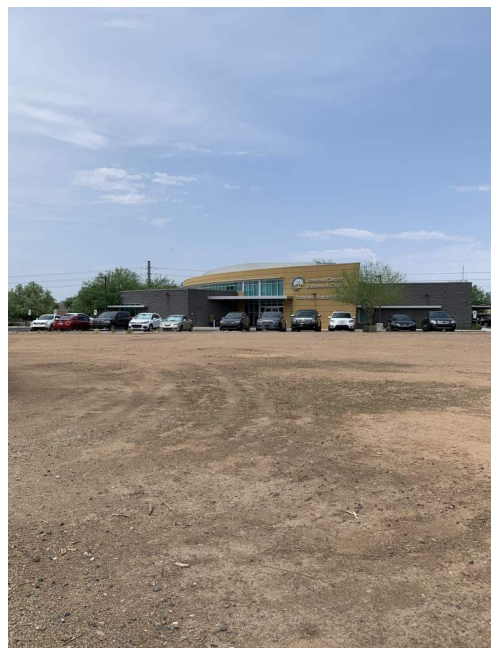
SITE PHOTO 18