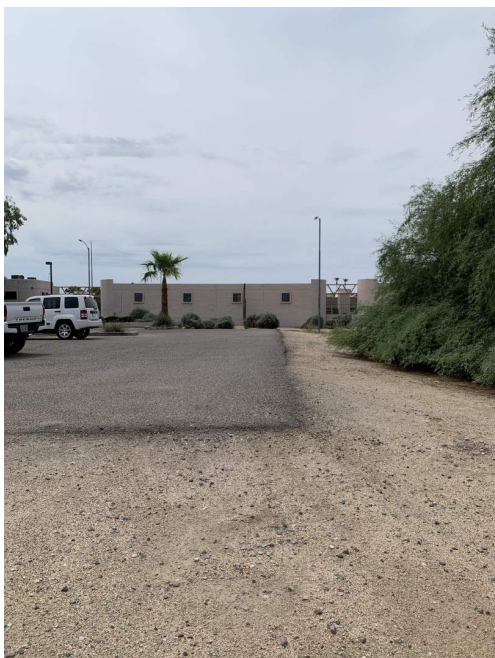
SITE PHOTO 17