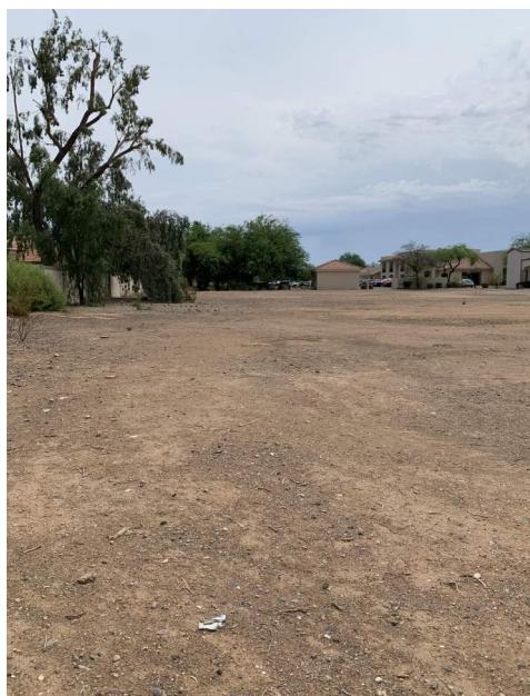
SITE PHOTO 8