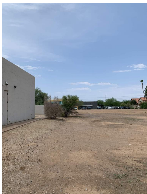
SITE PHOTO 14