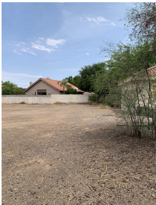
SITE PHOTO 15