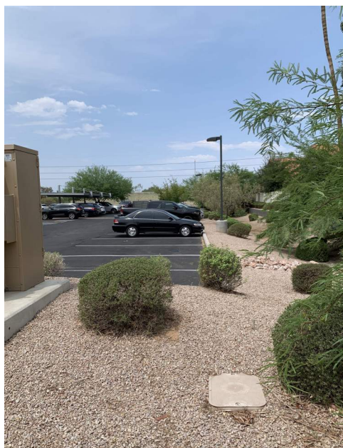
SITE PHOTO 6