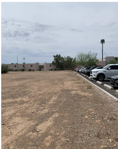
SITE PHOTO 5