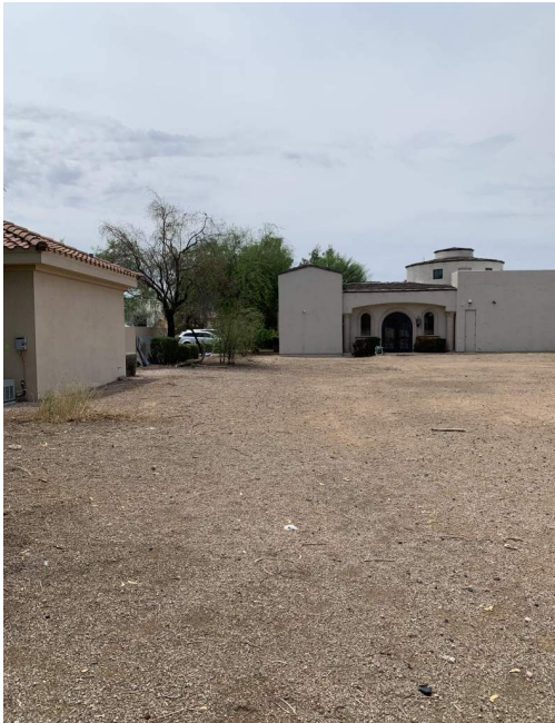
SITE PHOTO 9