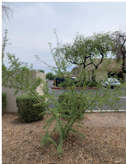
SITE PHOTO 16