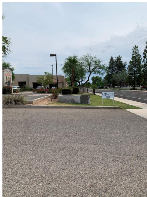
SITE PHOTO 24