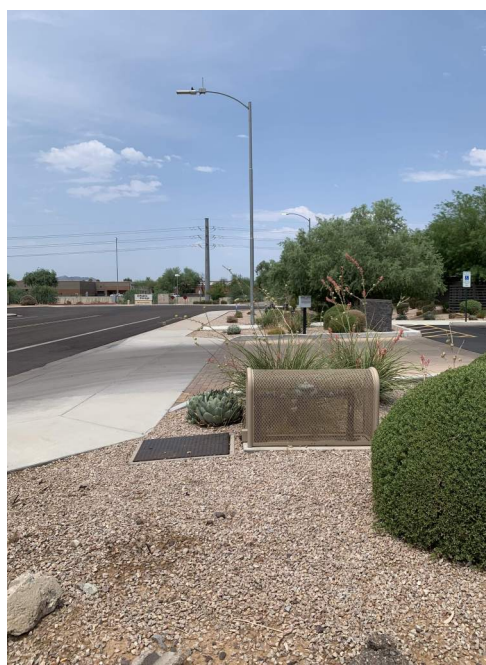
SITE PHOTO 2