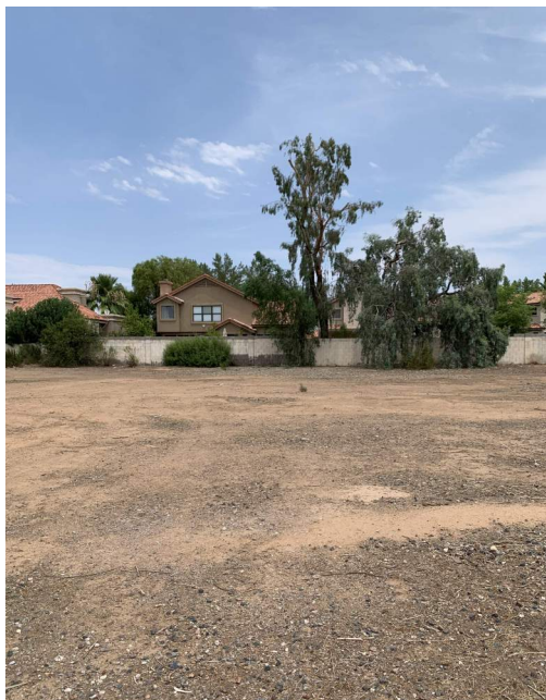
SITE PHOTO 19