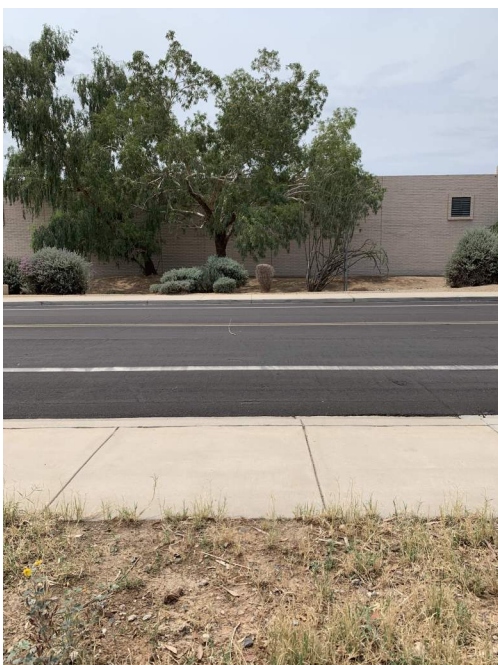
SITE PHOTO 1