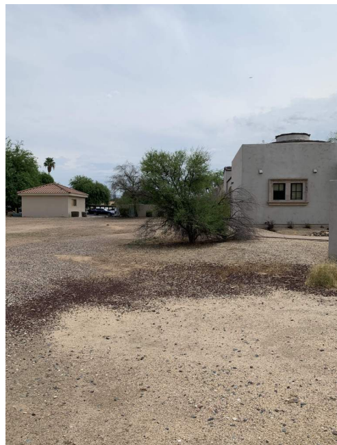
SITE PHOTO 20