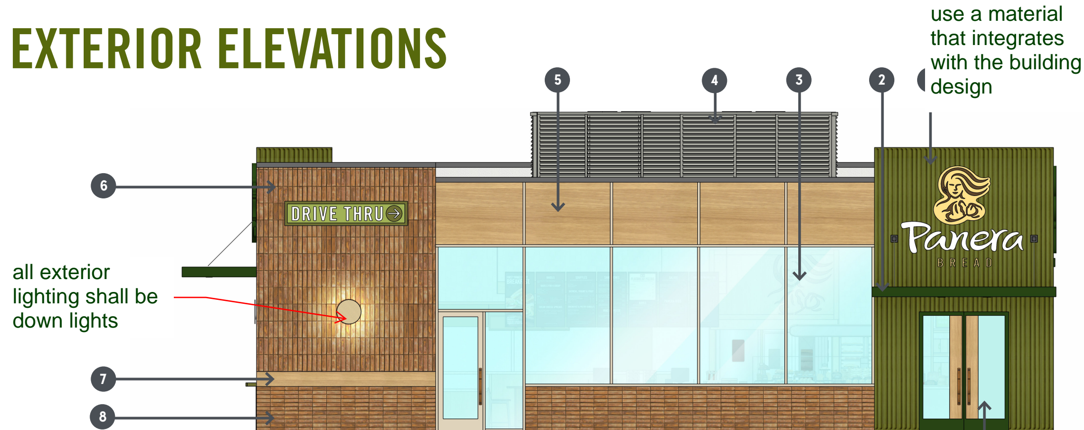
Front / Main Entry Elevation