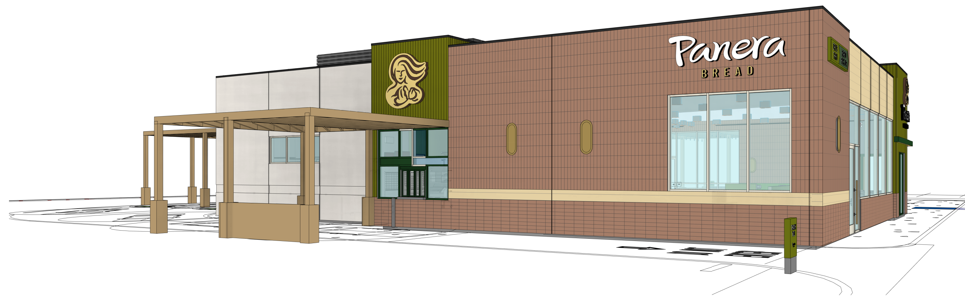
2 | EXTERIOR VIEW AT DRIVE THRU