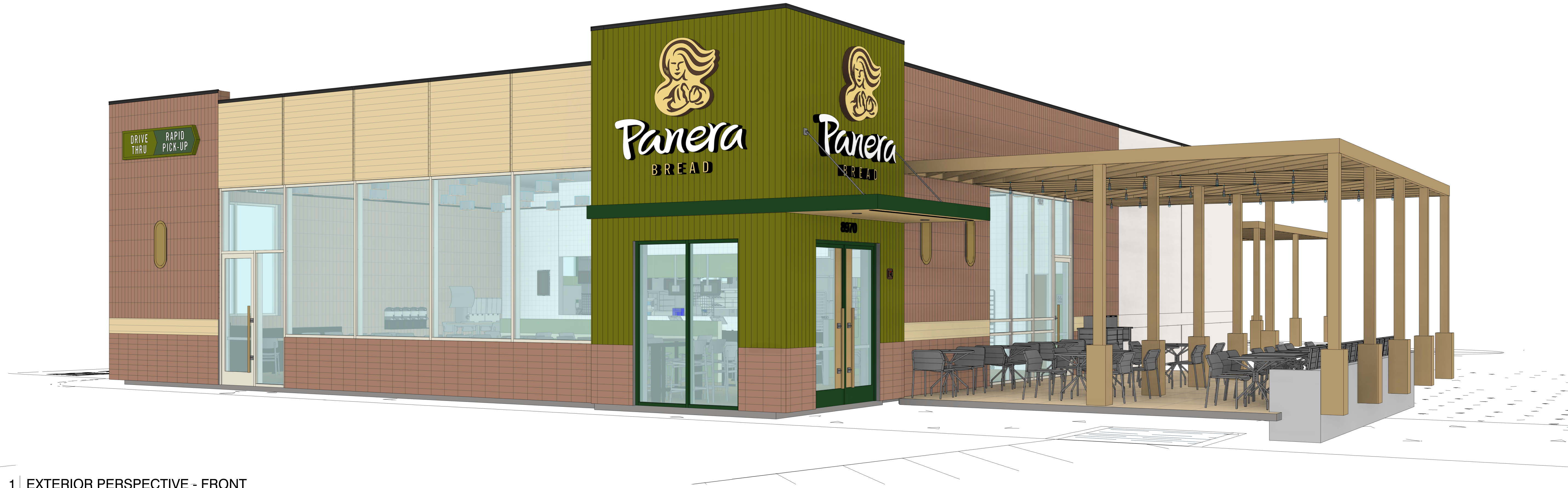
1 | EXTERIOR PERSPECTIVE - FRONT