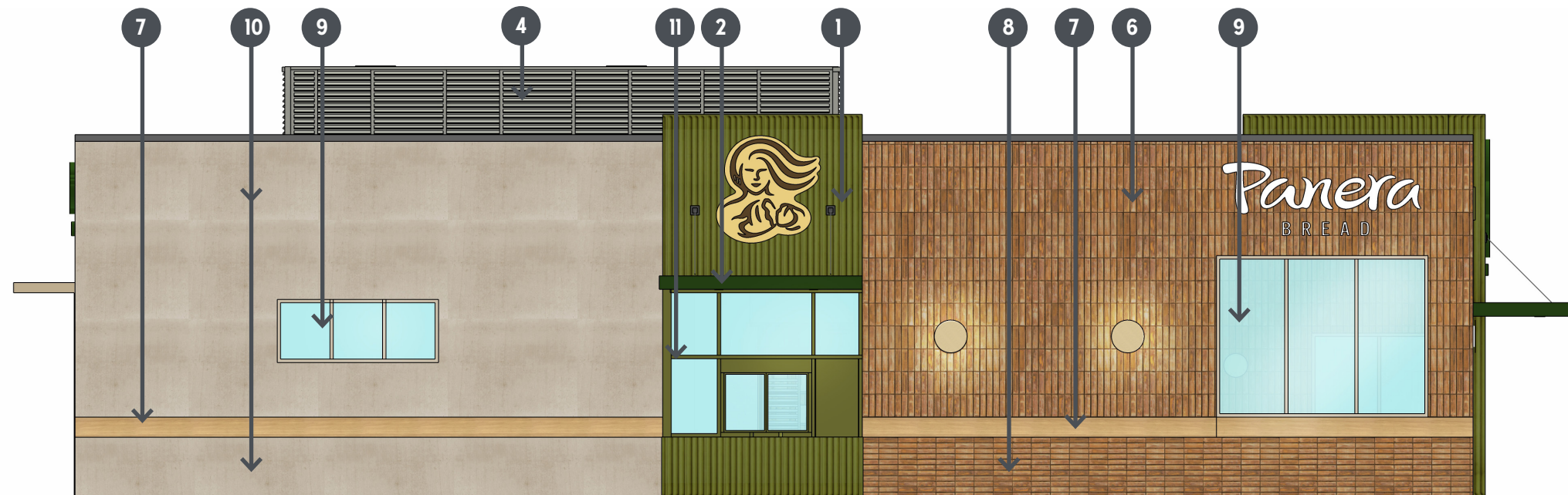
Side / Drive Thru Window Elevation