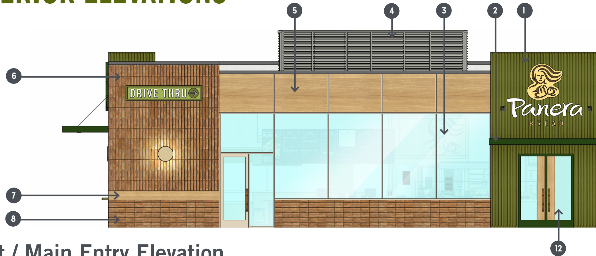
Front / Main Entry Elevation